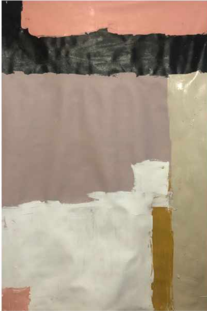
AXIOM Studio "Retrograde" 2020 Acrylic on Canvas 25 x 64 inches