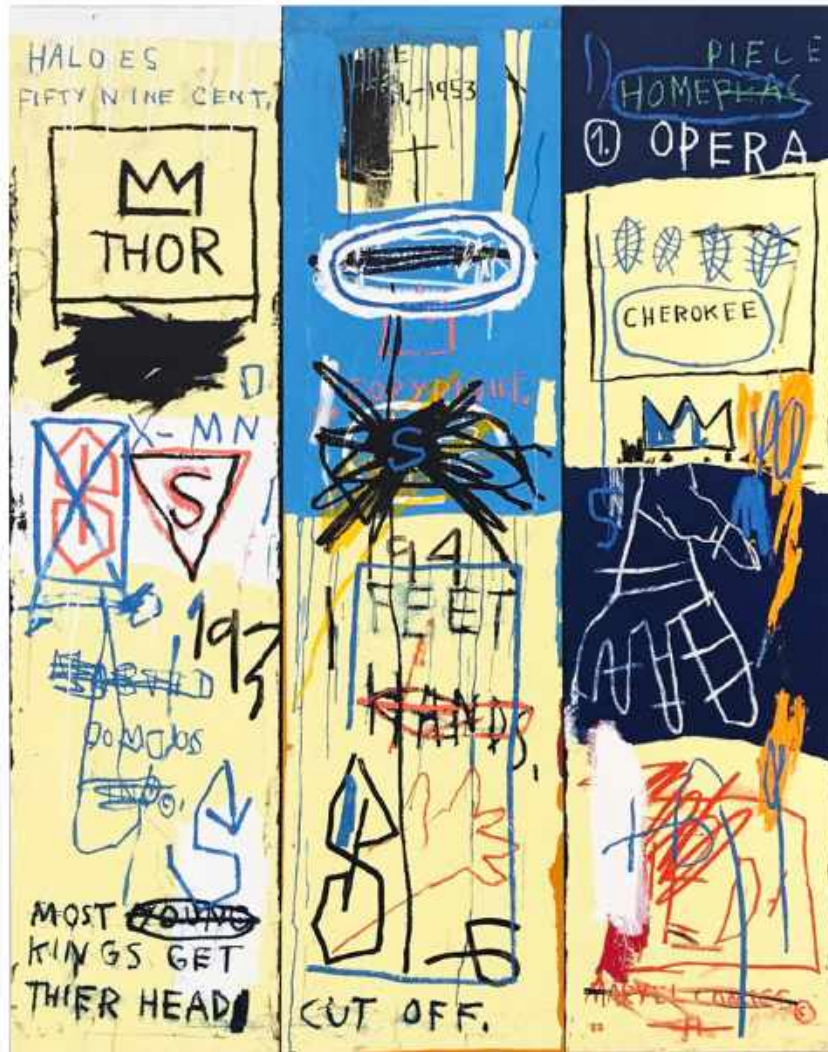
Jean-Michel Basquiat “Charles the First” 1982/2005 Screenprint Edition of 85 48 x 61 inches