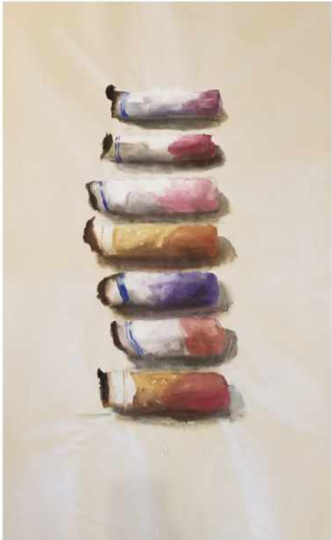
Svejda "Trashy Butt Classy" Oil on Canvas 2018 30 x 48 inches