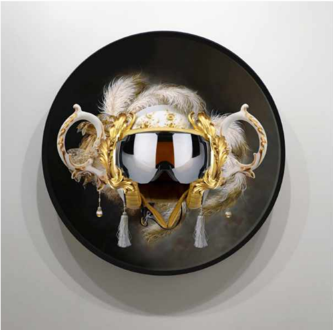
Lucio Carvalho "Dream Protector" Oil on Canvas 50 inch diameter