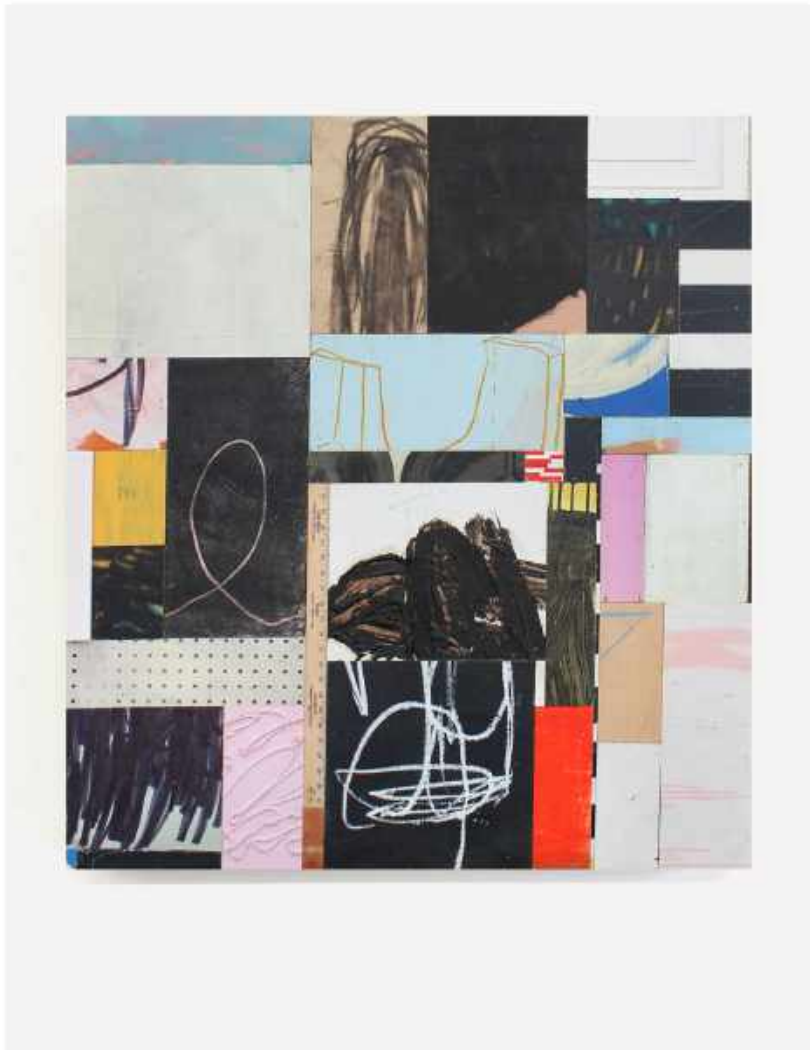
Cameron Wilson Ritcher "Centripidal Force, Laminate Flooring" 2020 Mixed media on panel, flush mounted on pine cradle 46 x 50 inches