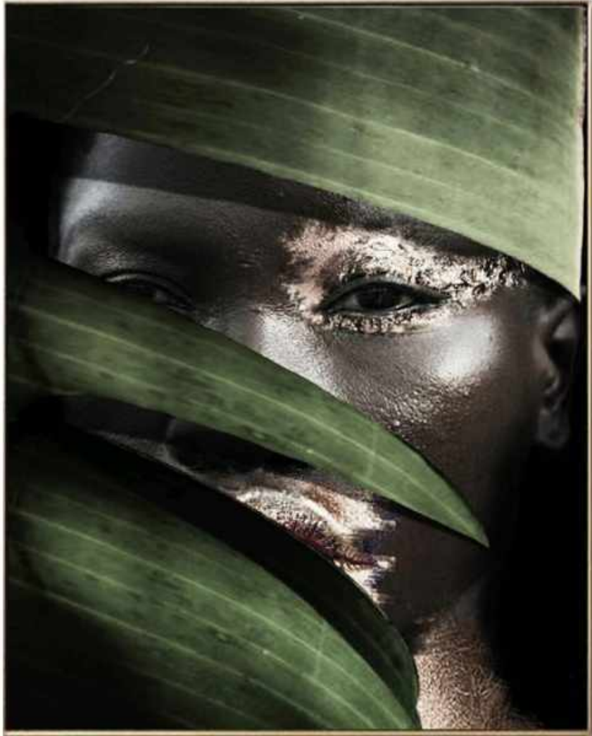
Marcelo Kovalev "Brazil" Acrylic on Canvas and Digital Intervention, Printed Under Acrylic