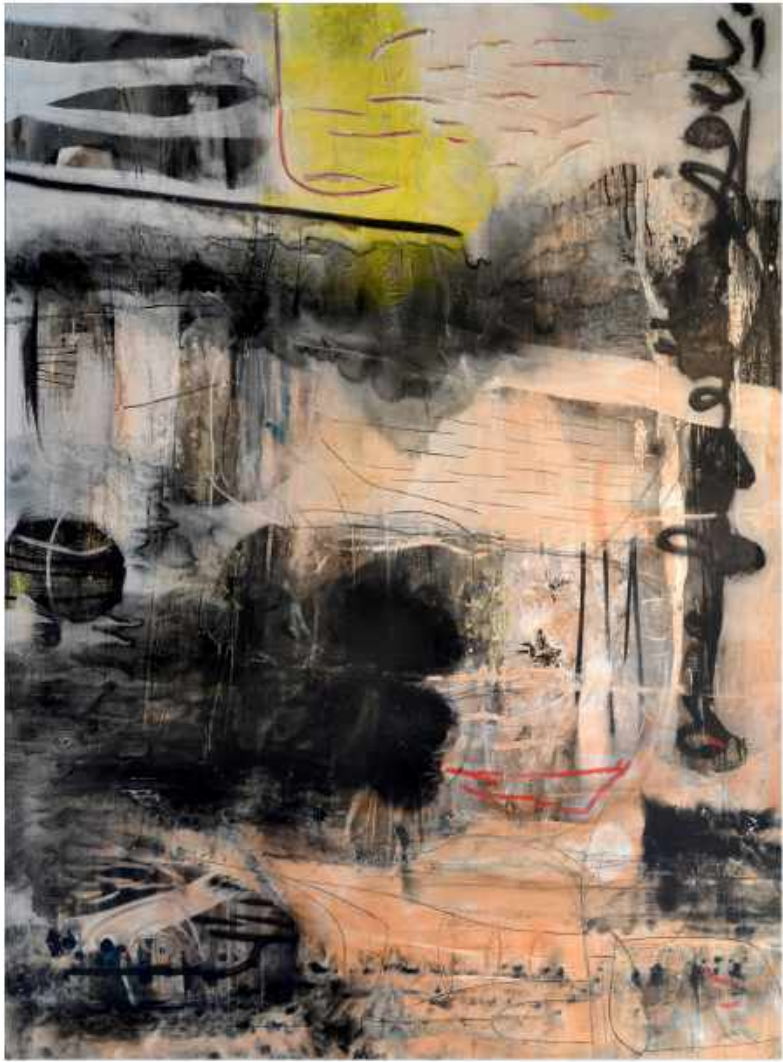
Michael Lotenero "Me Forgetting You" Acrylic & Charcoal on Canvas 96 x 72 inches