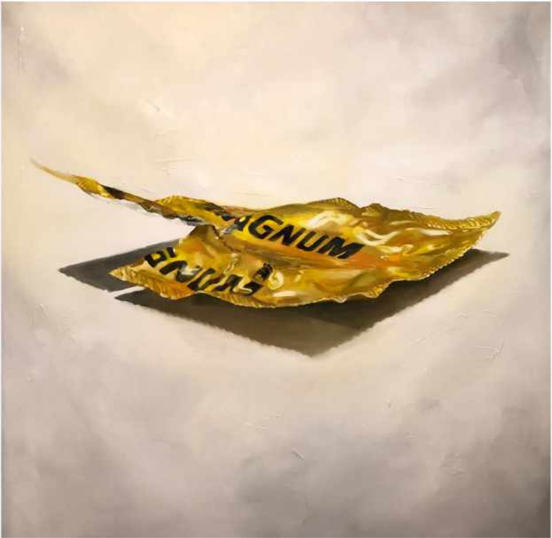
PJ Svejda "Magnum" Oil on Canvas 48 x 48 inches