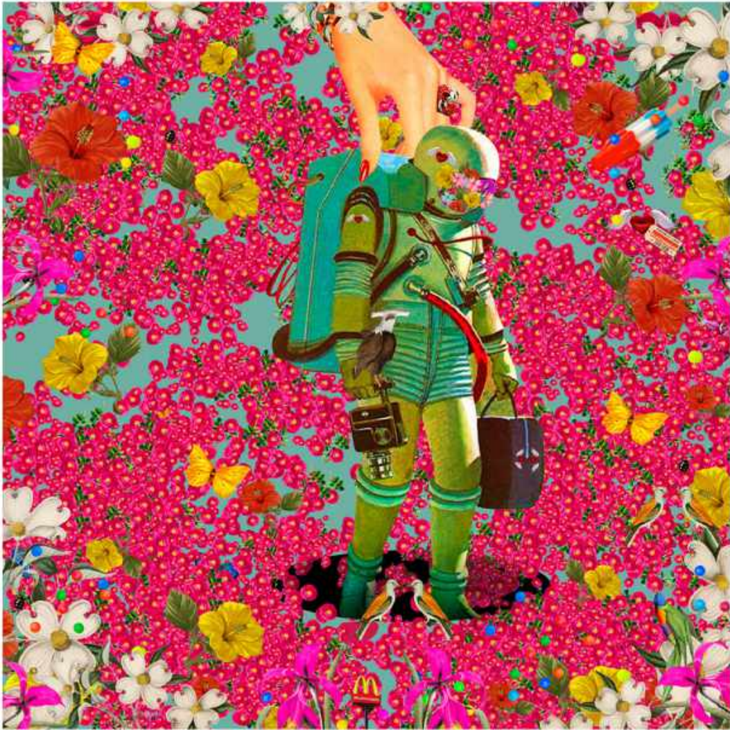
David Krovblit "Lost in Krovblitland" Collage on Wood Under Resin