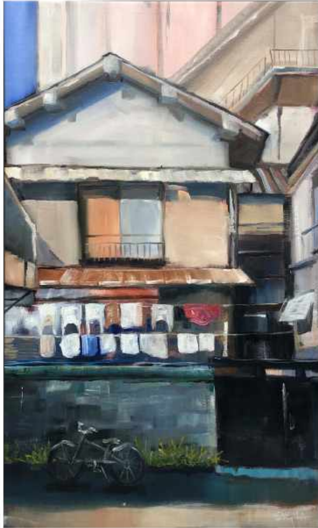
PJ Svejda "Clothesline" Acrylic on Canvas 29 x 47 inches