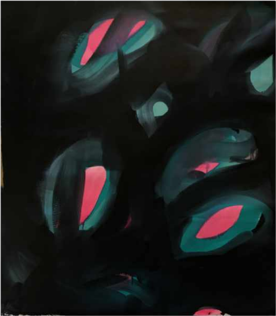
AXIOM Studio "Hidden" Acrylic on Canvas 30 x 34 inches