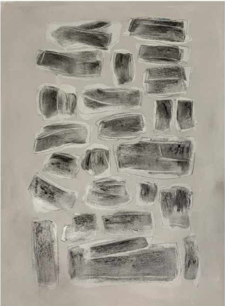
AXIOM Studio "Moon Stones" 2020 Acrylic & Graphite on Canvas 36 x 48 inches