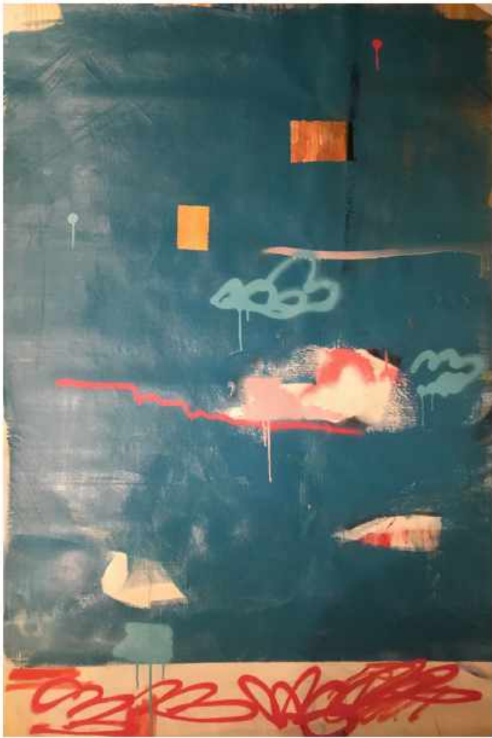
AXIOM Studio "Peek A Boo" Acrylic & Spray Paint on Canvas 38 x 57 inches