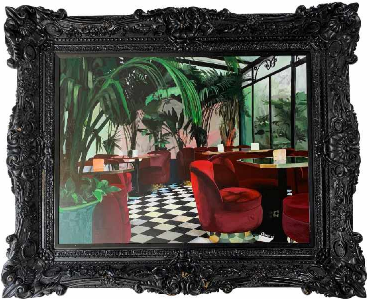
CHIO "Le Tres Partiulier" Acrylic on Canvas 60 x 48 inches