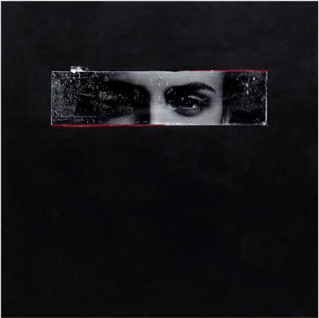
Guerrier "Ultra IV" 2016 Acrylic, Photo Transfer & Spray Paint on Canvas 38 x 38 inches