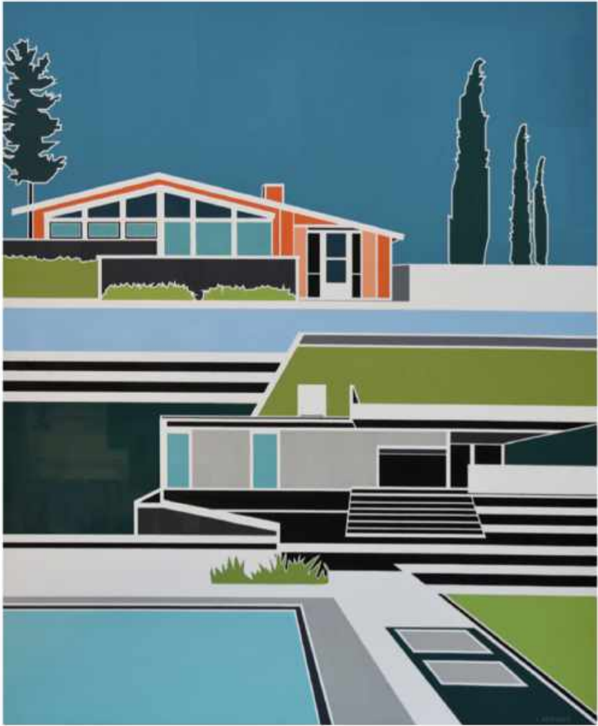
Lisa Ashinoff "Cypress" Oil on Birch 33 x 40 inches