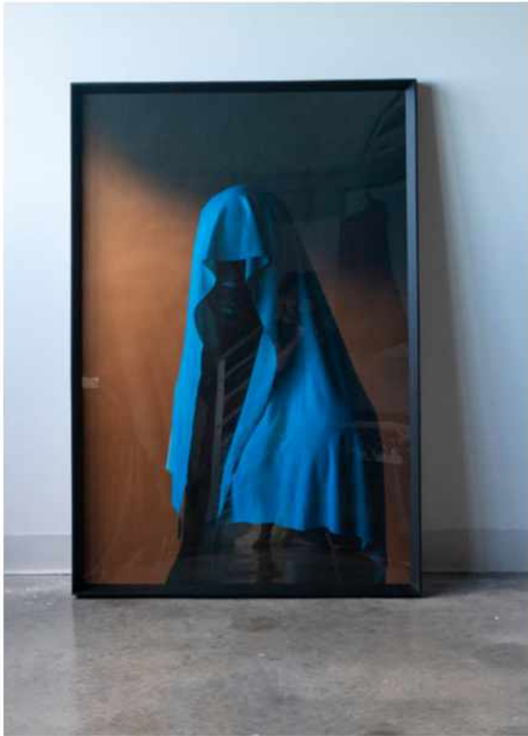
Juan Sebastian "Diamante Azul" 2019 Photograph on Paper 31 x 47 inches