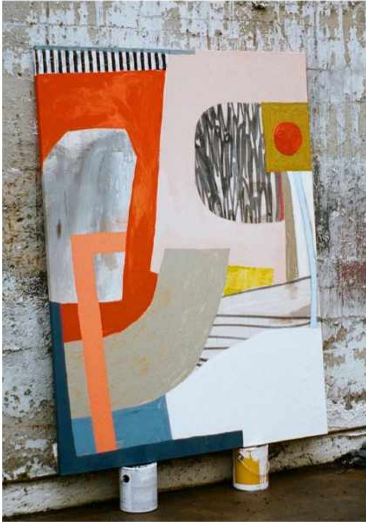
Ellen Rutt "The Invitation" Mixed Media on Canvas 60 x 72 inches