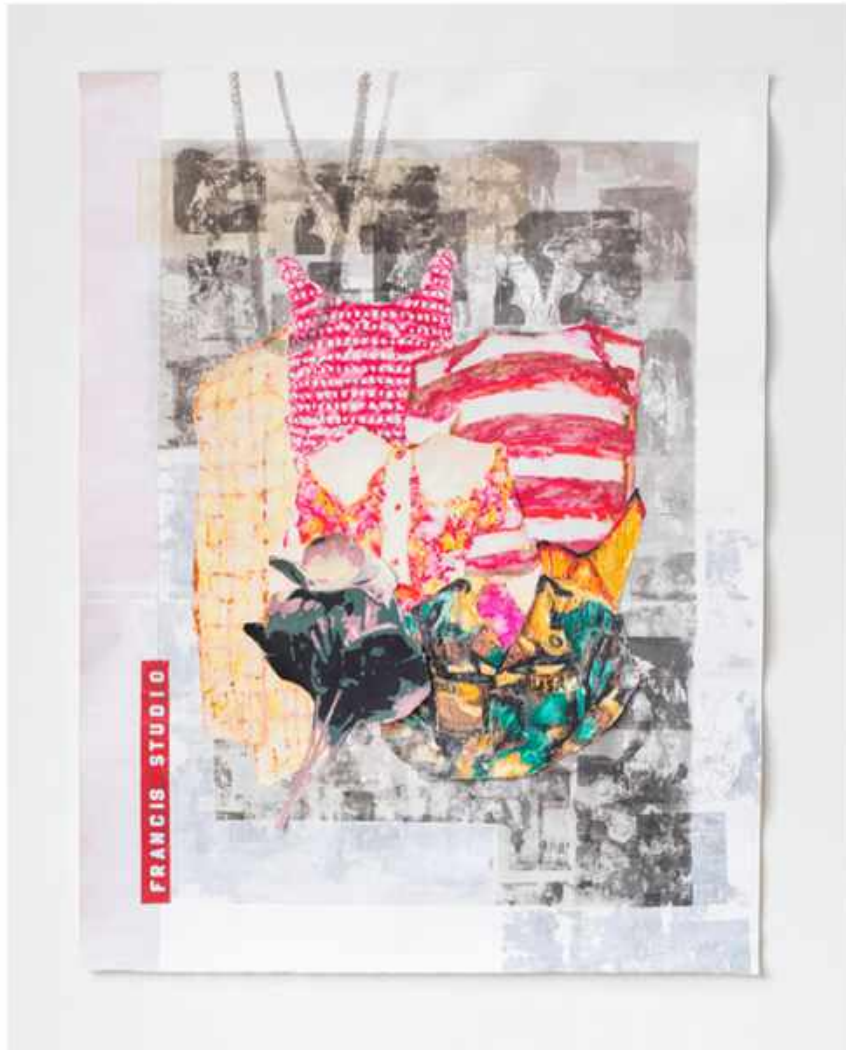
Tyanna J Buie "A Series of Arrangements #1" Screenprint Hand Cut Paper Monotype 50 x 65 inches