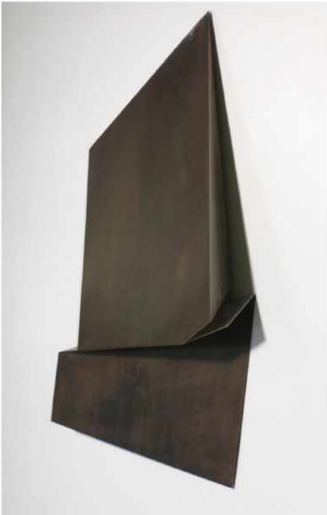
Kate Silvio "Slough" Steel 26 x 24 x 5.5 inches