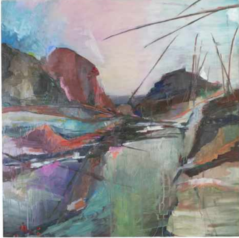
Ani Garabedian "Landscape" Oil on Wood 36 x 36 inches