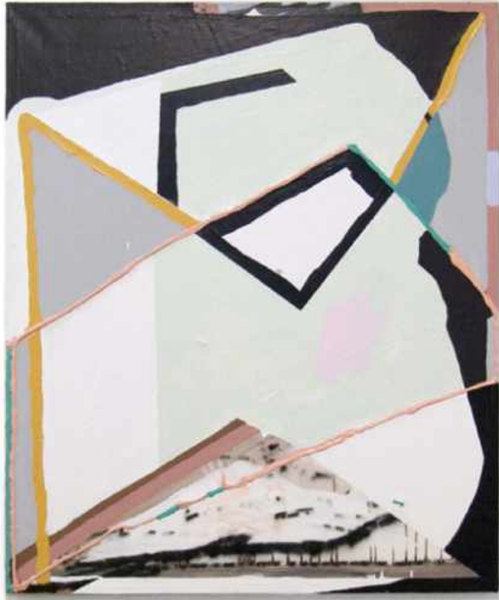
Ian Swanson "Co-Op" Acrylic on Canvas 40 x 52 inches