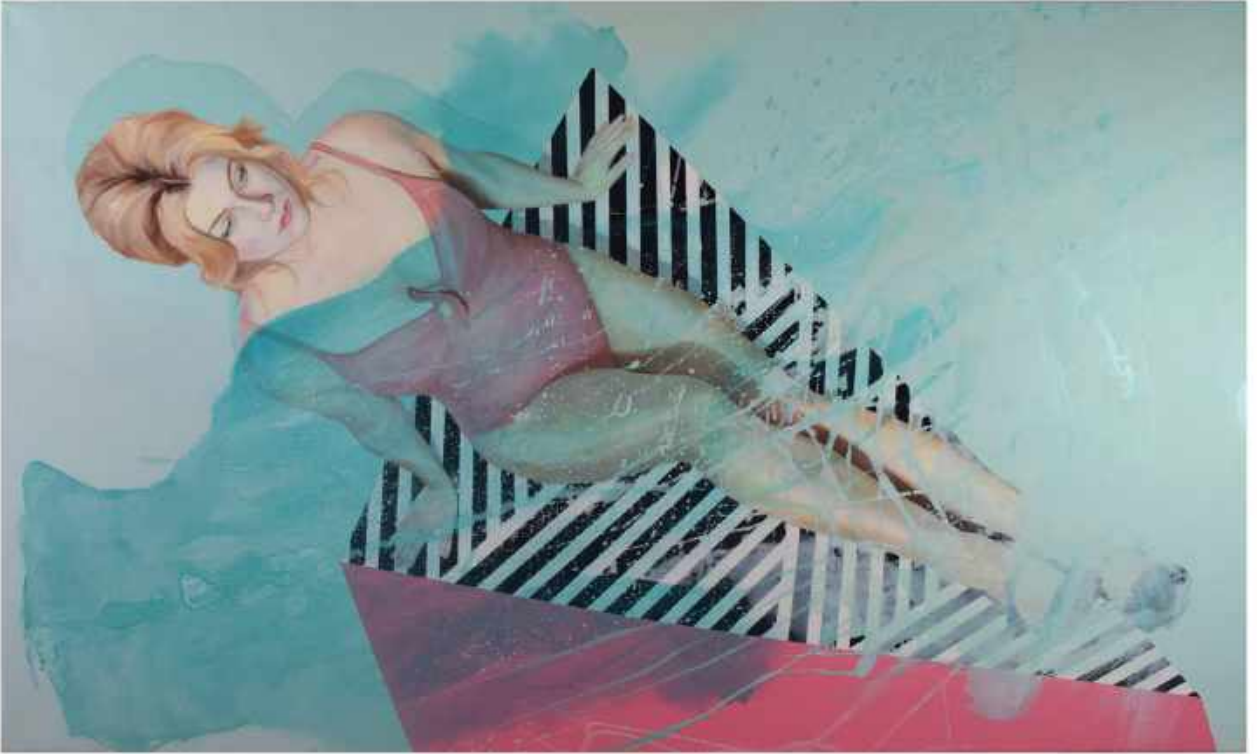
Michelle Tanguay "Splash" Oil on Canvas 72 x 44 inches