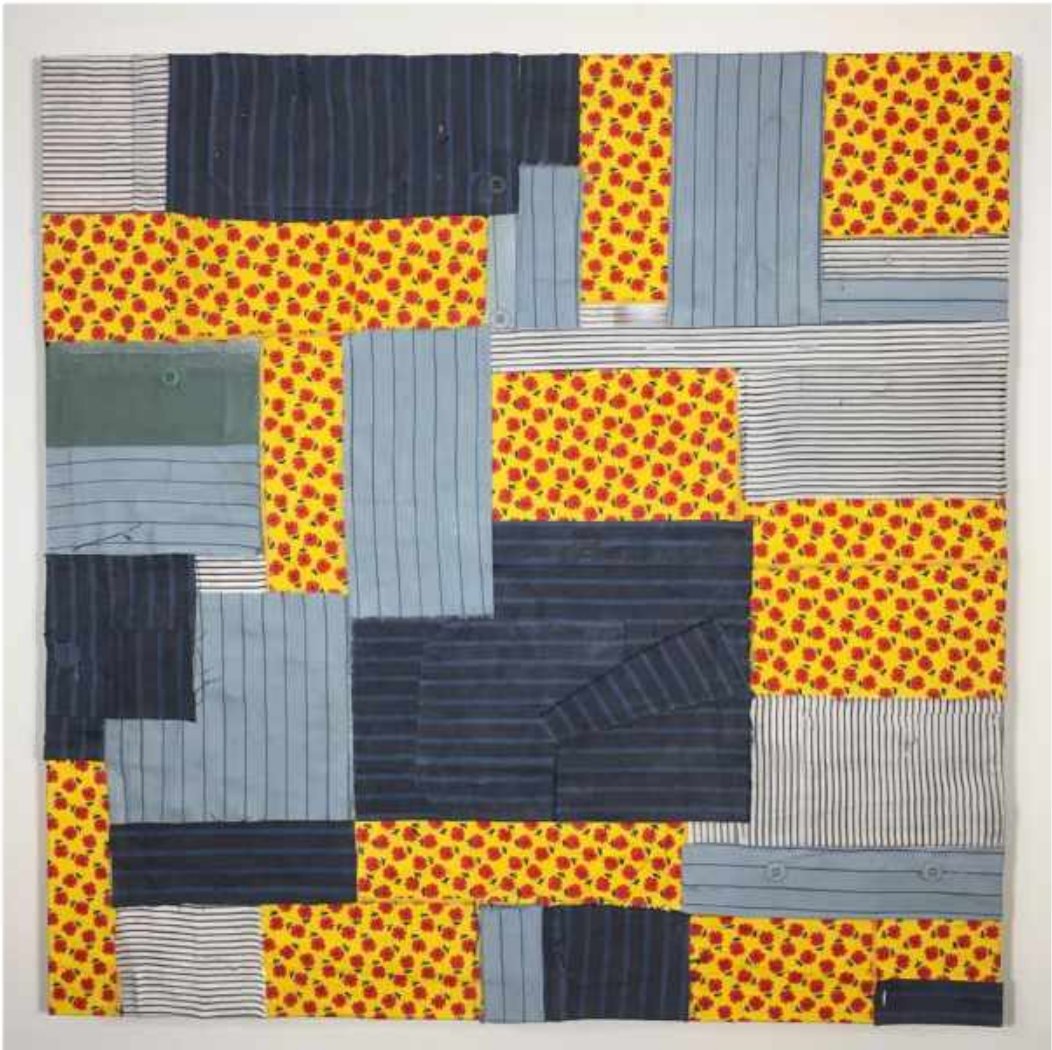
Nick Jaskey "Work Shirts" Mixed Media on Wood 24 x 24 inches