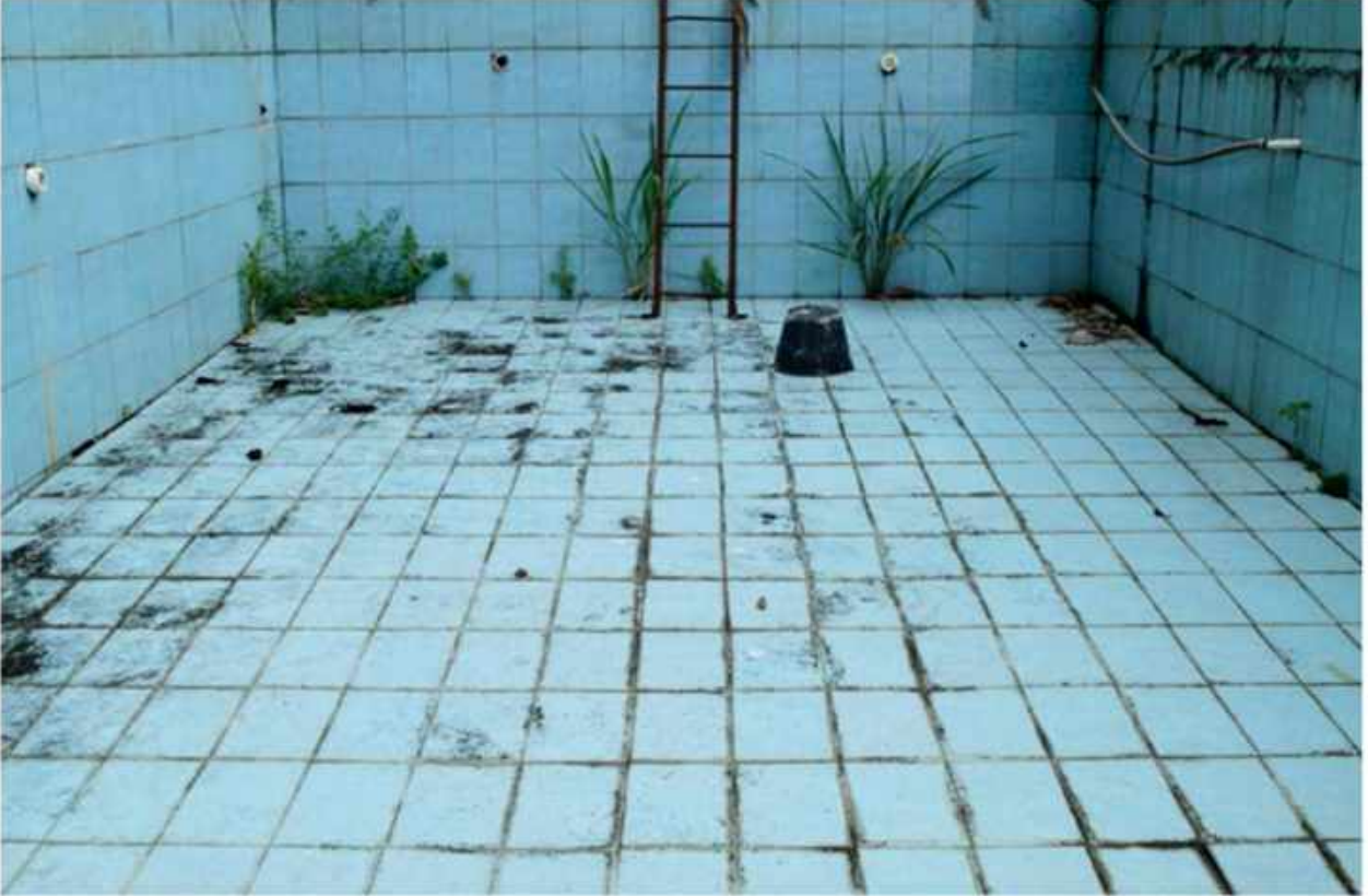
Maritza Caneca "Bottoms Up" Photograph