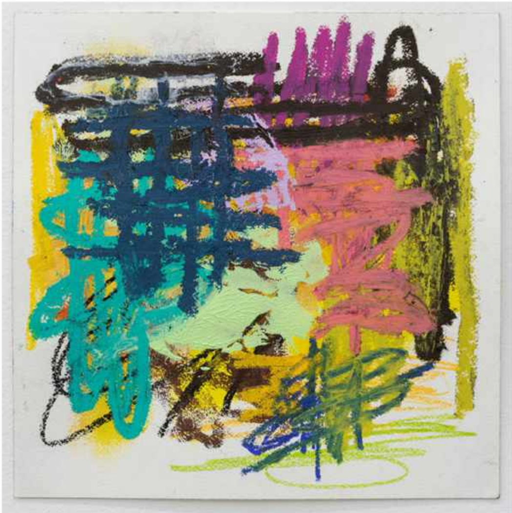
Patrick Alston "Trials & Tribulations Week 01, Day 02, 2020" Acrylic, Oil, Oil Stick & Pastel on Paper 12 x 12 inches