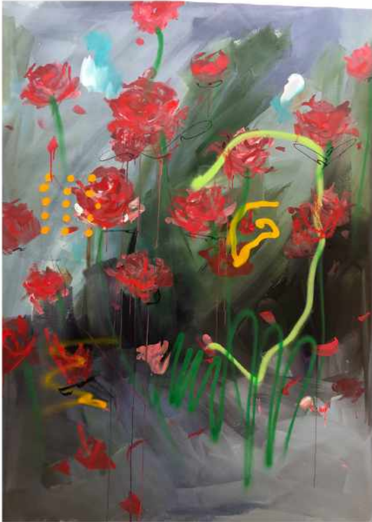
AXIOM Studio "Snakes in the Garden I" Acrylic & Oil on Canvas 47 x 64 inches