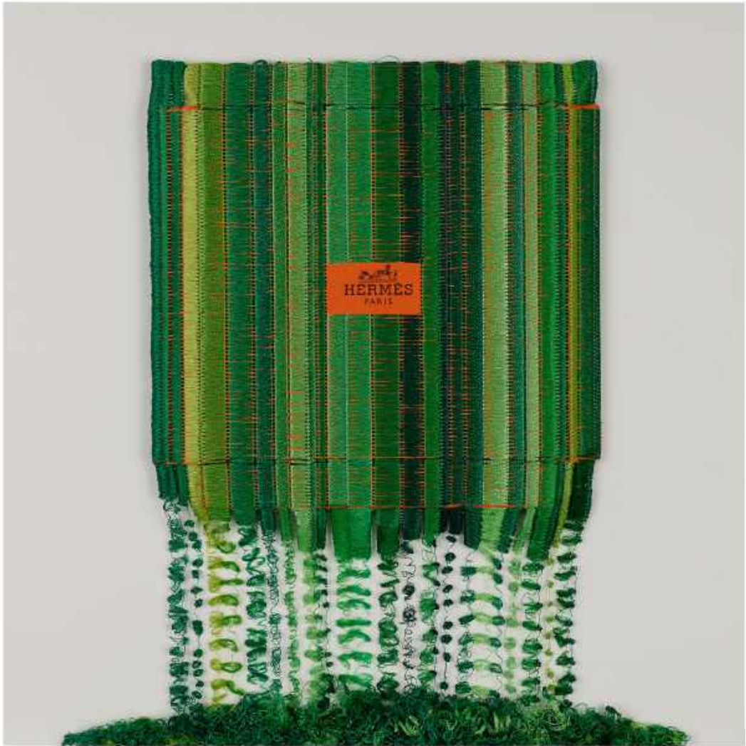
Stephen Wilson "Green Hermes Drip III" 2018 Embroidered Luxury Box With Hand Distressed Thread Drips 12 x 12 x 2 inches