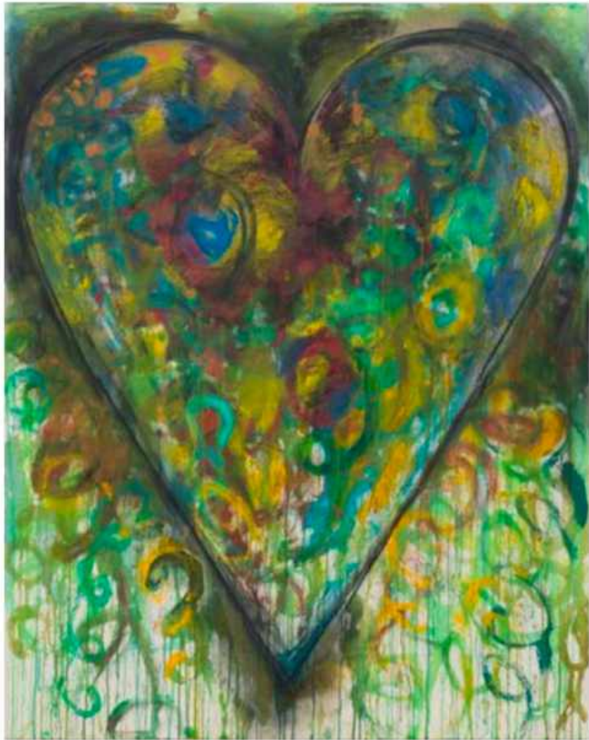
Jim Dine "Hello 30" 2008 Acrylic & Charcoal on Canvas 48 x 60 inches / 122 x 152 CM

Provenance: Directly from artist's studio