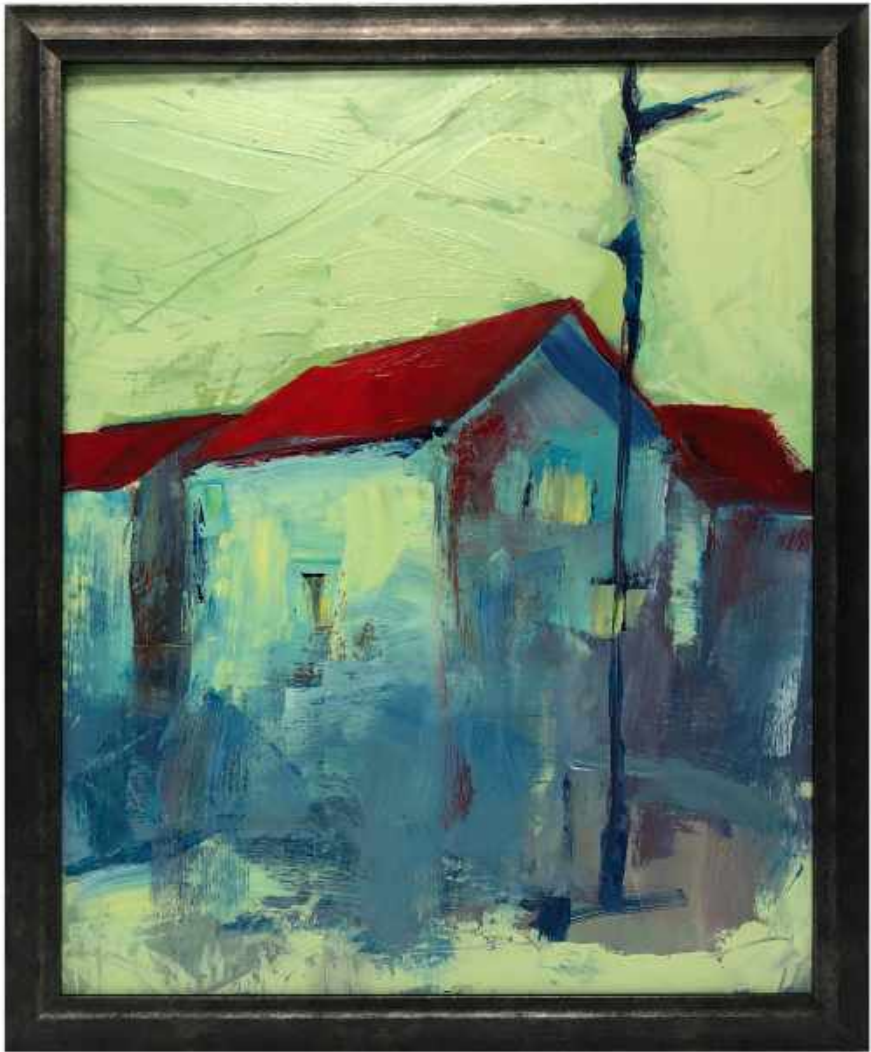
PJ Svejda "Mint Line" Acrylic on Hardboard 19 x 23 inches