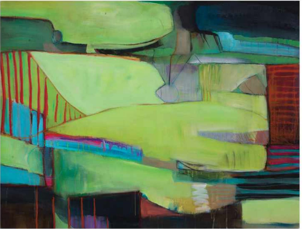
AXIOM Studio "Empire Park" 2016 Acrylic on Canvas 62 x 46 inches