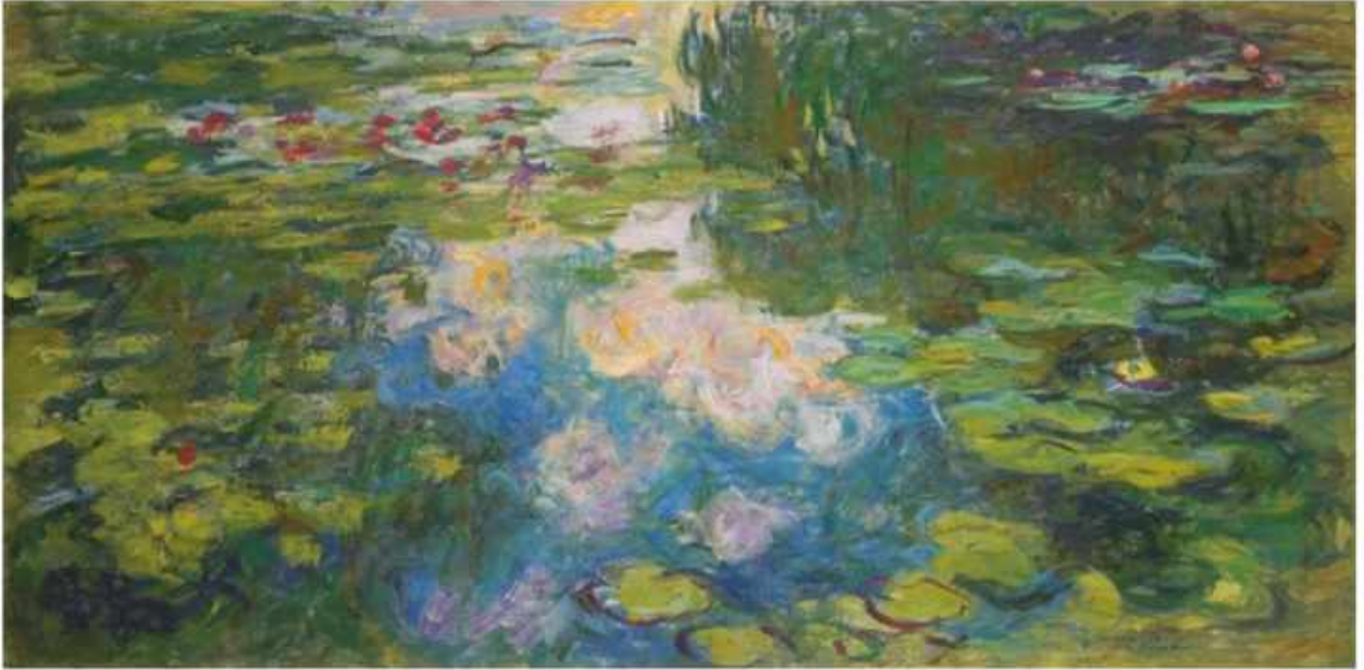
Claude Monet "Le Bassin Aux Nymphéas" 1917-19 Oil on Canvas 79 x 39.375 inches / 200 x 100 CM