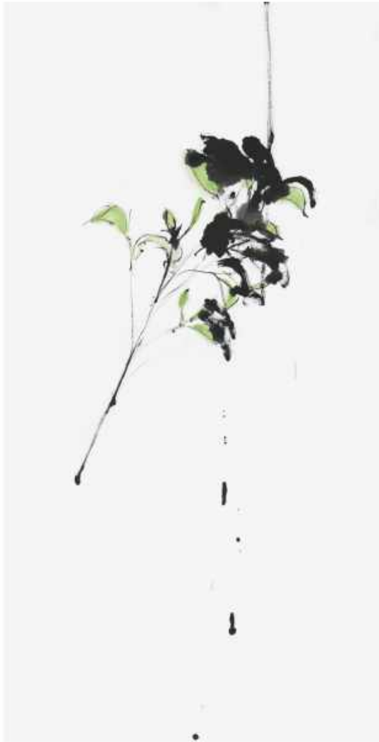
Ko Ushijima "120113-2" 2012 Sumi ink, Watercolor on Handmade Paper 28 x 54 inches