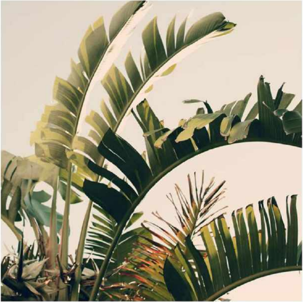
Alicia Bock "Tropic Sky" Photograph 28 x 28 inches