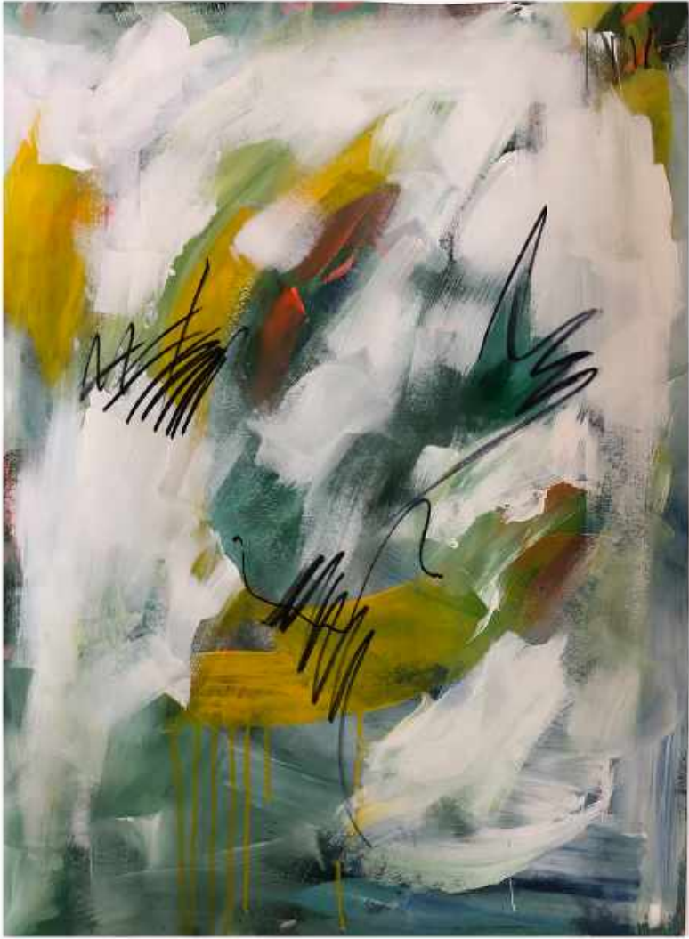
AXIOM Studio "Sophomore" Acrylic on Paper 26 x 36 inches