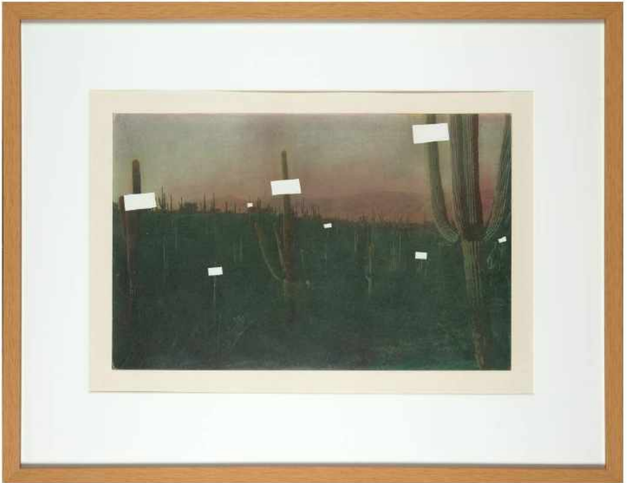
Cinda Sparling "Message to Eagles" 1983 Lithograph with colored pencil and pastel 20.5 x 14.5 inches