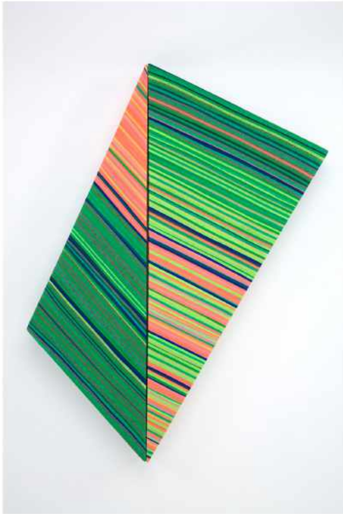
Jen Pack "Untitled" 40 x 30 x 3.5 inches