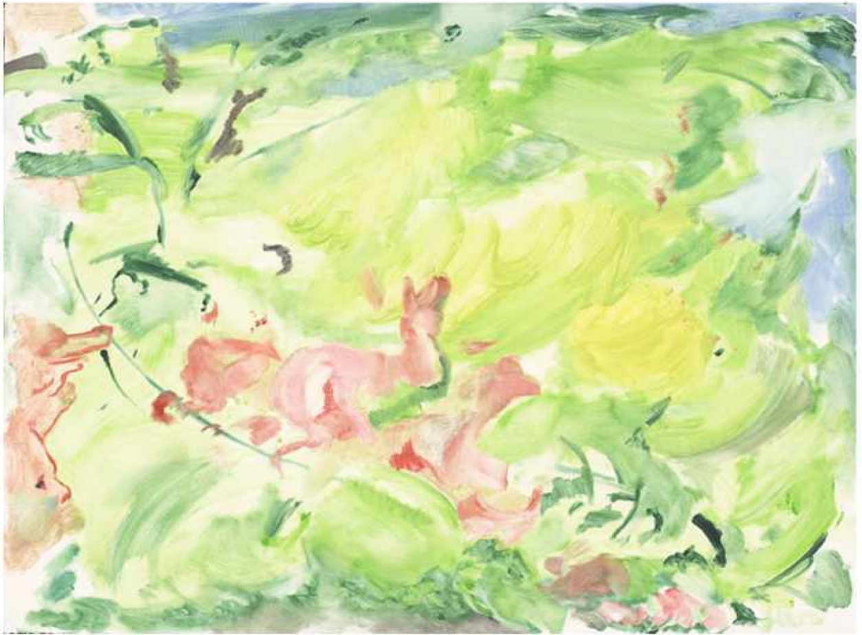
Cecily Brown "Untitled" 2018 Signed verso Monotype in oil on Lanaquarelle Paper 23 x 31 inches / 58.4 x 78.7 CM