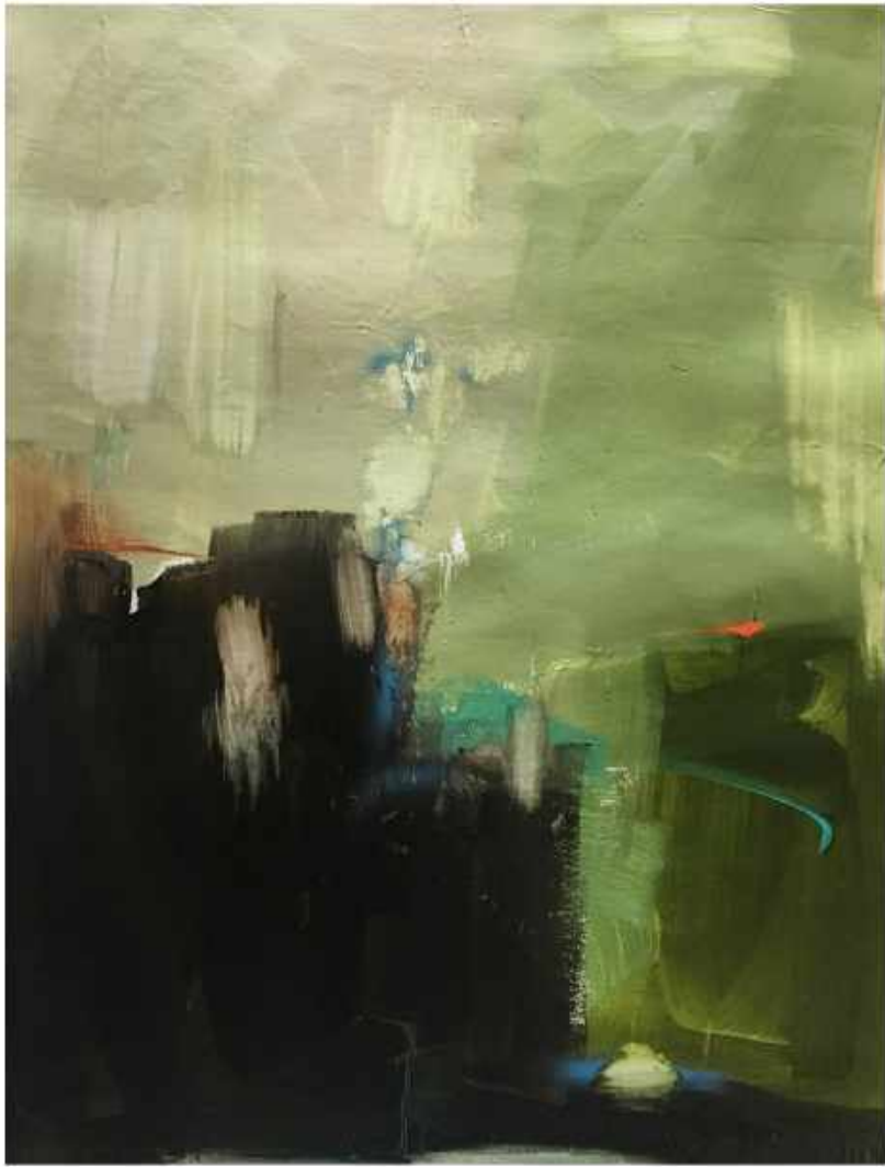
AXIOM Studio "Olive Smoke" Acrylic on Canvas 35 x 46 inches