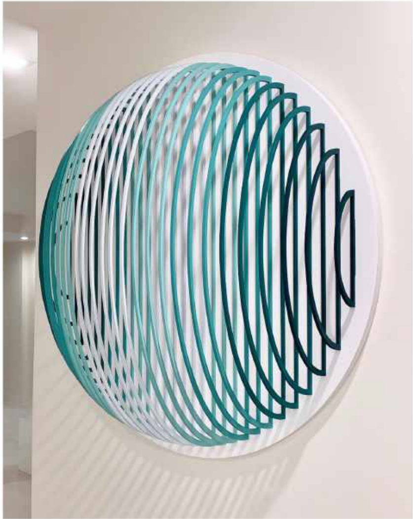
Adriana Dorta "Sphere Green" Birchwood & Acrylic 32 x 32 x 9 inches