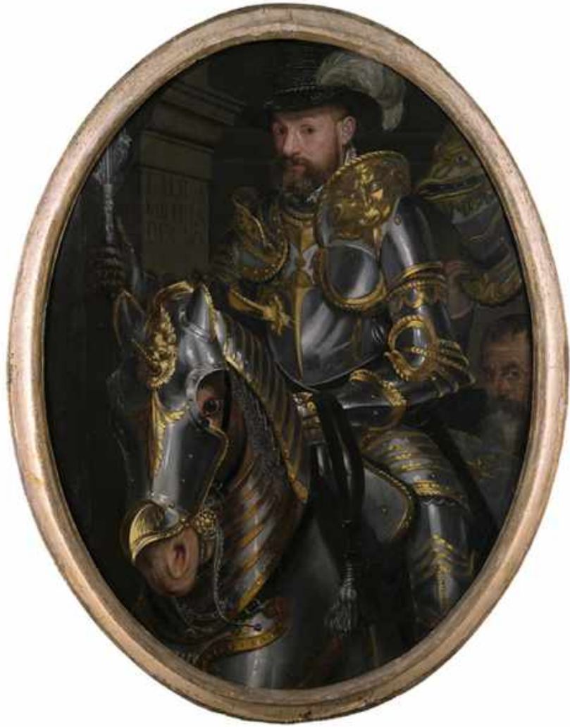
Pasquale Ottino "Equestrian Portrait of Nobleman in Armour" Oil on Canvas 57 x 46.9 inches