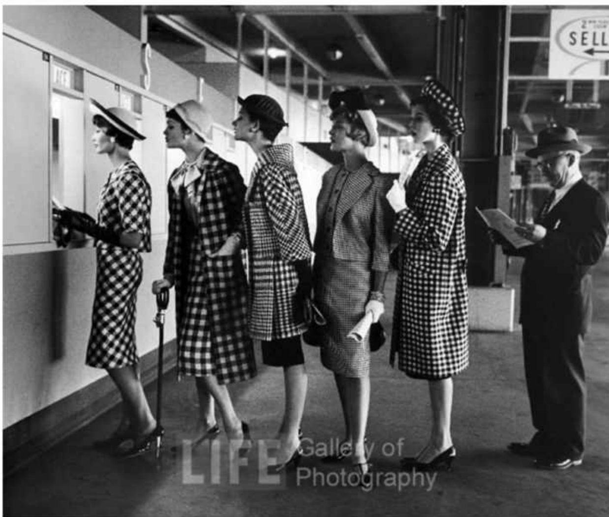
Nina Leen "Race Track Fashions at Roosevelt Raceway Window, New York" Vintage Silver Gelatin Print 10.5 x 12.375 inches