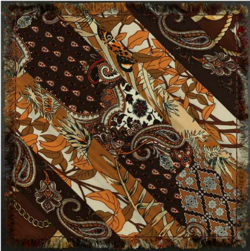
Stephen Wilson "Luxury Quilt Study IV" 2019 Quilted Luxury Silk Scarves Mounted on Fabric and Paper 12 x 12 x 2 inches