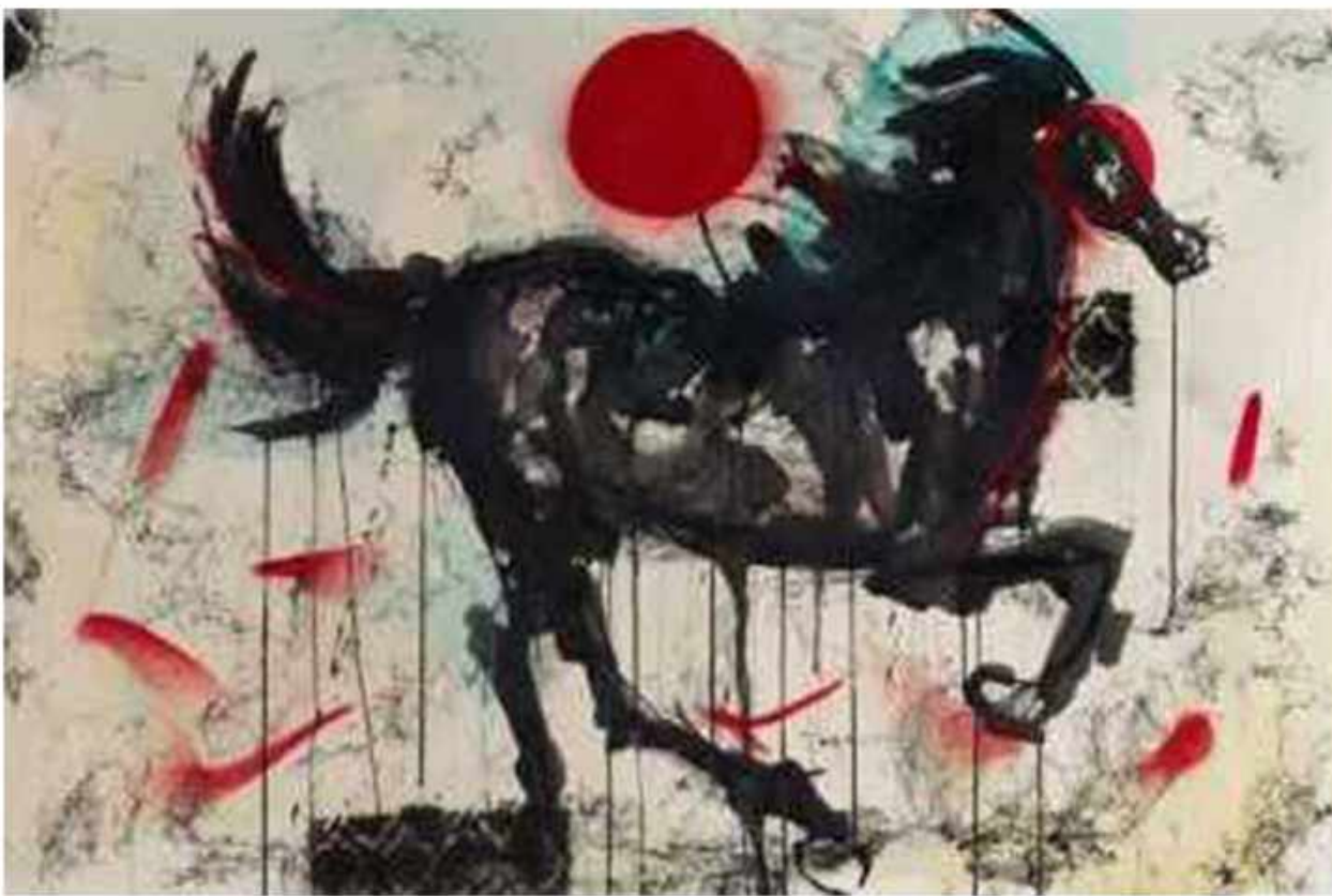
Peterson Guerrier "Faunta Trot" Acrylic & Enamel on Paper 56 x 36 inches