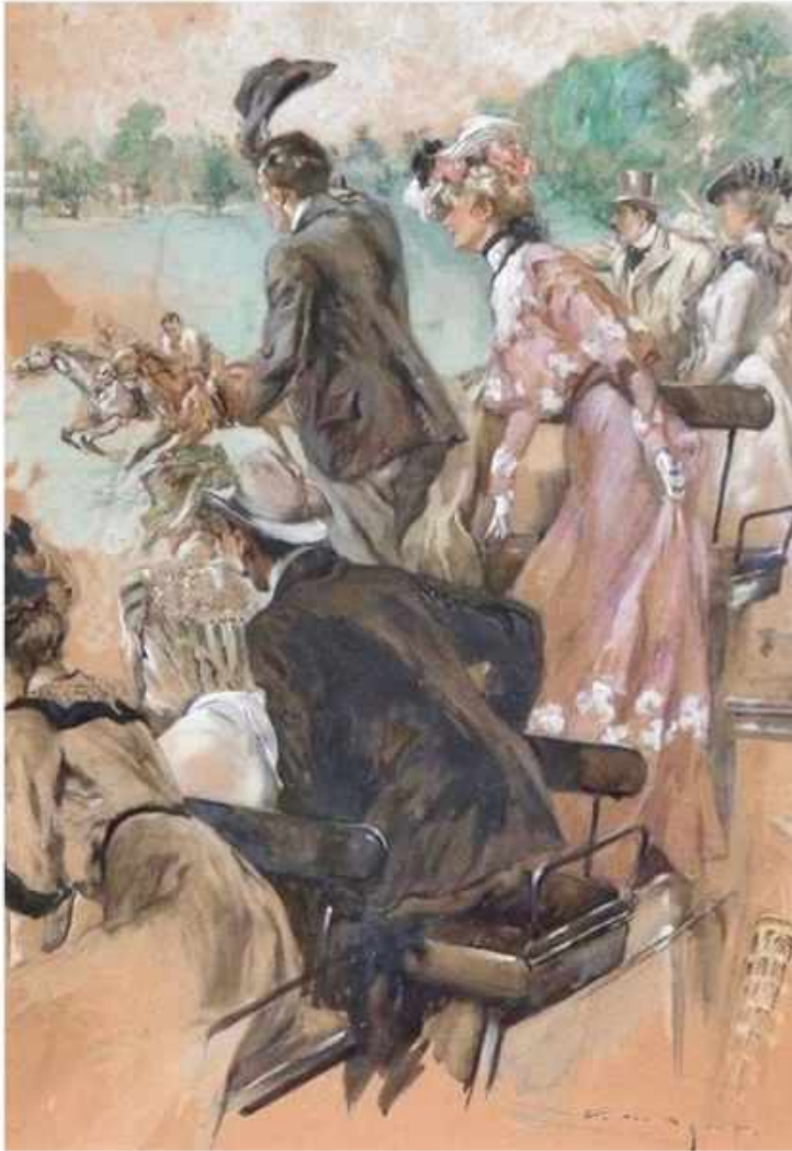
Edmund Marion Ashe "Horse Race" Watercolor, Pen, Ink & Charcoal on Board 19.75 x 13.75 inches