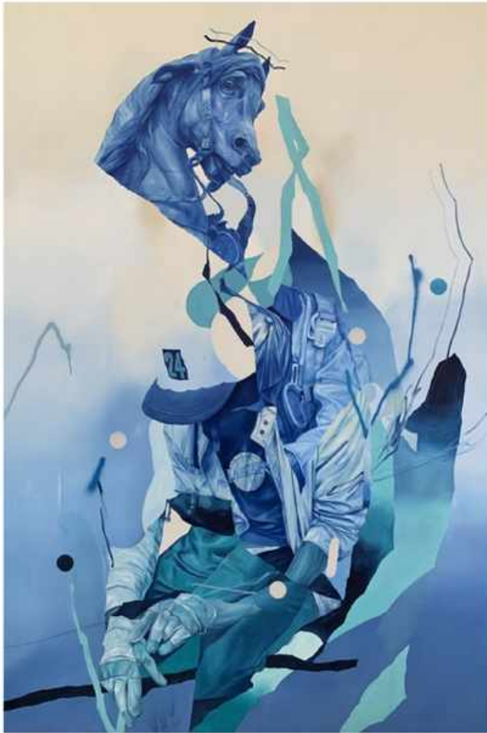
Joram Roukes "Equestrian Confetti" Oil on Linen 71 x 47 inches