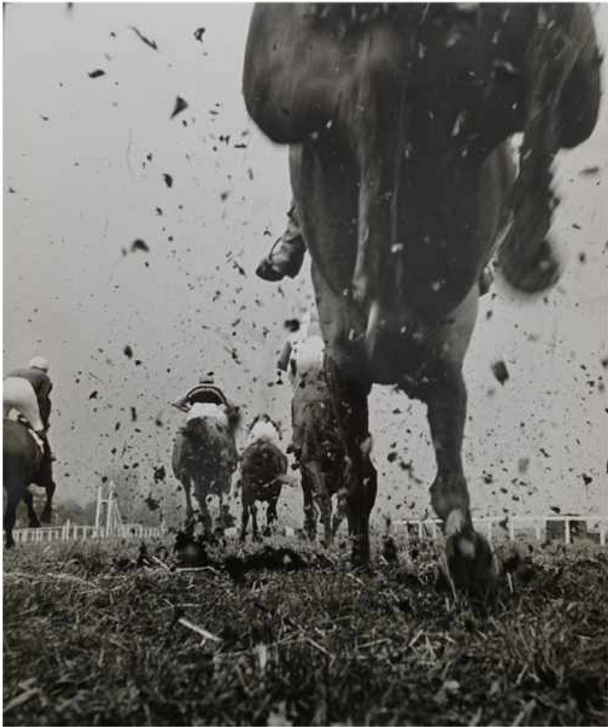
Gerry Cranham "Untitled" Vintage Silver Gelatin 14.3 x 13.2 inches