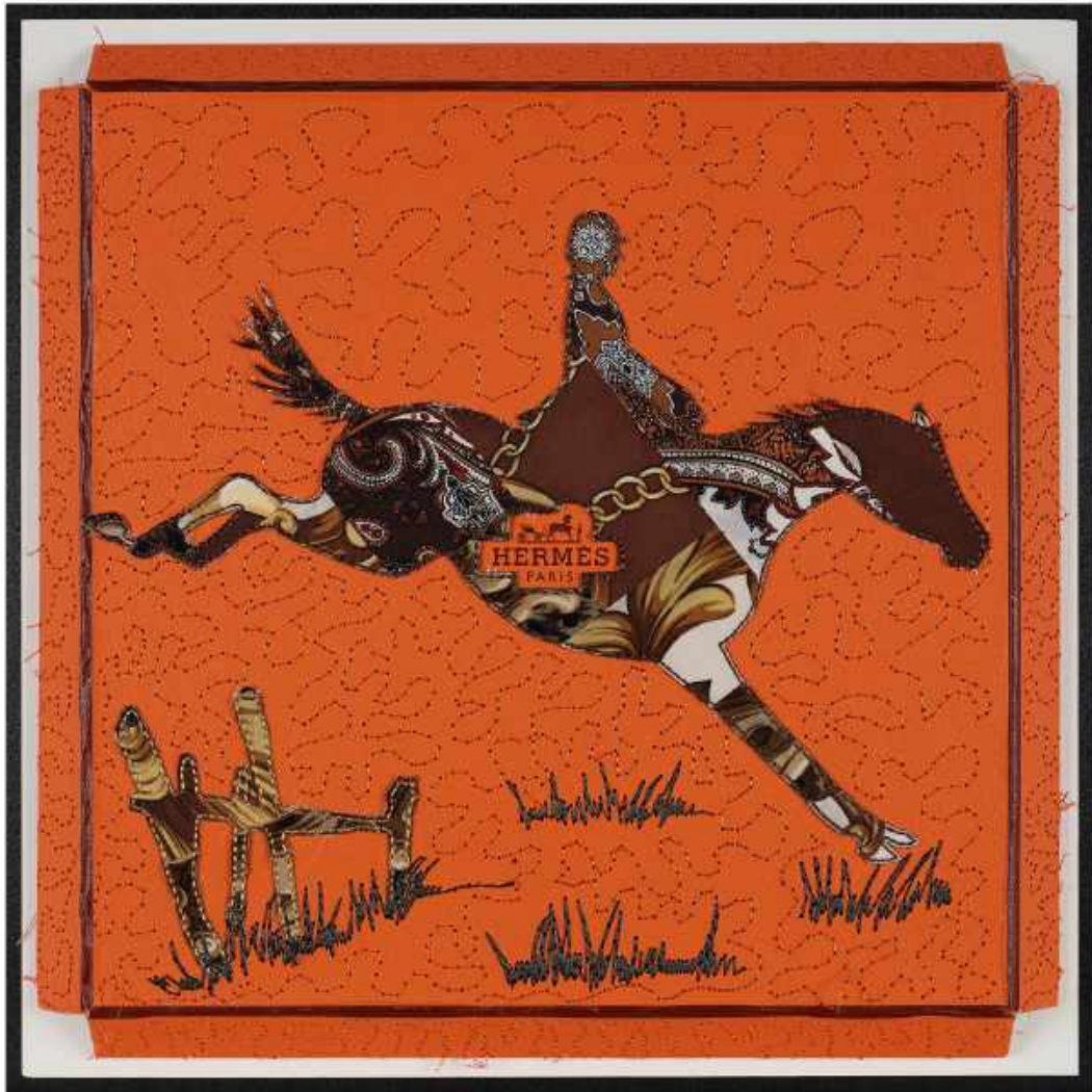
Stephen Wilson "Hermes Jumper" 2019 Embroidered Luxury Box With Stitched Fashion Fabrics 12 x 12 x 2 inches