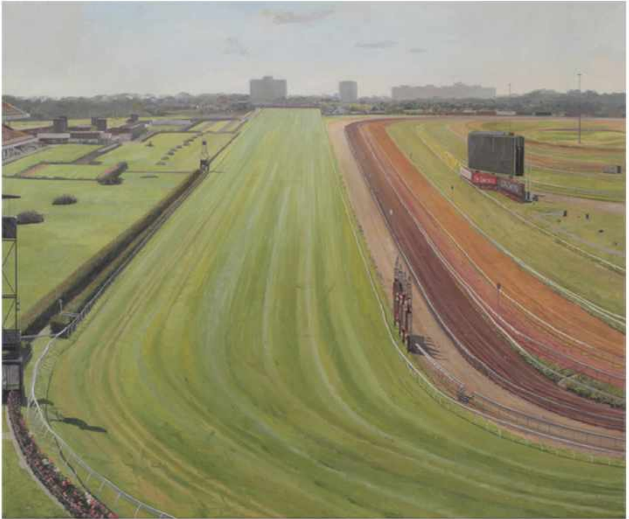
Shane Jones "The Famous Straight Six" Oil on Linen 29.9 x 36 inches