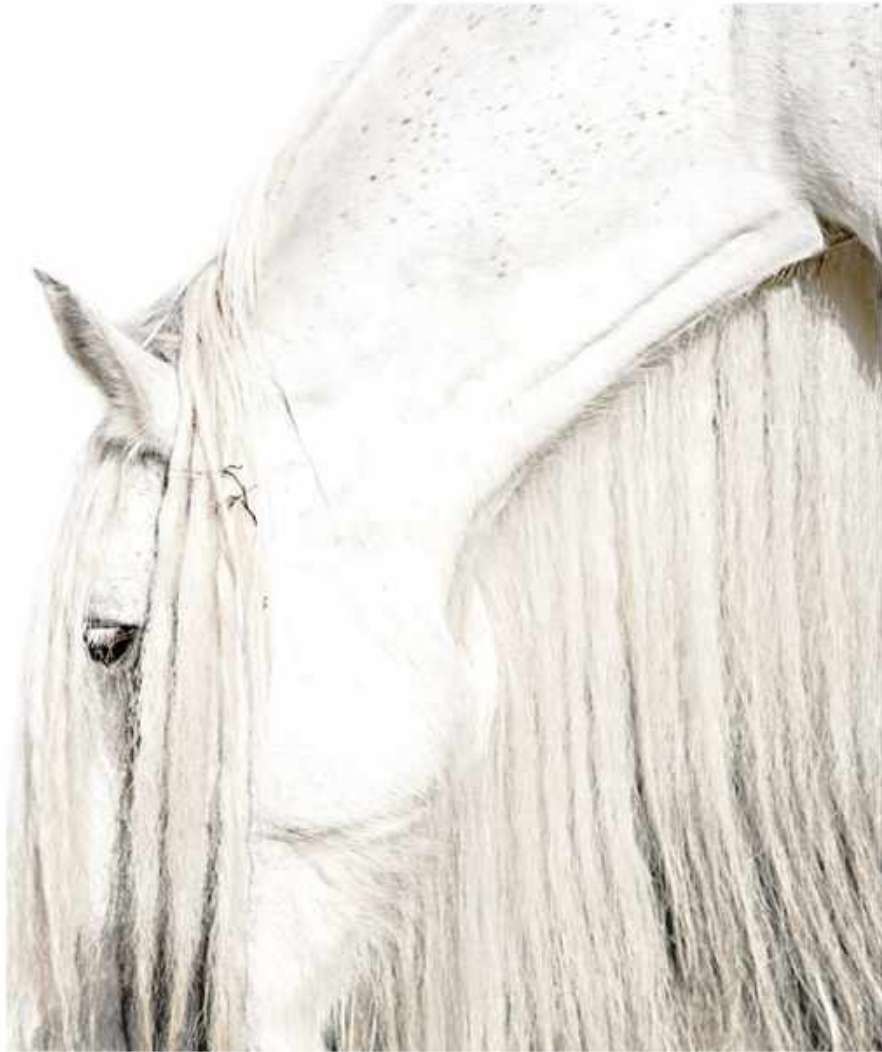
Bob Tabor "Horse 94" C Print Mounted on Plexi 57.5 x 48 inches