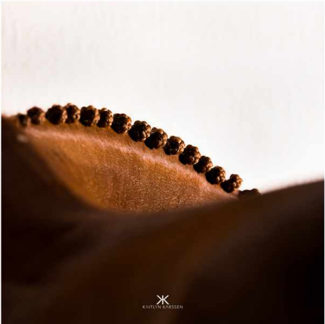
Kaitlyn Karssen "In Focus" Photographic Print 60 x 60 inches