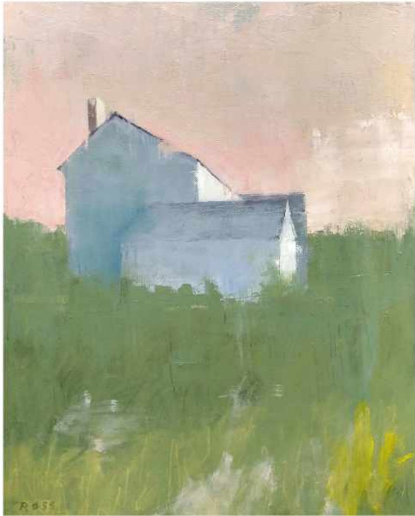
Robert Ross "Houses Under a Pink Sky" Oil on Canvas 16 x 20 inches