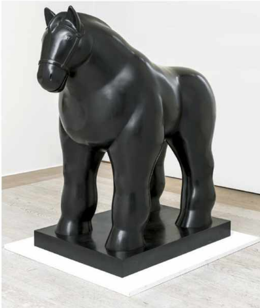
Fernando Botero "Cavallo" Bronze 48.8 x 23.6 x 45.7 inches