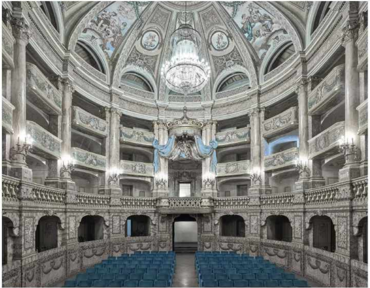
David Burdeny "Reggia di Caserta Theatre, Caserta Italy" Limited Edition Pigment Print 26 x 21, 40 x 32, 55 x 44 or 73.5 x 59 inches