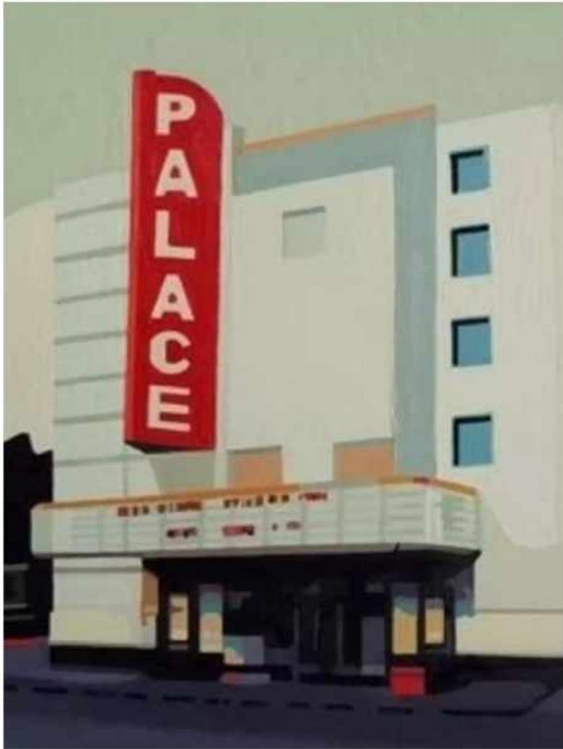
Andy Burgess "Palace Theatre" Oil on Panel 11 x 14 inches