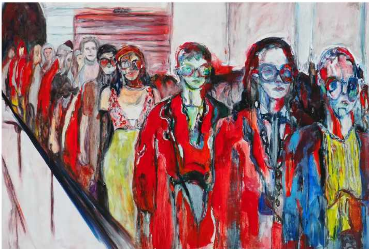
Sa Hara "Physical Theatre 1" Oil on Canvas 46.3 x 51.3 inches