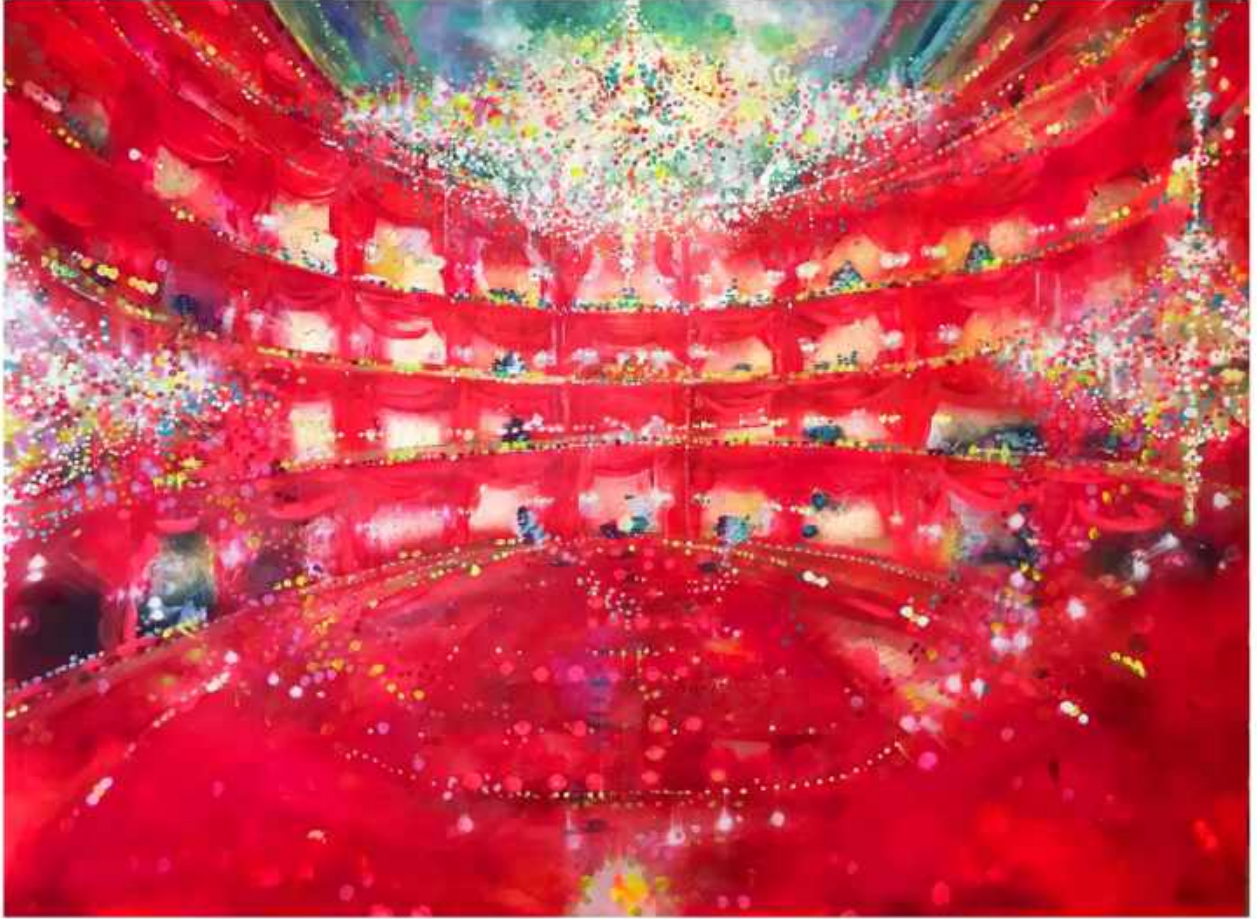
Fabio Bianco "Theatre" Acrylic & Gold Leaf on Canvas 78.7 x 59.1 inches