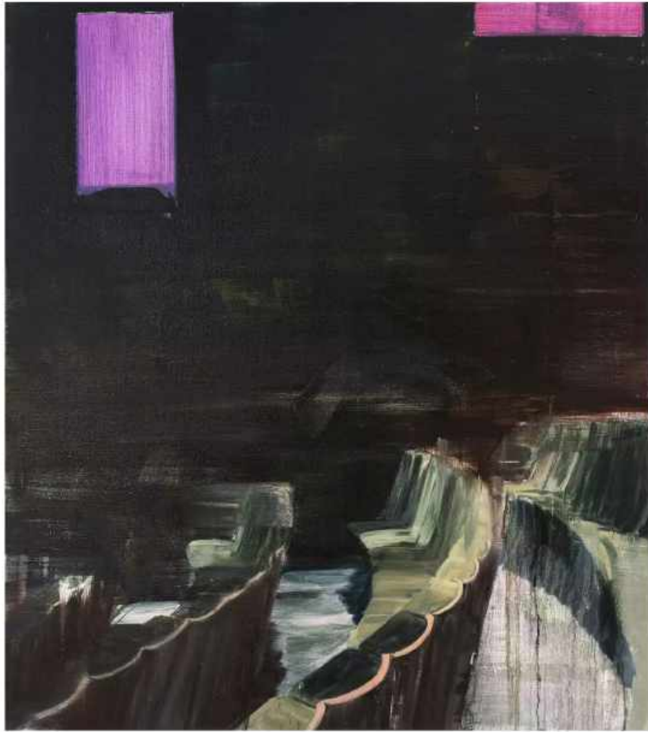
Lei Qi "Theatre Series No.18" Oil on Canvas 41.7 x 45.3 inches