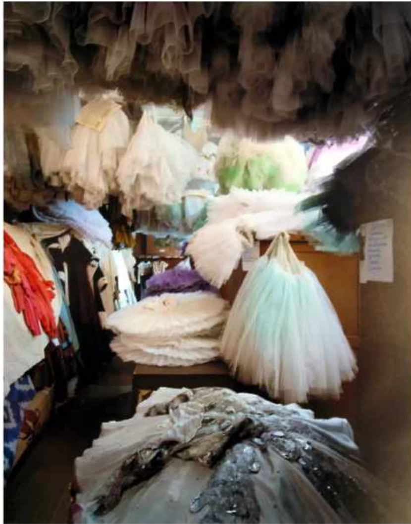
Andrew Moore "Titus, Mariinsky Theatre" Limited Edition Archival Pigment print 30 x 40, 40 x 50, 50 x 60 or 70 x 90 inches