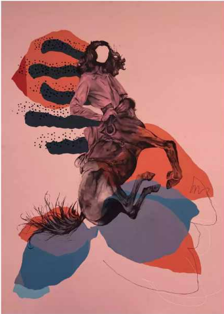
Moncho "Broadway in November" Oil & Acrylic on Canvas 42 x 58 inches