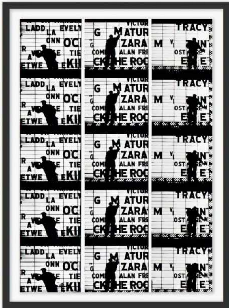
William Klein "Film Strips from Broadway by Light" Gelatin Silver Print Mounted on Aluminum 41.7 x 59.1 inches