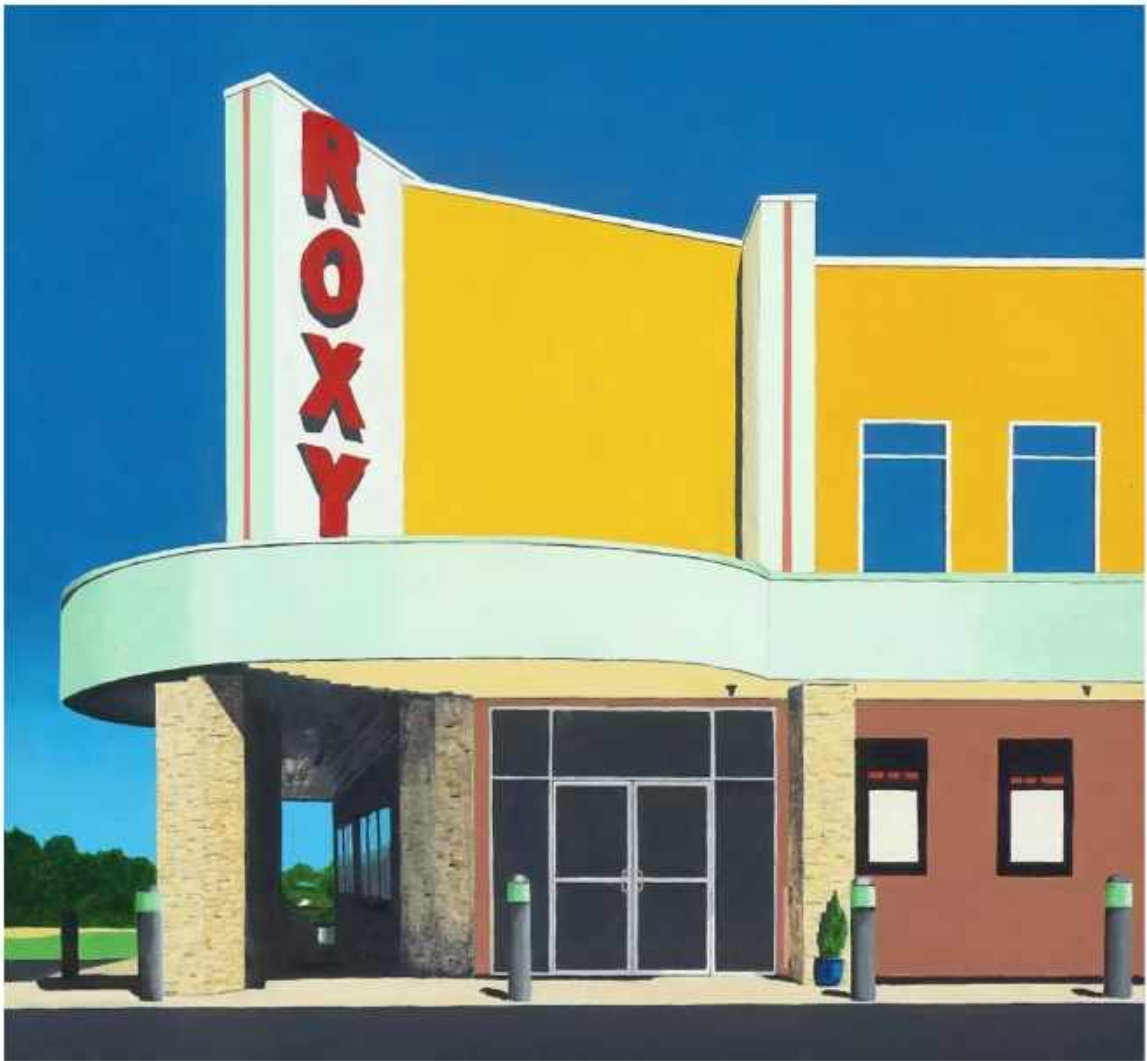
Horace Panter "Roxy Theatre" Acrylic on Panel 15 x 13.6 inches