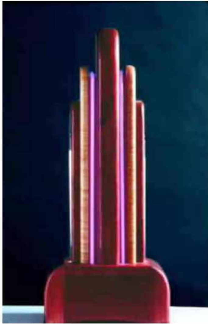
Margery Goldberg "Broadway Nights" Neon, Purple Heart, Maple & Zebrawood 12 x 8 x 22 inches