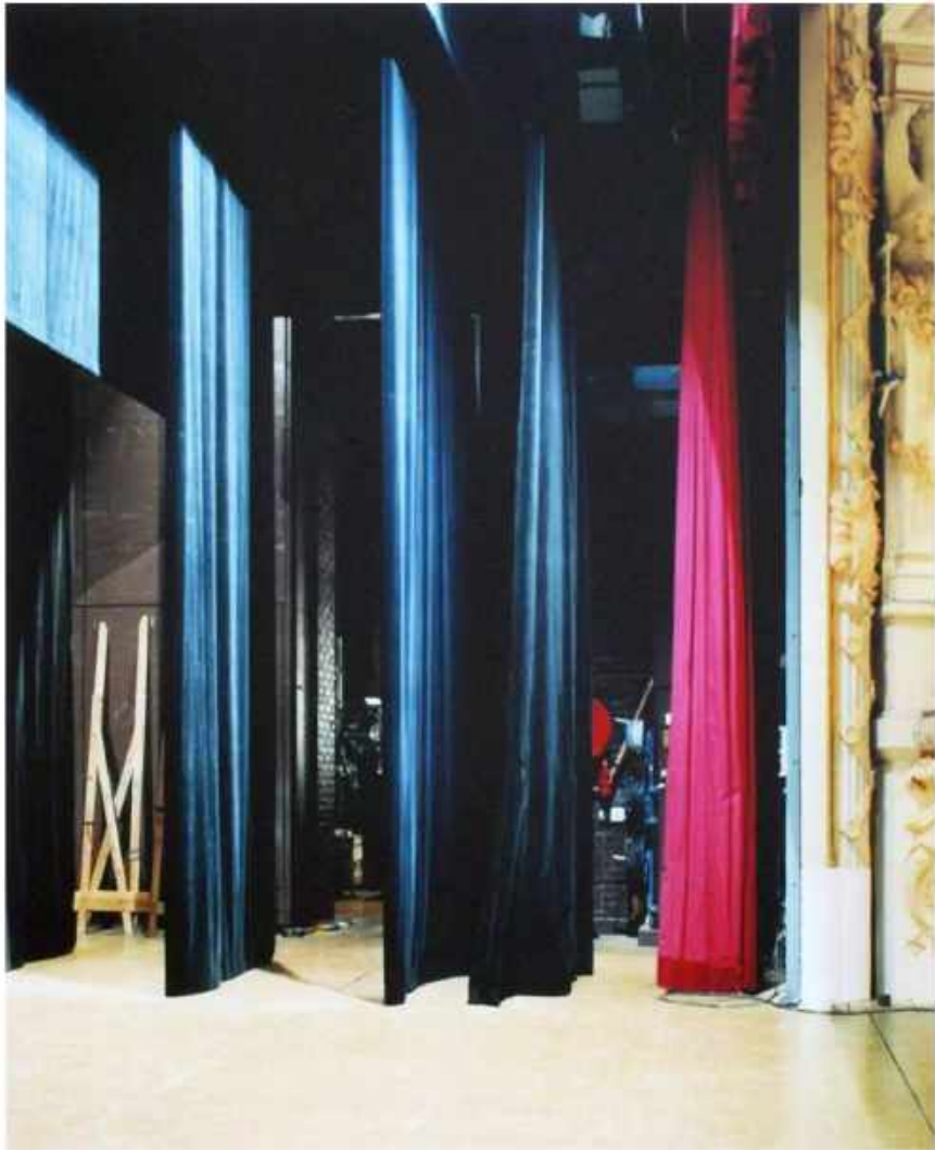
Candida Hofer "Theatre Municipal Calais II" Limited Edition Chromogenic Print on Aluminum 39.9 x 36 inches