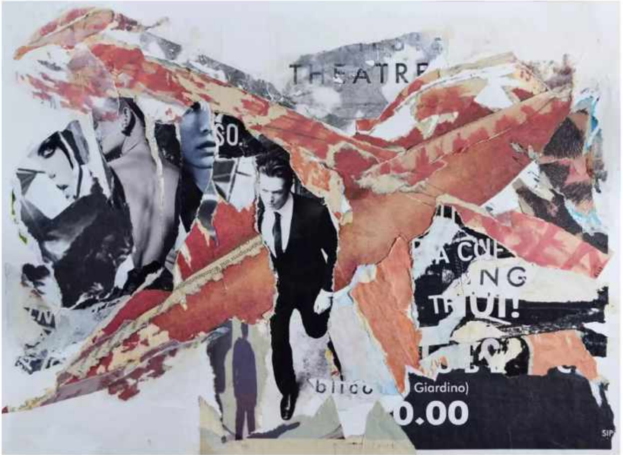
Dagmar Beyer "Theatre Giardino" Collage on Paper 15.6 x 11.8 inches