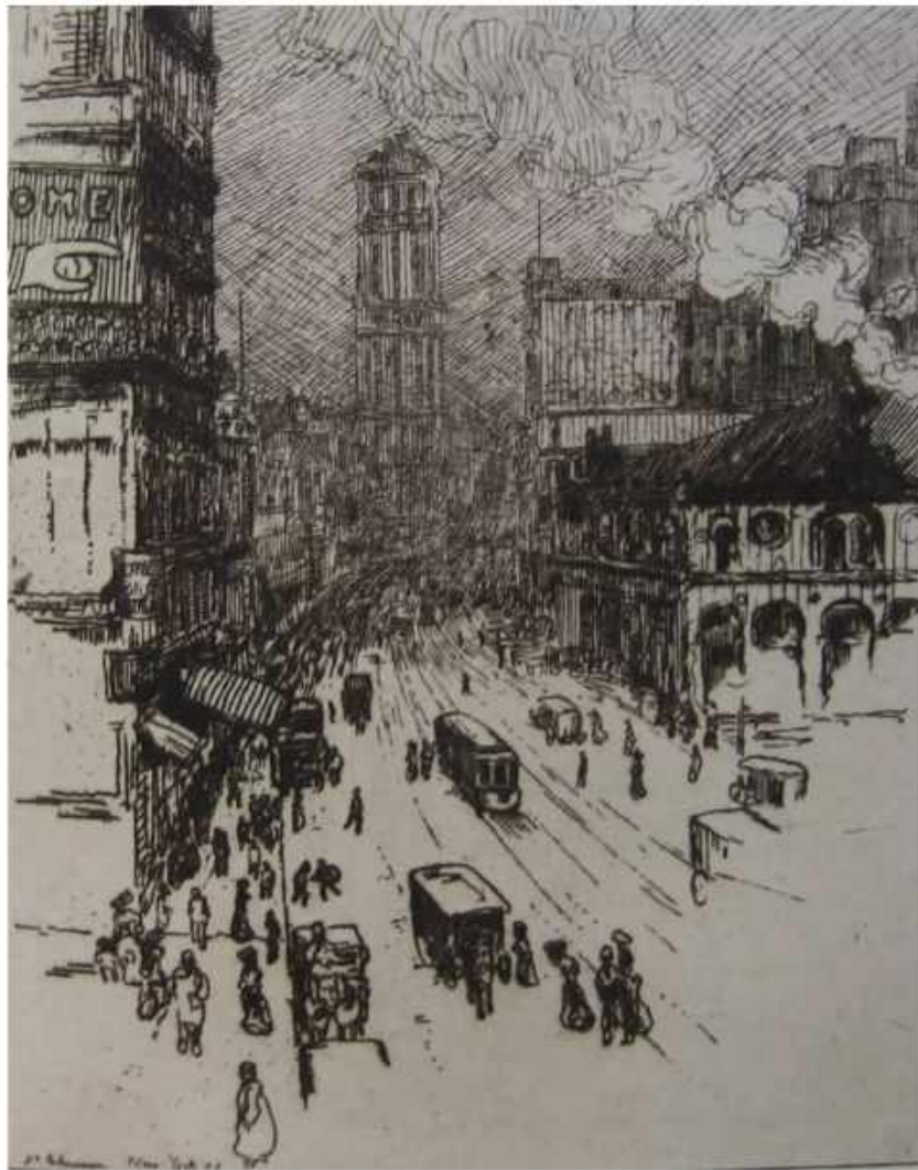
Jean-Emile Laboureur "Broadway, New York" Etching 7 x 10.6 inches