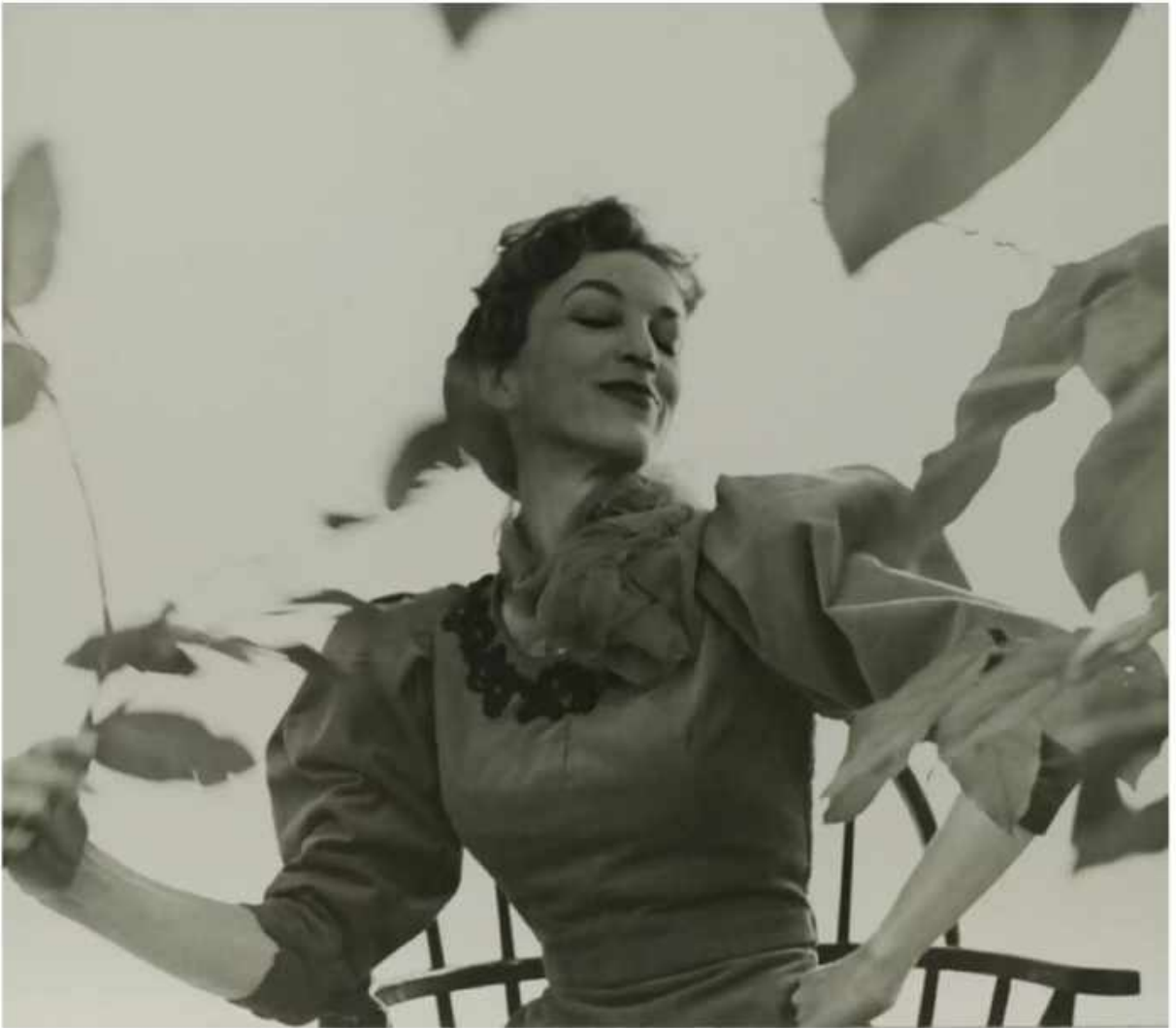
Frank Paulin "Actress Off Broadway Play" Gelatin Silver Print 12 x 10.5 inches