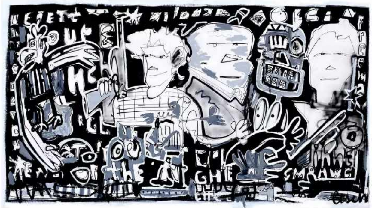
Jonas Fisch "French Theatre" Acrylic, Airbrush, Charcoal & Oil Stick on Canvas 81 x 47 inches