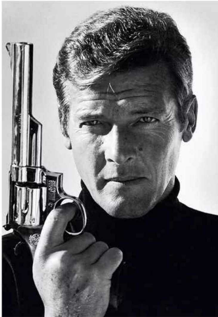
Terry O'Neill "Roger Moore as James Bond" Archival Pigment Inkjet Print 29.9 x 39.8 inches