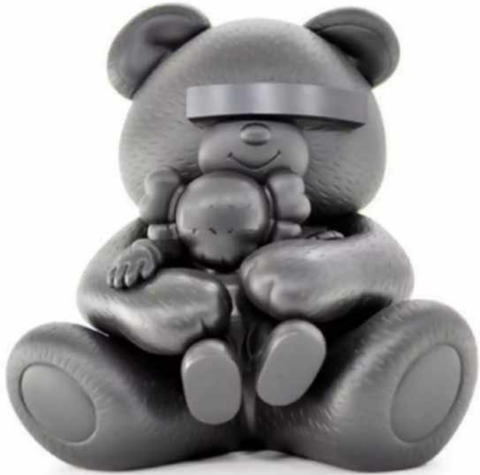
KAWS "Undercover Bear" Cast Vinyl 5.5 x 5.5 inches