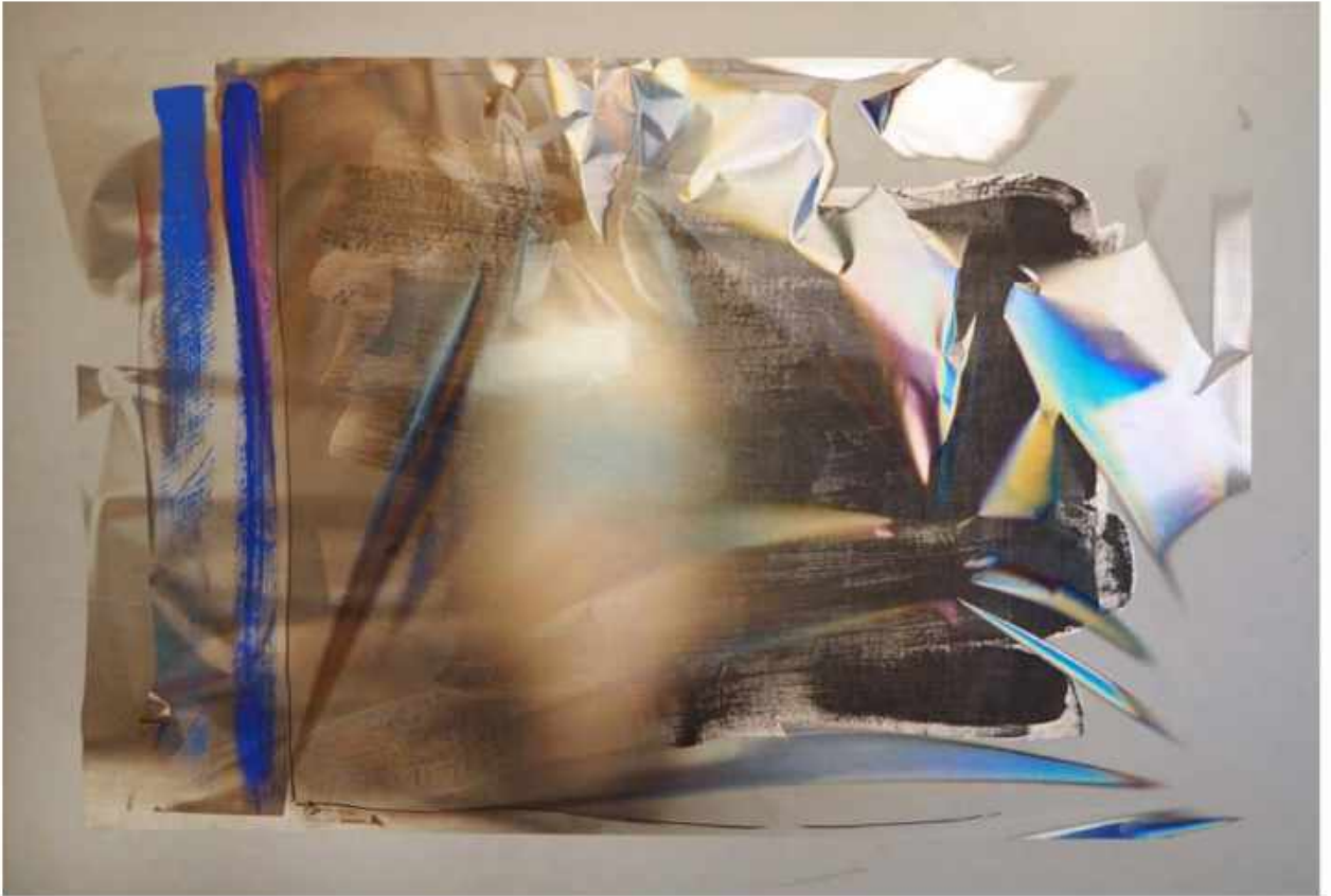
Larry Bell "Ballaire" Oil & Mixed Media on Canvas 56 x 38.25 inches