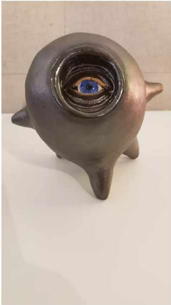
Susan Budge "Eye Spy" Stoneware 5 x 5 x 5 inches