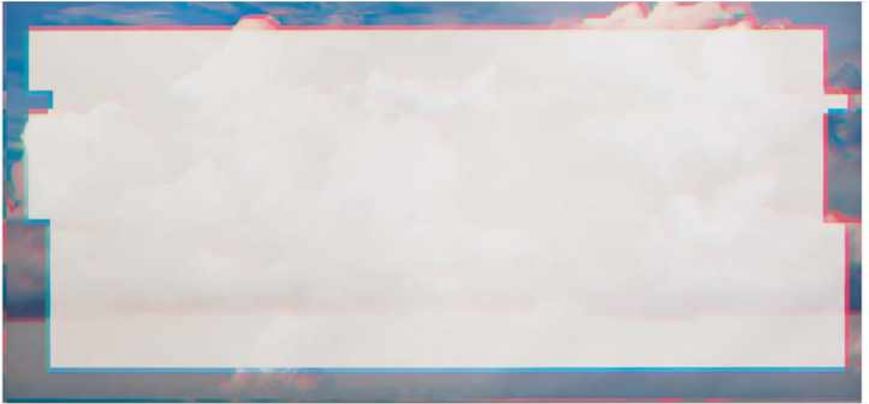
Christian Eckart "Long Clouds Glitched" Unique Archival Digital Print on Stretched Canvas 94.5 x 46 inches