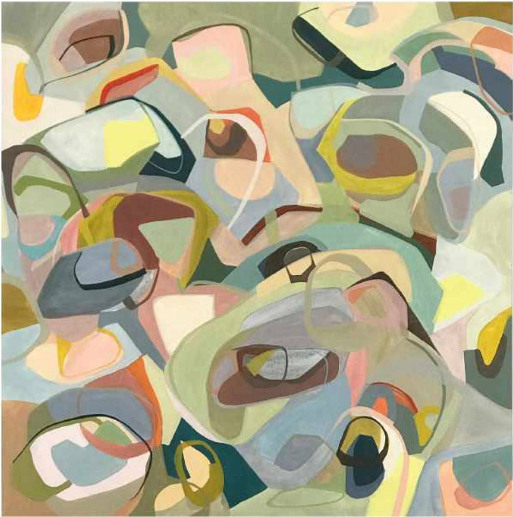
Madison Bloch "Feminine Essence" Acrylic on Canvas 48 x 48 inches