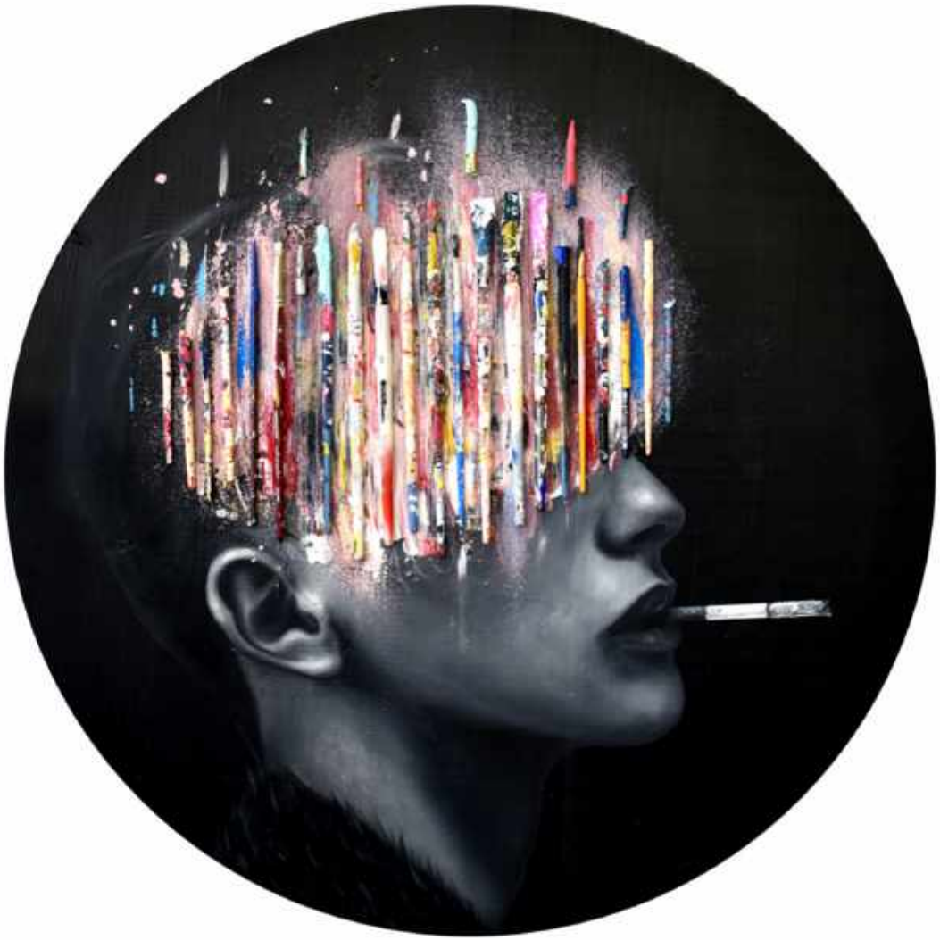
Alex Achaval "Ash" Oil, Acrylic & Paintbrushes on Wood 22 inches