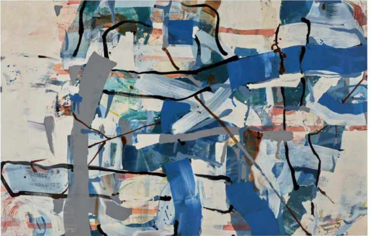
Peter Sullivan "Untitled (#539)" Oil on Canvas 102 x 66 inches