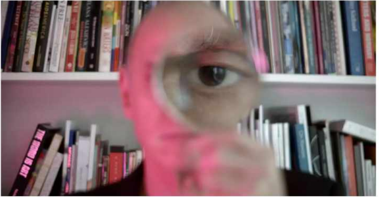
Patricia Olynyk "I Spy" Digital C-Print 28 x 18.5 inches