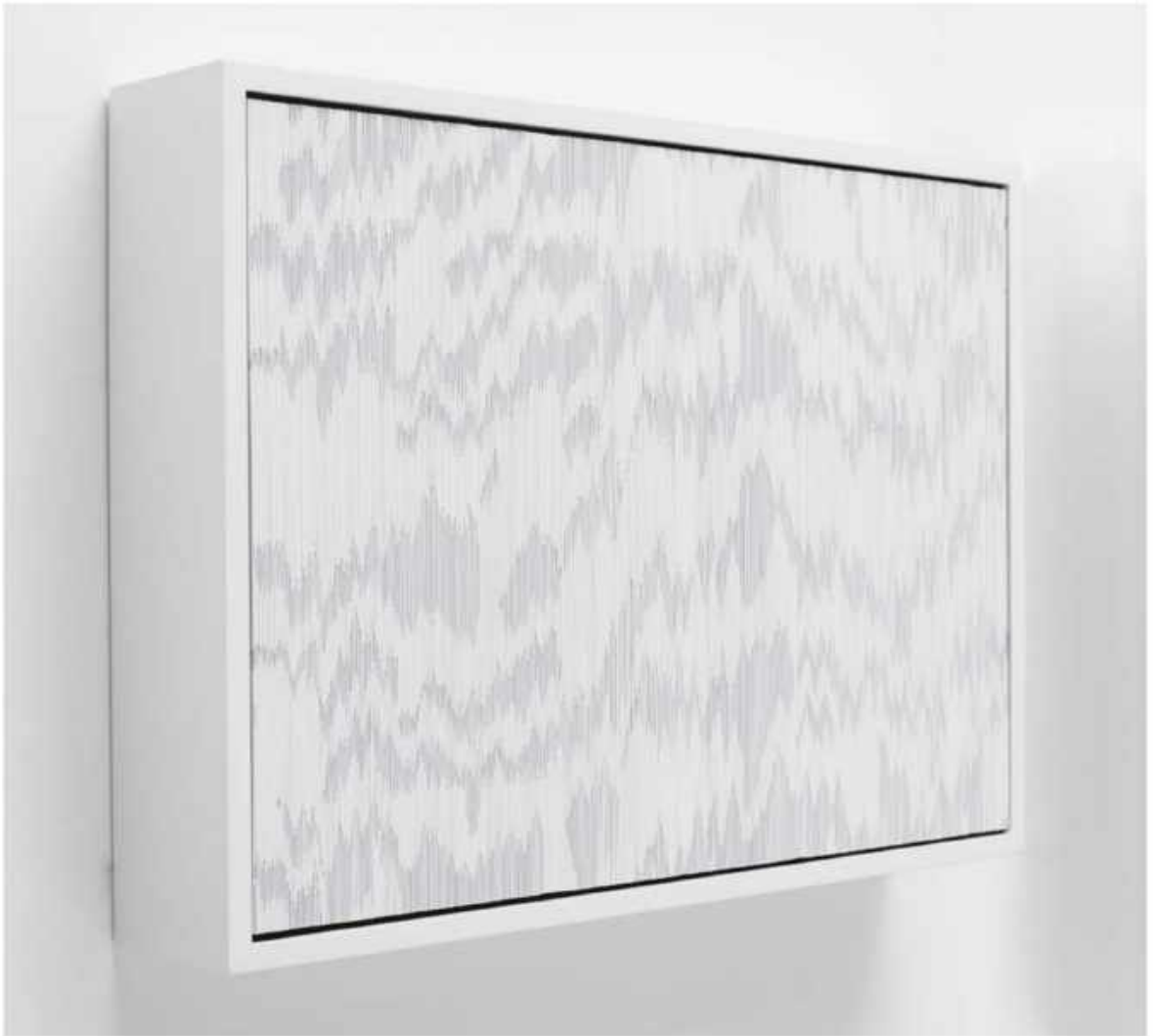
Tara Donovan "Composition (Cards)" Styrene Cards & Glue 22.25 x 16.25 x 4 inches