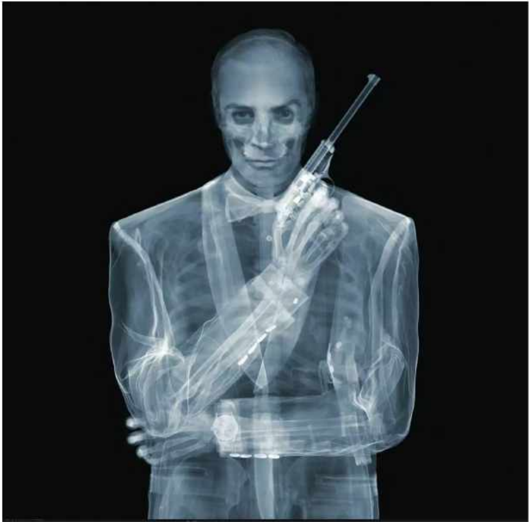
Nick Veasey "James Bond" Digital C Print 23 x 23 inches or 47 x 47 inches