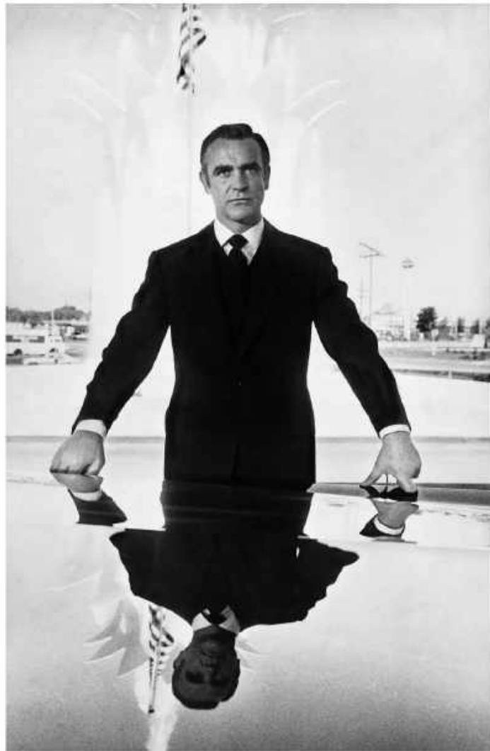
Terry O'Neill "Sean Connery As Commander James Bond 1971" Silver Gelatin Print 16 x 20 inches or 20 x 24 inches