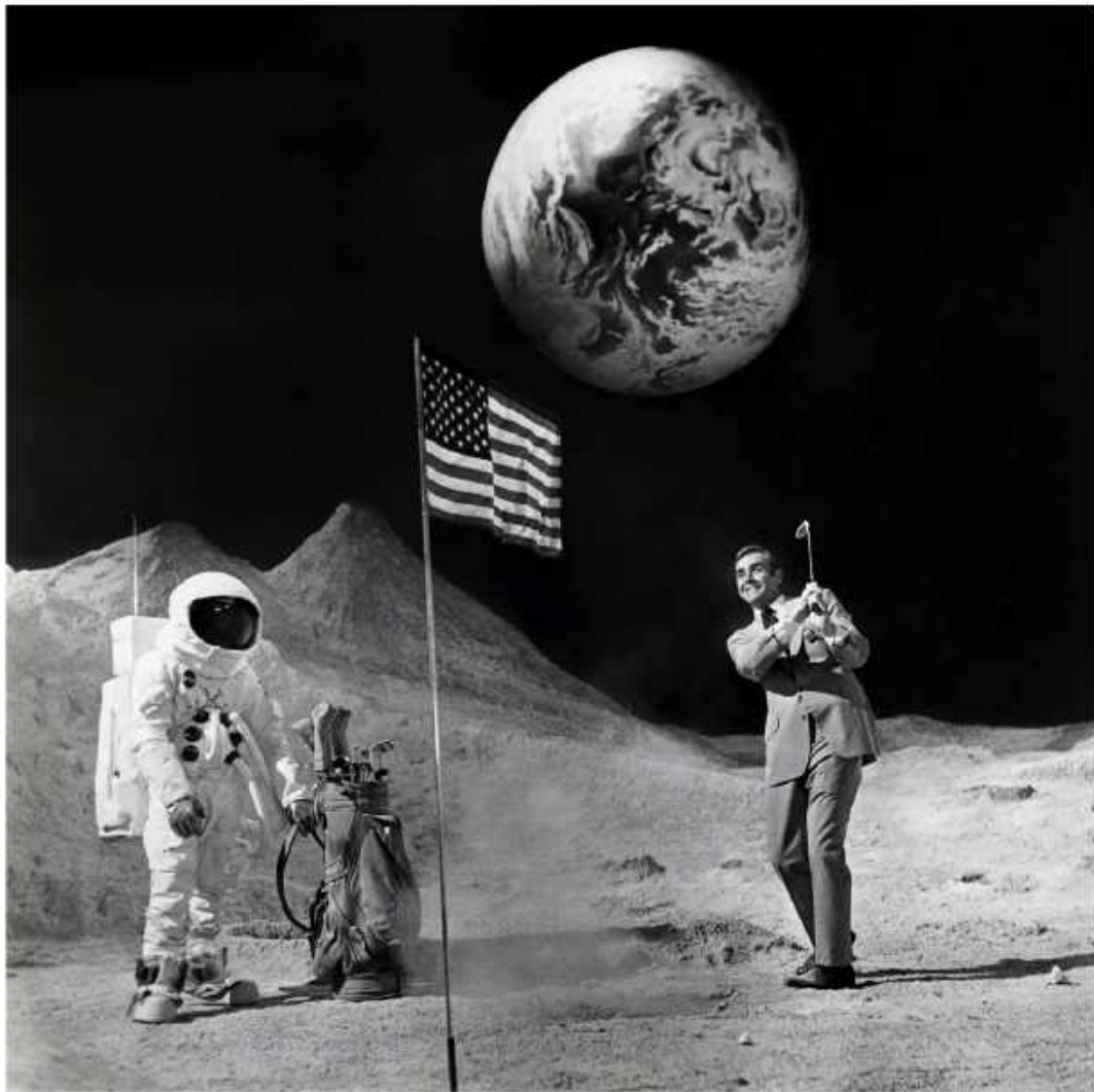
Terry O'Neill "Sean Connery, Bond on the Moon" Silver gelatin Print 20 x 24 inches