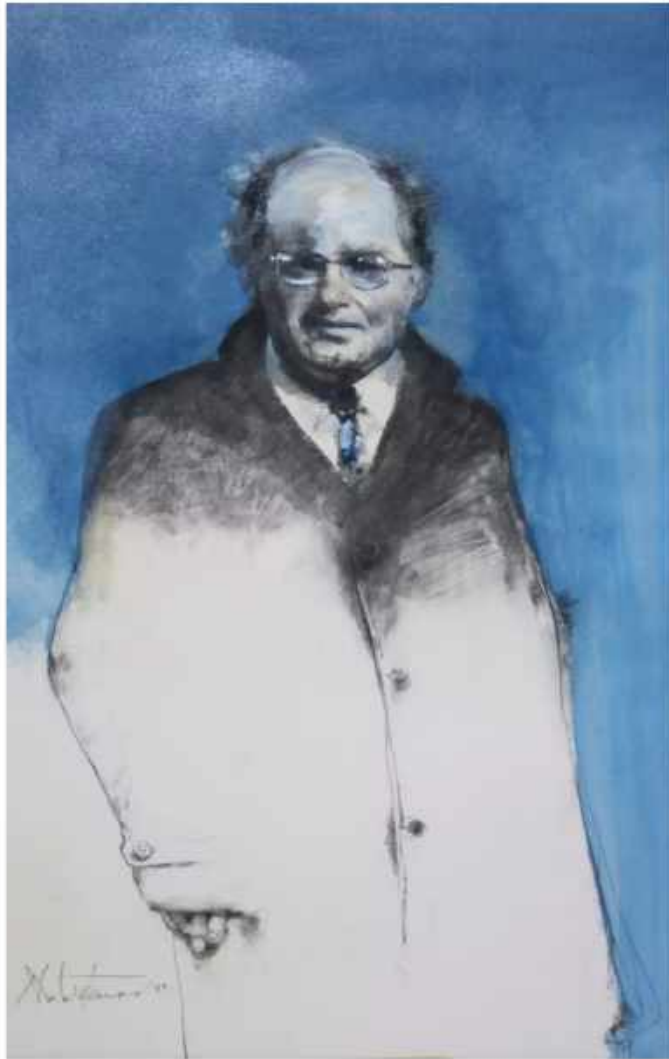
Herbert Tauss "Tinker, Tailor, Solider, Spy" Gouache 18.5 x 28 inches