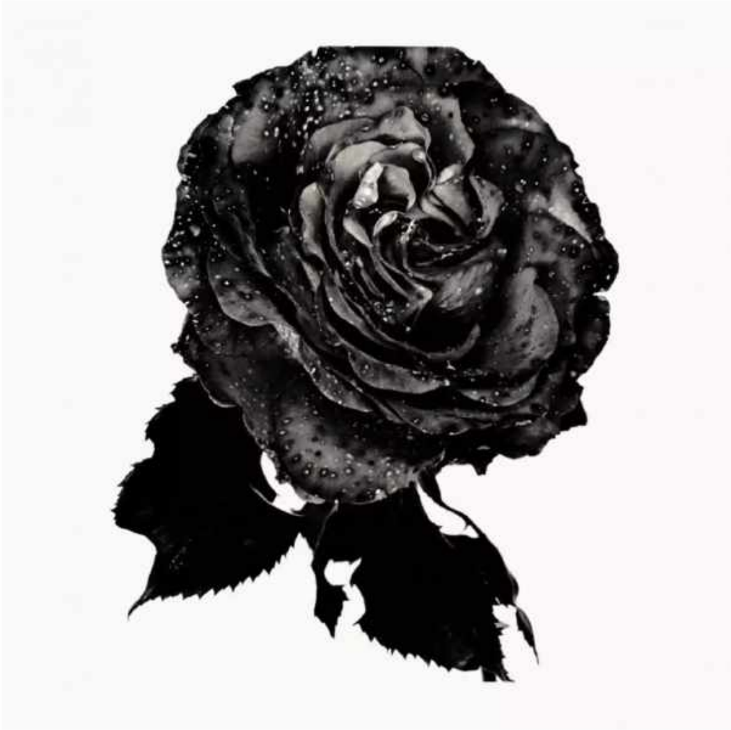
Nick Knight "Black Rose" Hand Coated Pigment Print 30 x 40 inches