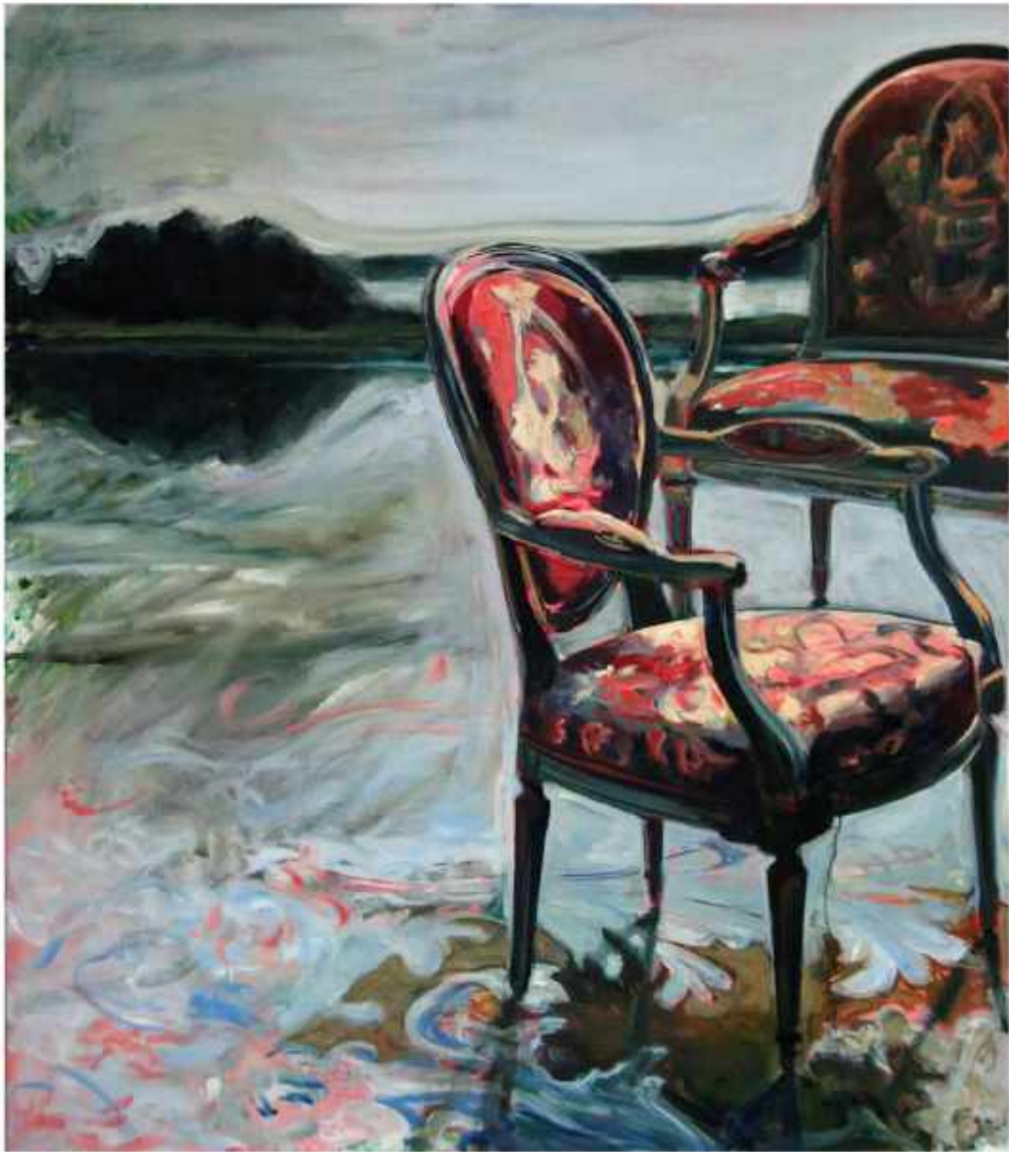
Anne Sherwood Pundyk “Grand Trianon” Oil and Acrylic on Linen 45 x 55 inches