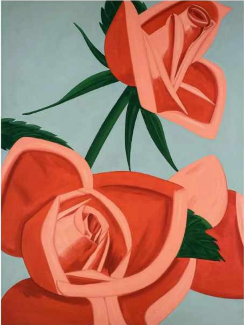
Alex Katz "Rose Bud" Pigment Ink Print 30 x 44 inches