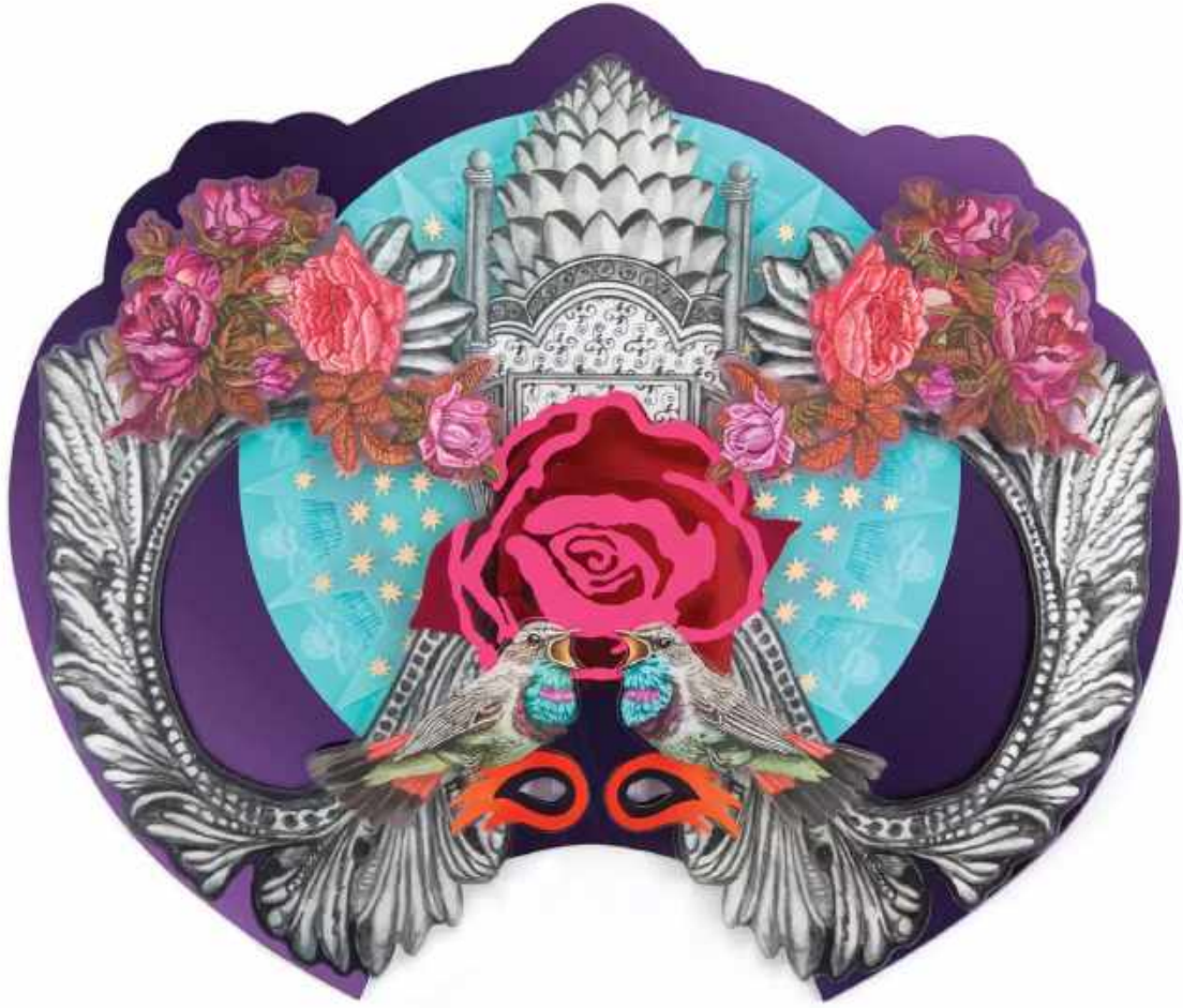
Pamela Joseph "Rosacea" Acrylic and Mixed Media on Plexiglass 44 x 37 x 3 inches