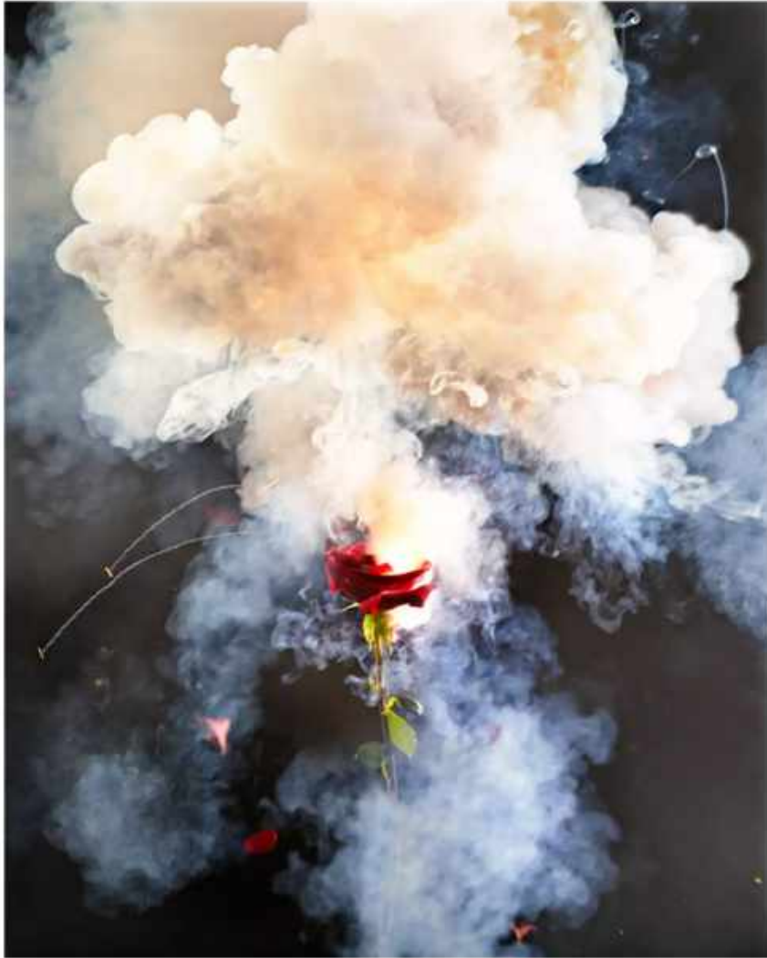
David Drebin "Exploding Rose" Digital C-Print 48 x 60 inches