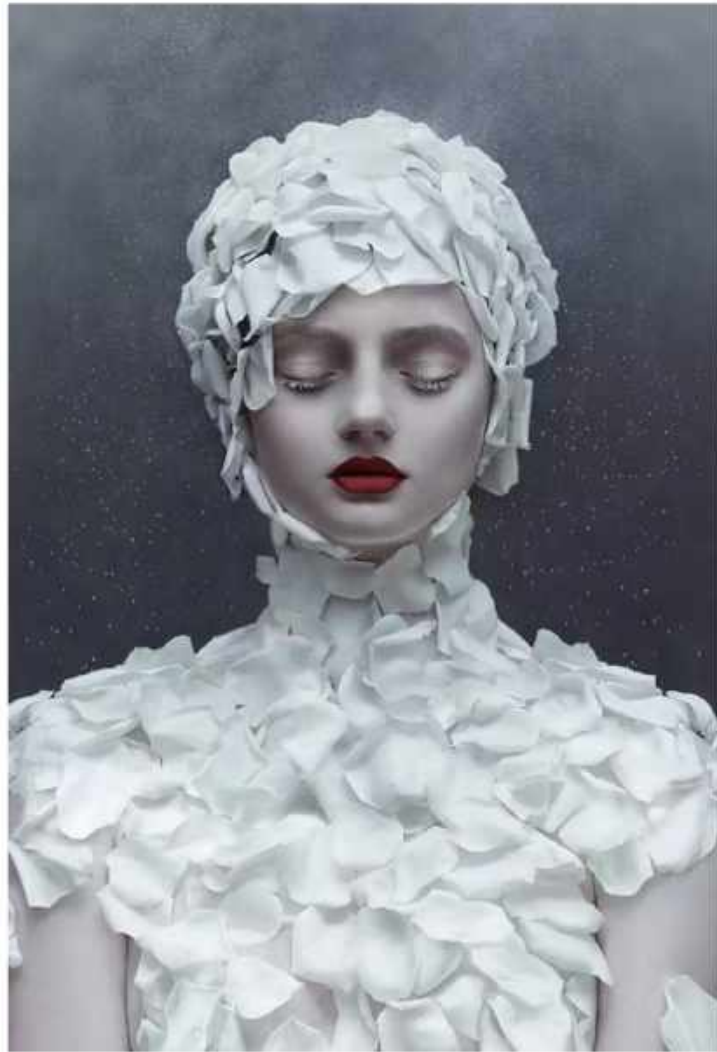
Jingna Zhang "Winters Rose" Haunemuhle Fine Art Paper 28.5 x 42 inches