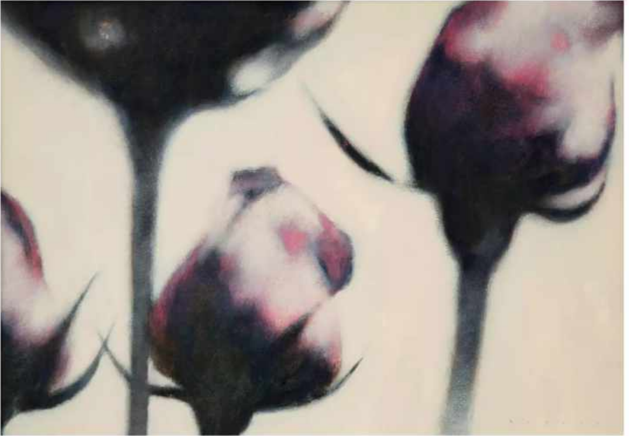
Massimo Barlettani "Rose" Acrylic on Wood 27.6 x 19.7 inches