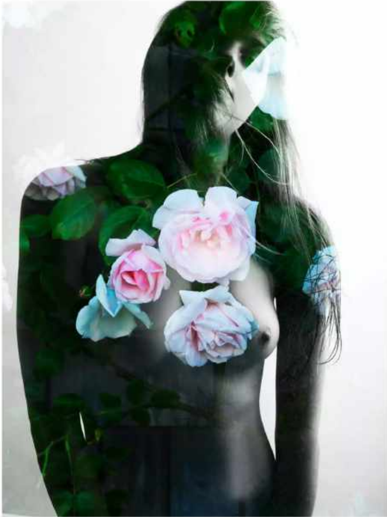
Nathan Coe "Sconset Rose" Archival Pigment Print 30 x 40 inches