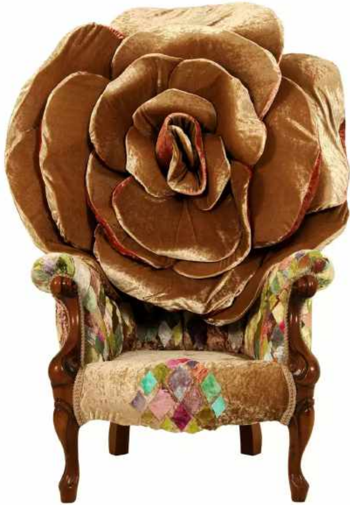
Carla Tolomeo "Rose Arlequin" Pontoglio Iridescent Silk velvet, Collage & Passementerie 31.5 x 35.4 x 51.2 inches