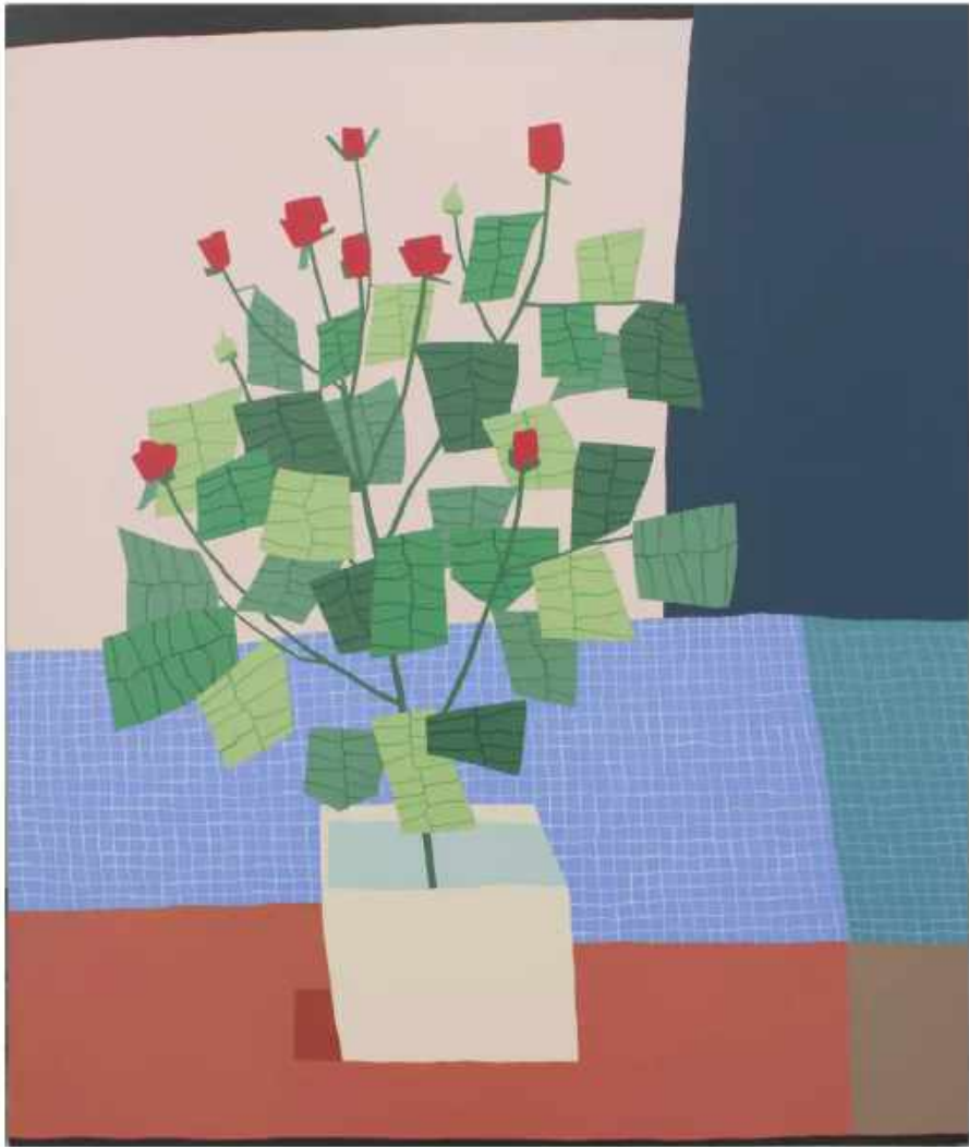
Motonori Uwasu "Rose" Acrylic on Canvas 23.9 x 28.6 inches