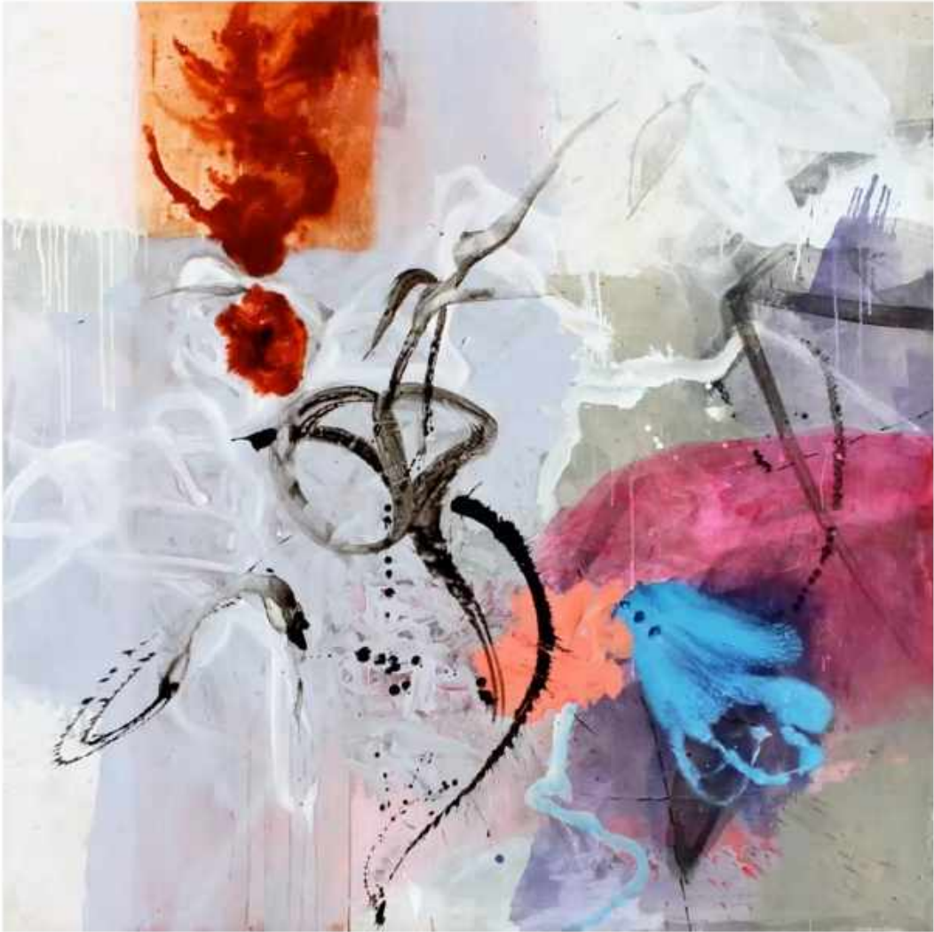
Allixon Stewart "Wild Rose" Mixed Media on Canvas 60 x 60 inches