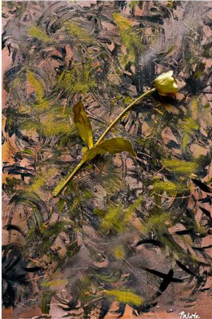
Gayle Printz "Rose" Mixed Media 24 x 36 inches