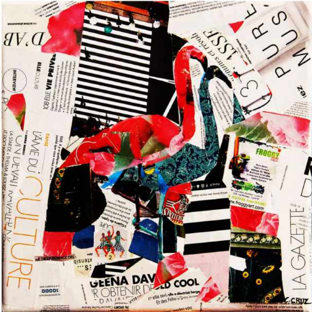
Claude Cruz "Flamands Rose Bleu" Photographie & Collage Contrecolle Encadre 19.7 x 19.7 inches