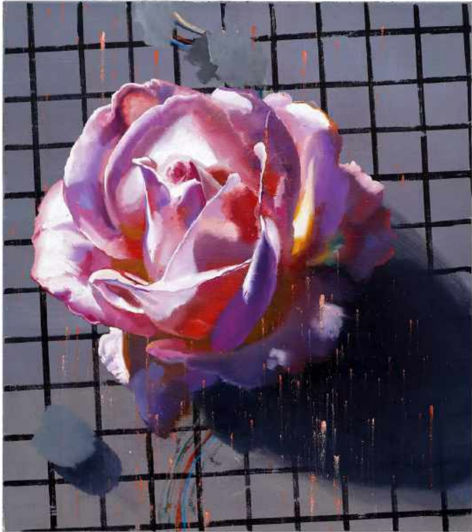
Rayk Goetze "Rose" Oil and Permanent Marker Pen on Canvas 27.6 x 31.5 inches