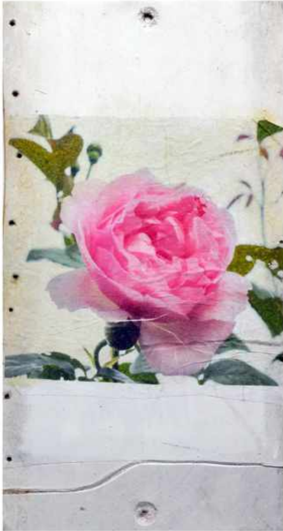
Russell Frampton "Lone Rose" Mixed Media 5.7 x 10.6 inches