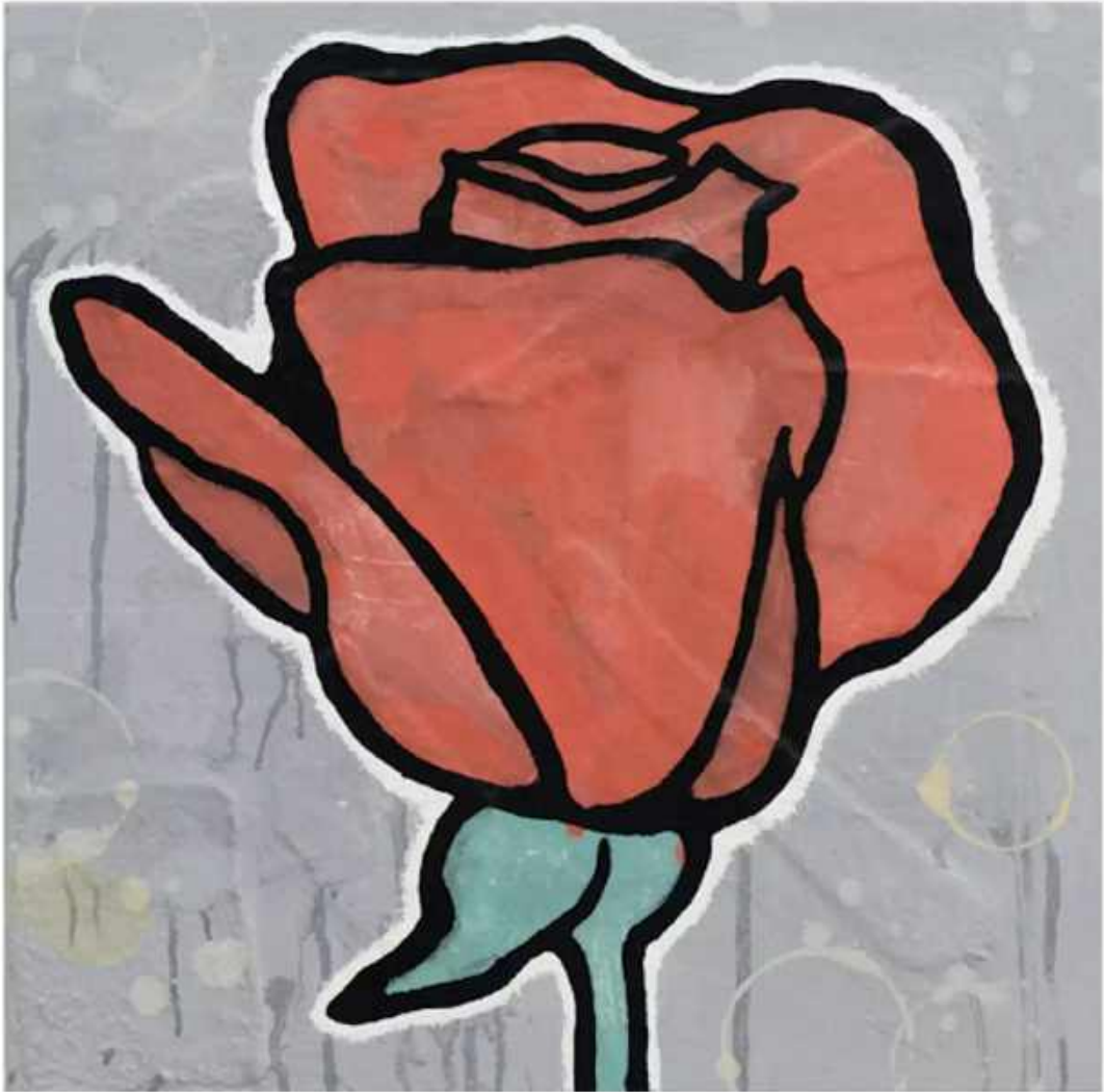
Donald Baechler "Rose" Acrylic and Fabric Collage on Canvas 24 x 24 inches