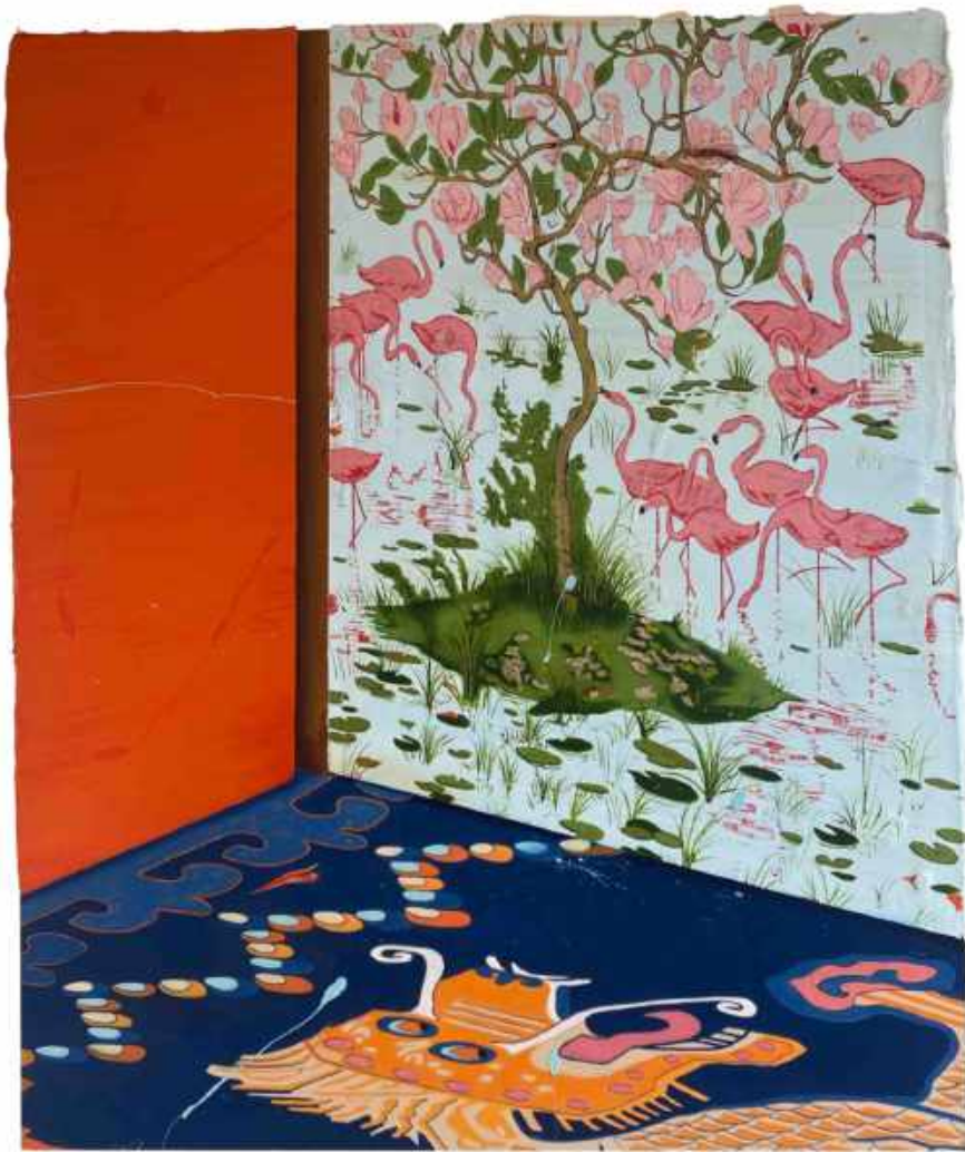
Stephen Thrope 'Nights Through Dreams, Tell The Myths Forgotten by the Day' Oil on Canvas 39.4 x 47.2 inches