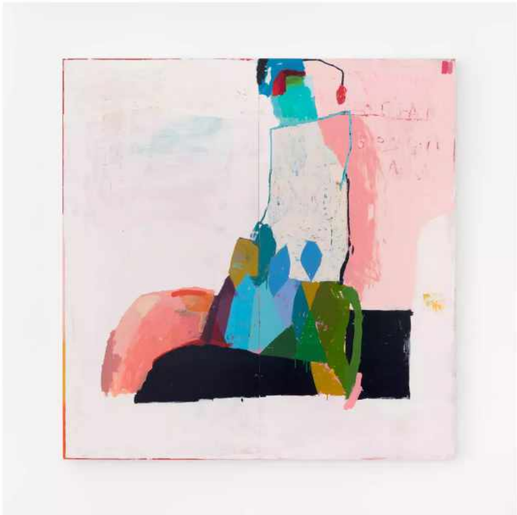
Dnany Gretscher 'Ocean Song, 2022' Acrylic, Spray Paint & Oil Pastel on Board 66.9 x 66.9 inches