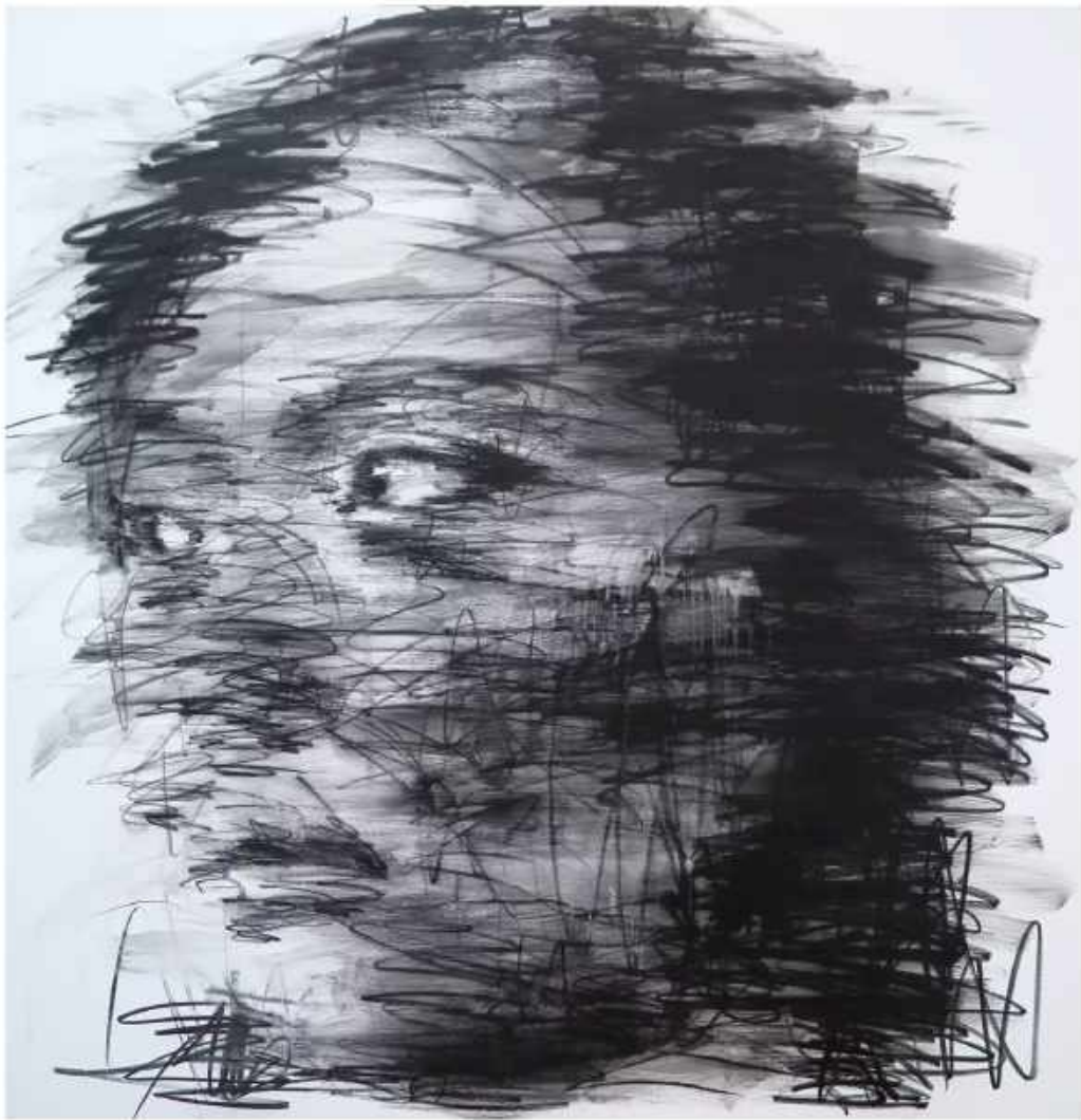
Hom Nguyen 'Untitled #8' Black Stone & Charcoal on Canvas 47.2 x 47.2 inches