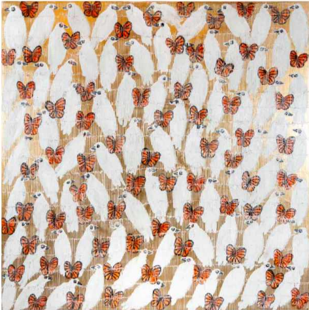
Hunt Slonem "Peace Plan Score" Oil on Canvas 72 x 72 inches