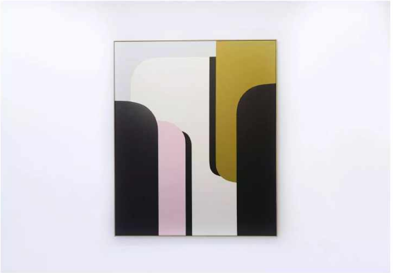
François Bonnel "Free From Gravity" Acrylic on Canvas 39.4 x 47.2 inches