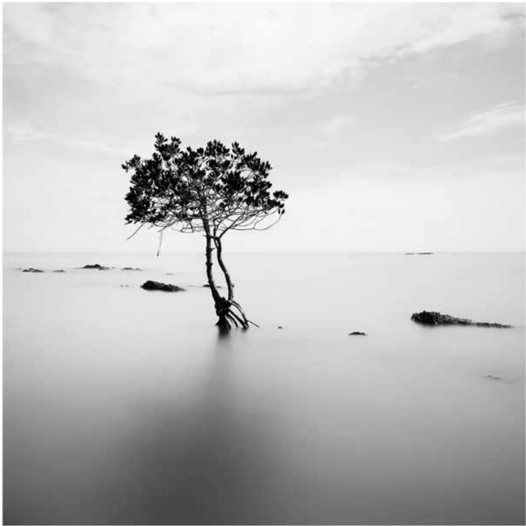
Alexandre Manuel 'Landscape I' Archival Pigment Print 40 x 40 inches