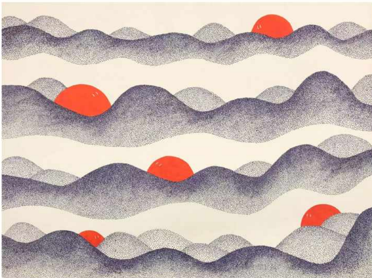
Chickenmew 'The Power of Dots' Acrylic & Marker on Canvas 31.5 x 23.6 inches