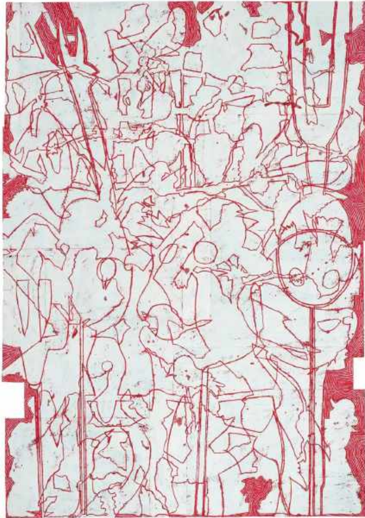
Bo Joseph 'Taking the Auspices' Oil Pastel, Acrylic & Tempera on Joined Paper 56.25 x 79.5 inches