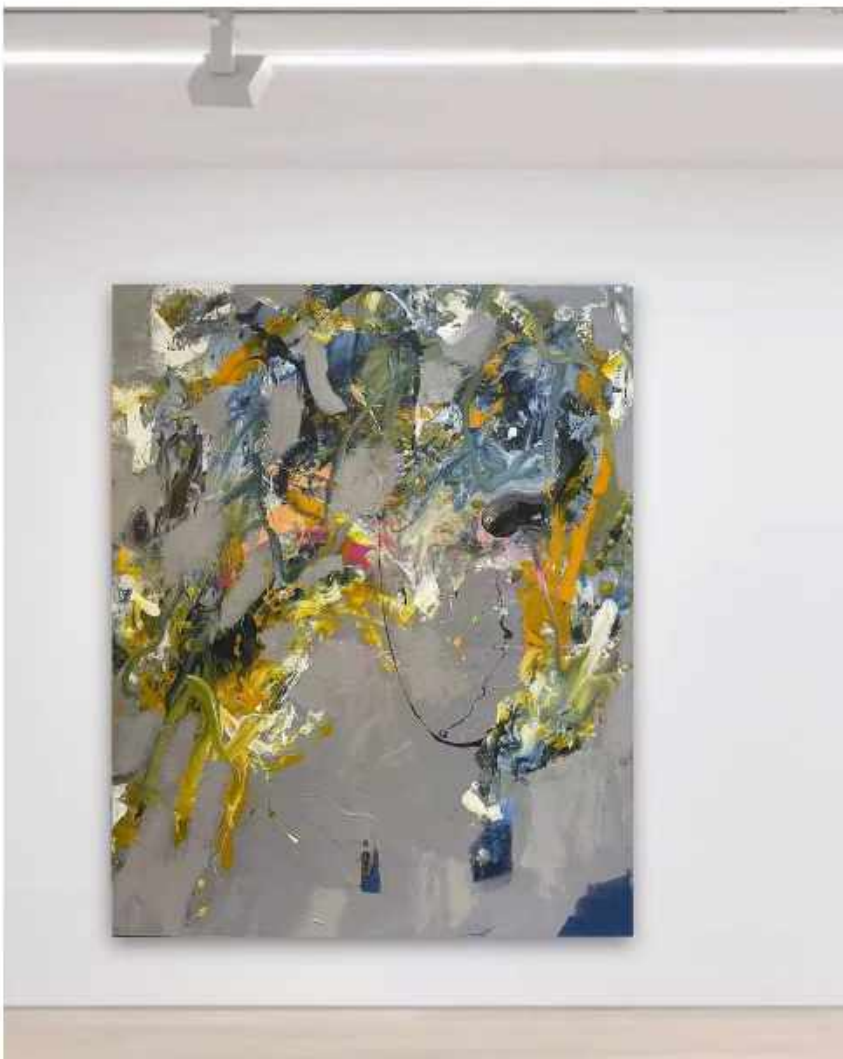
Ian Rayer-Smith "Dining on Trampolines" Acrylic on Canvas 48 x 59.8 inches