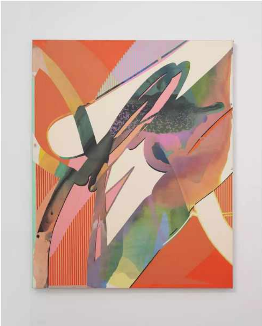
Kathryn MacNaughton "Shattered Hues" Acrylic on Canvas 47.2 x 59.1 inches