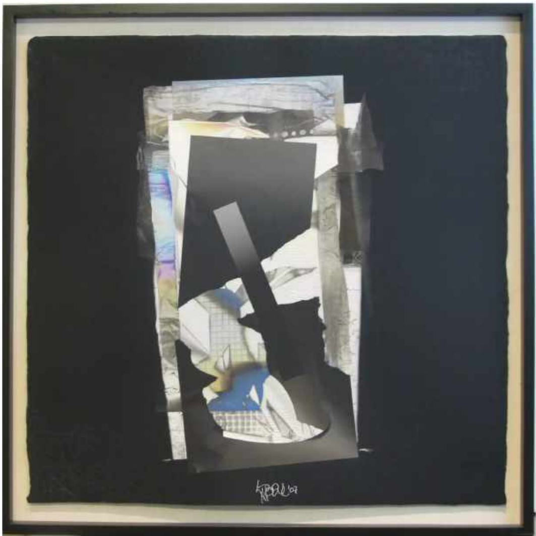
Larry Bell 'AAAAA 36' Mixed Media on Black Hiromi Paper 39.5 x 39.5 inches