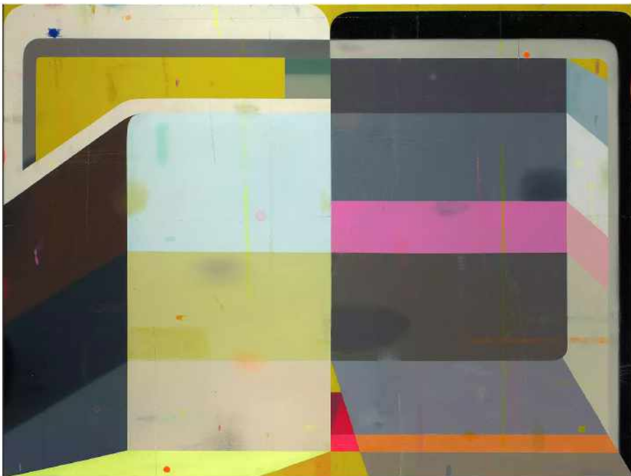
Deborah Zlotsky "Upsy Daisy" Oil on Canvas 48 x 36 inches