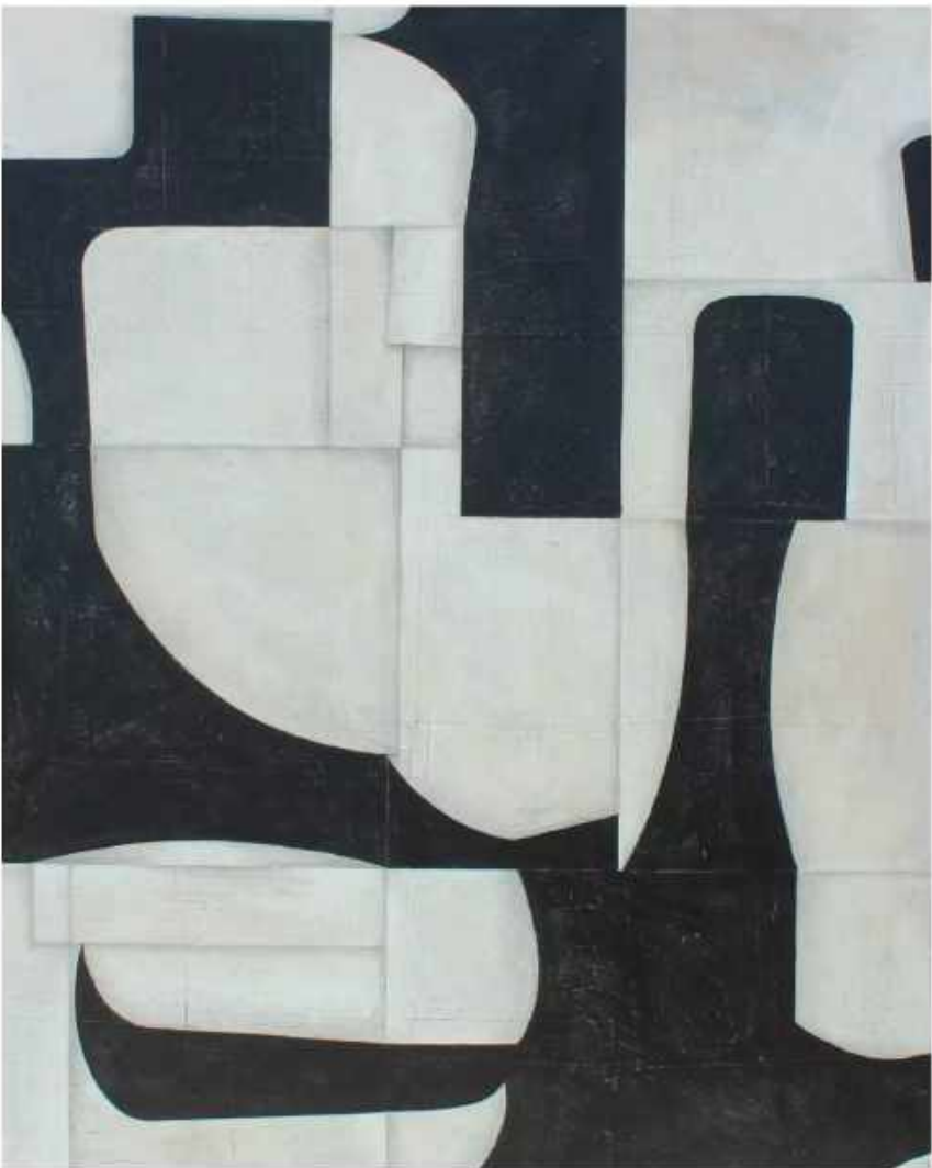
Cecil Touchon "PDP 888" Acrylic on Paper on Canvas 48 x 60 inches