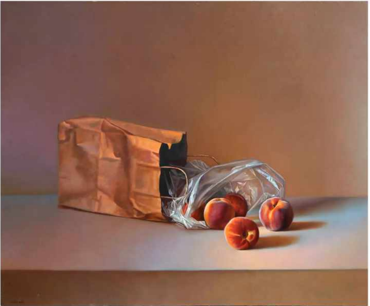
Gustavo Schmidt 'Bag of Peaches' Oil on Canvas 46 x 37 inches