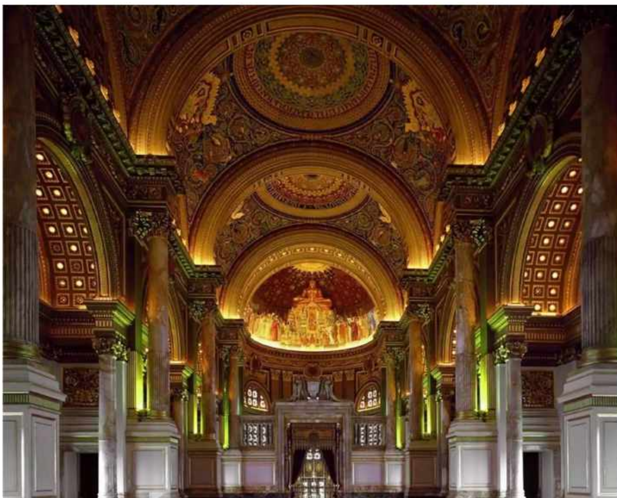
Massimo Listri 'Sala del Trono, Bangkok' Chromogenic Print 59.1 x 47.2 inches