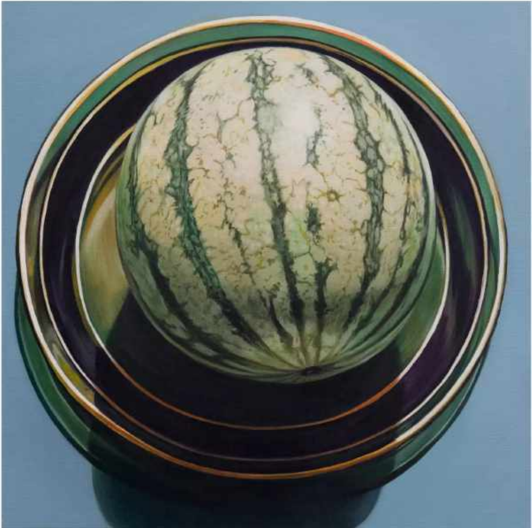
Sherrie Wolf "A Watermelon" Oil on Canvas 12 x 12 inches