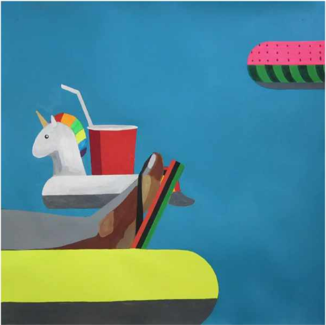
Derrick Adams "Float 35" Acrylic & Fabric on Paper 25 x 25 inches