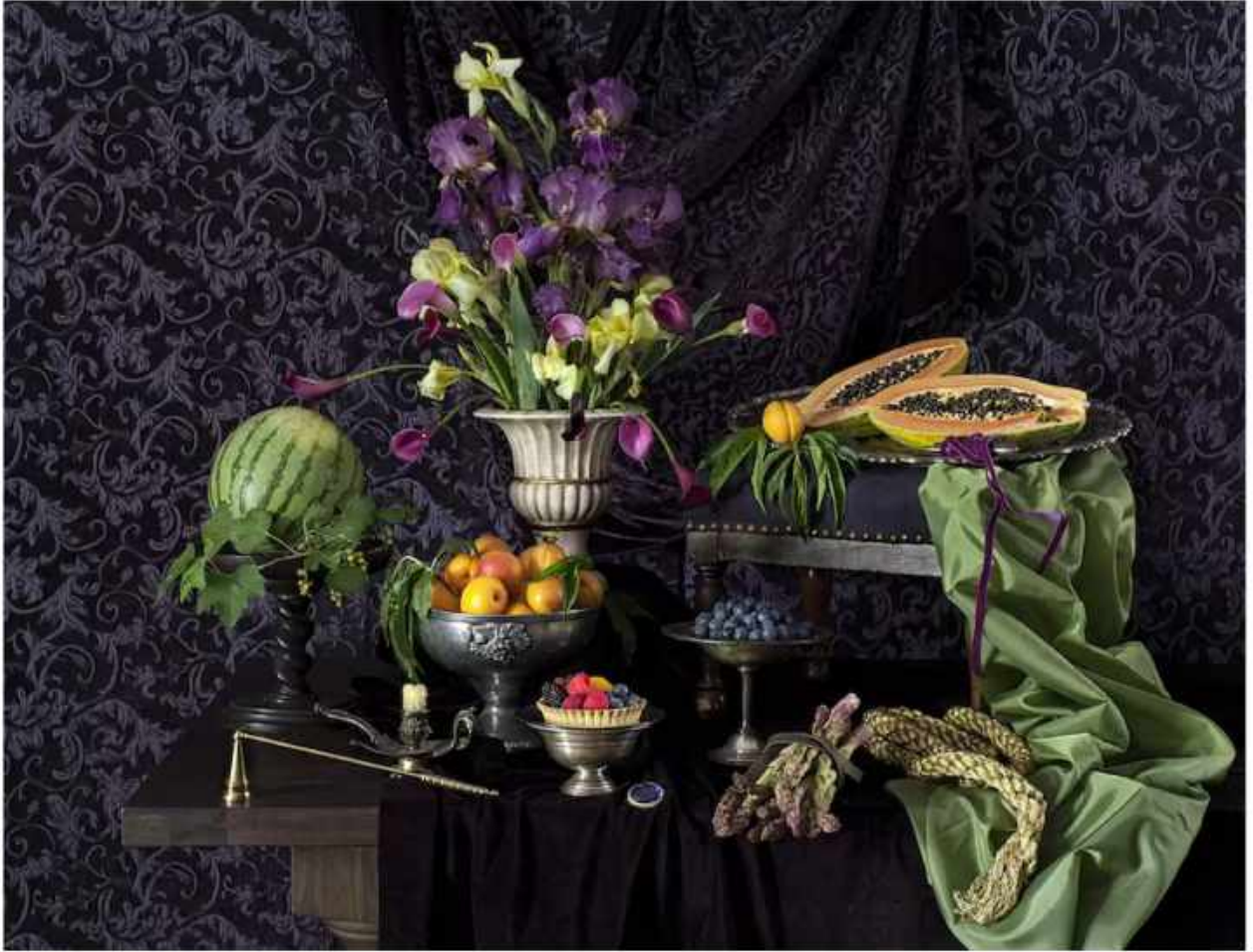
Yelena Strokin "Silver Bowl with Apricots" Giclee Print Limited Edition 19 x 13 inches