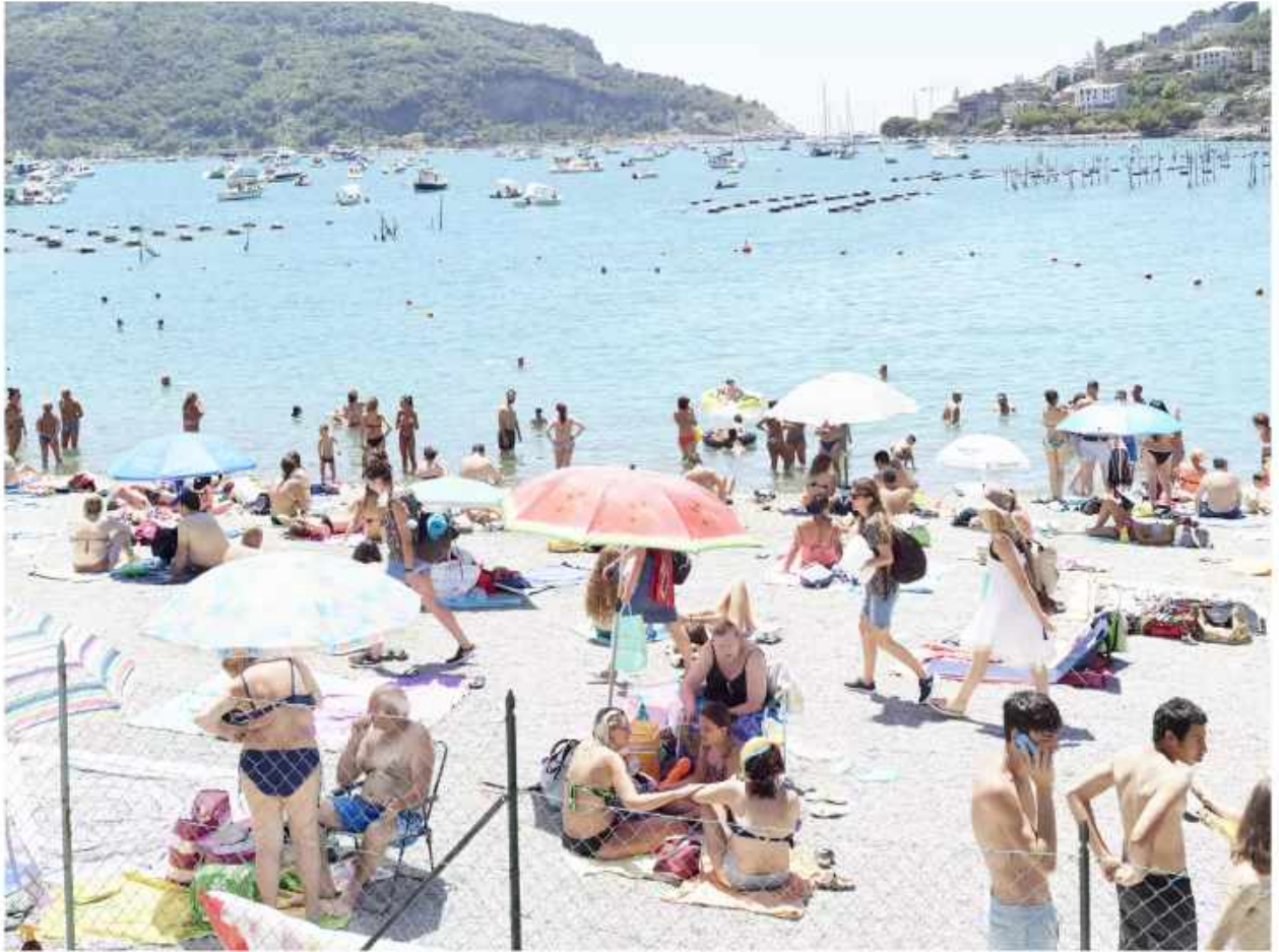
Massimo Vitali "Porto Venere Watermelon" Fine Art Photograph Limited Edition 76.8 x 61 inches