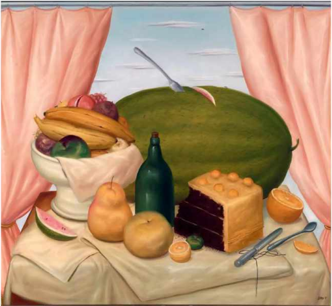
Fernando Botero "Still-Life with Watermelon" Oil on Canvas 74.625 x 68.625 inches