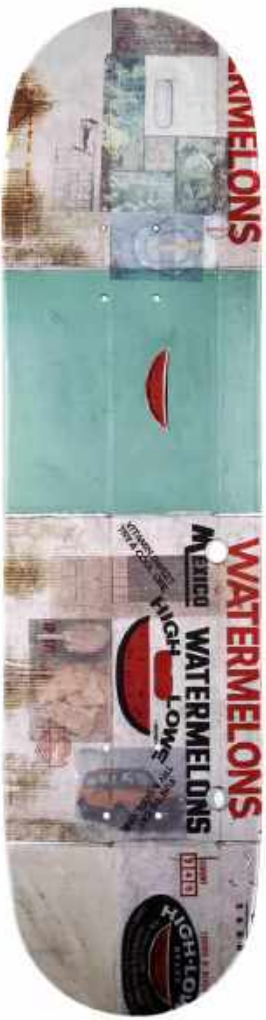
Robert Rauschenberg "Watermelon Medley" Screenprint on Maple Wood Limited Edition 7.9 x 31.5 inches