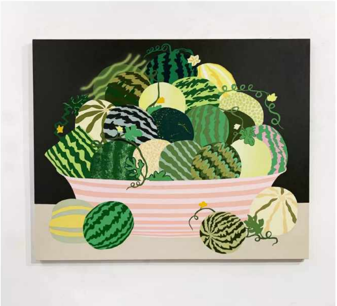
Stephen D'Onoforio "Still Life with Watermelons" Acrylic on Canvas 50 x 40 inches