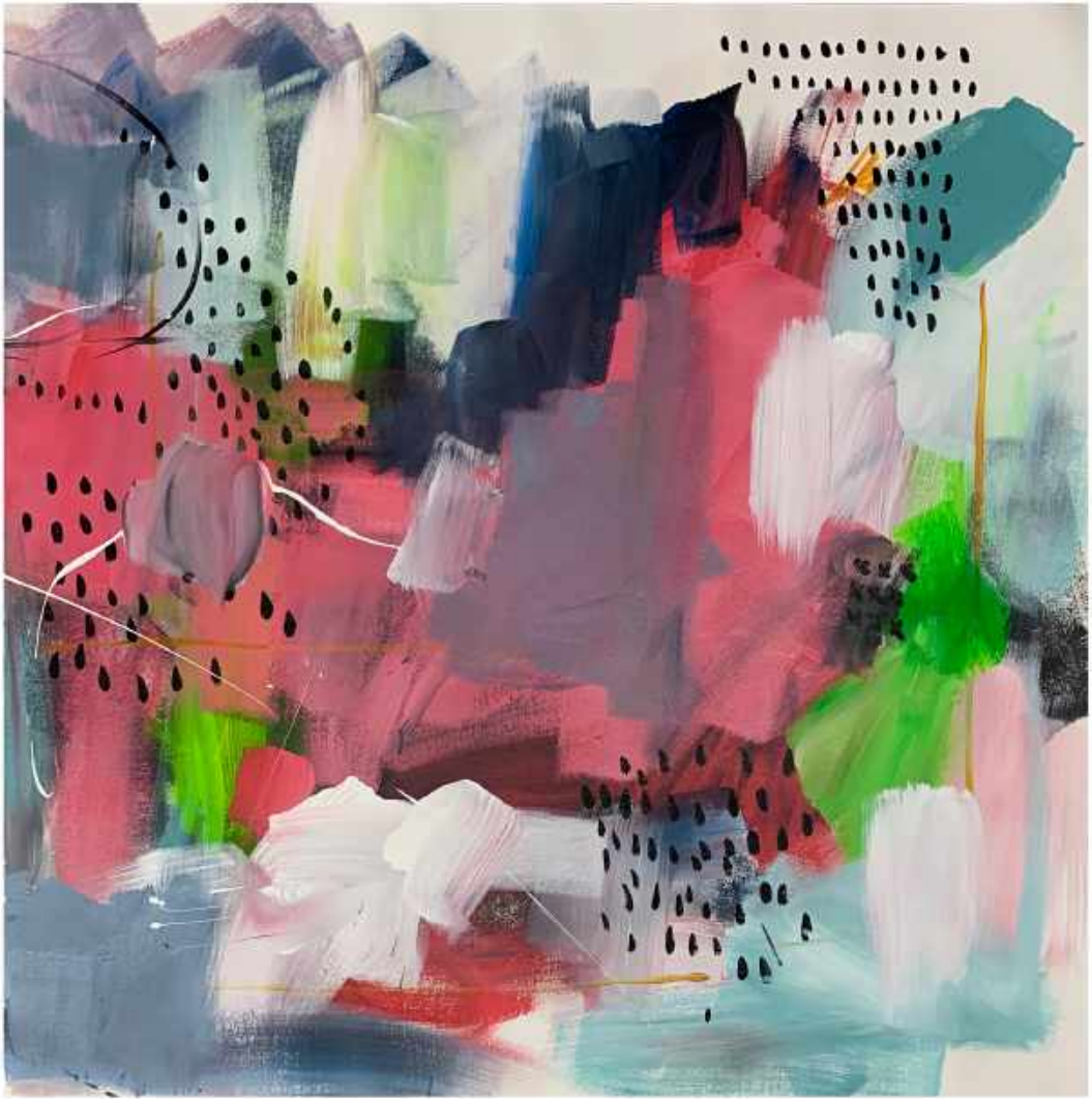
AXIOM Studio "New Friends" Acrylic on Canvas 35 x 35 inches