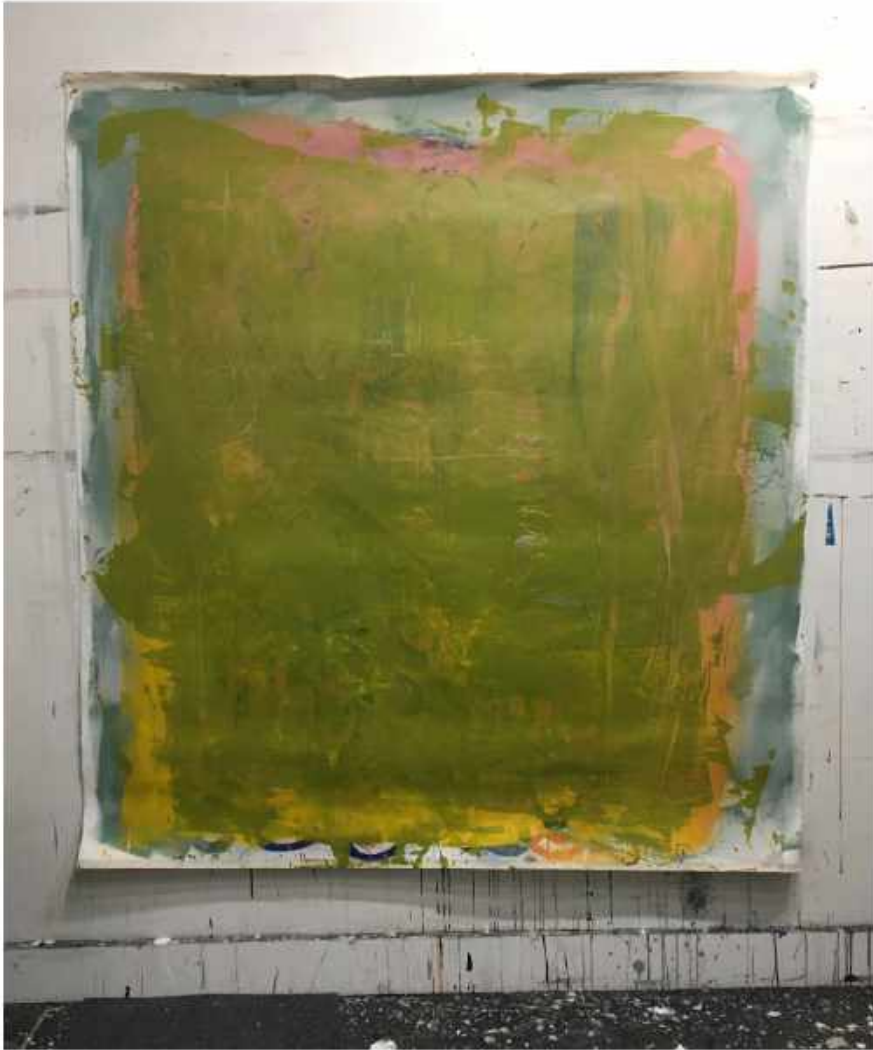
AXIOM Studio "#Green" 2020 Acrylic on Canvas 62 x 68 inches