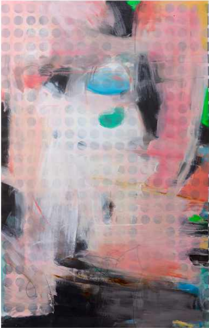
AXIOM Studio "On Spot" 2016 Acrylic on Canvas 47 x 74 inches