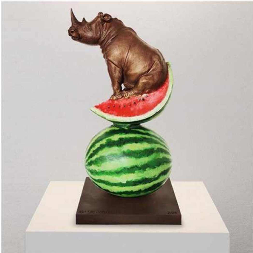
Gillie and Marc "Rhinos Love Watermelons" Original Bronze with Pantina 7.9 x 7.9 x 16.1 inches