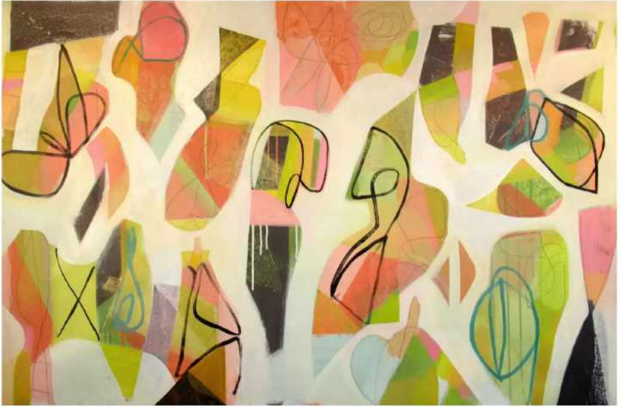
Hal Mayforth "Watermelon" Acrylic & Pencil on Canvas 47 x 30 inches