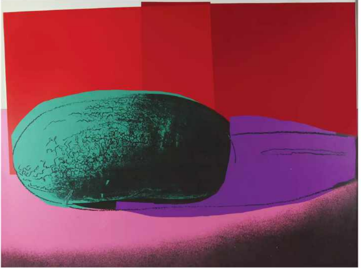
Andy Warhol "Watermelon" Screenprint on Bristol Paper 40 x 32 inches