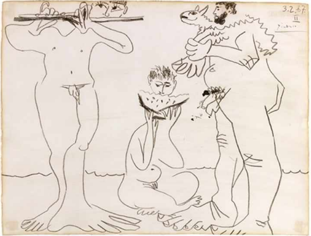
Pablo Picasso "Homme à l'agneau, mangeur de pastèque et flutiste" Crayon on Paper 25 x 19 inches