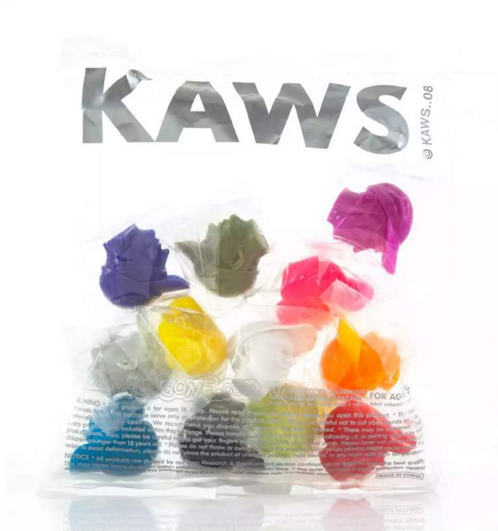
KAWS "Premanent Thirty-Three Heads" Cast Vinyl 1.5 x 1.25 x 1.75 inches