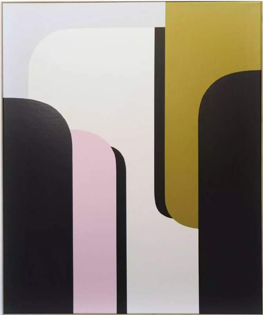
Francios Bonnel "Free From Gravity" Acrylic on Canvas 39.4 x 47.2 inches