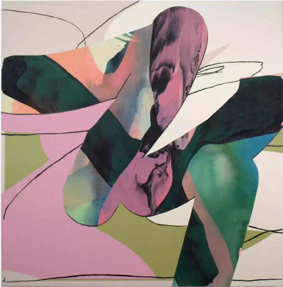
Kathryn MacNaughton "Interwine" Acrylic on Canvas 47.2 x 47.2 inches