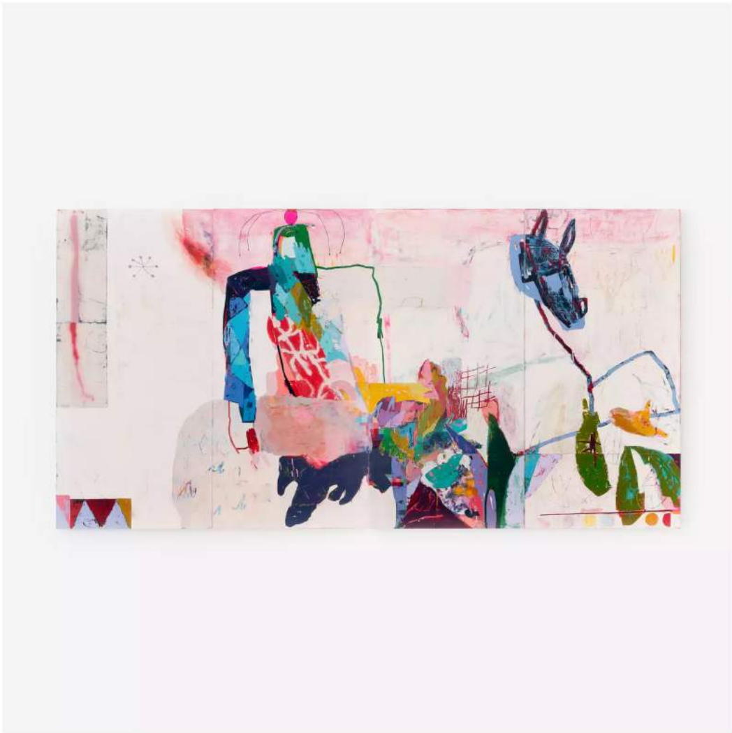
Danny Gretscher "Green Sugar" Acrylic, Spray Paint & Pencil on Board 130.7 x 66.9 inches