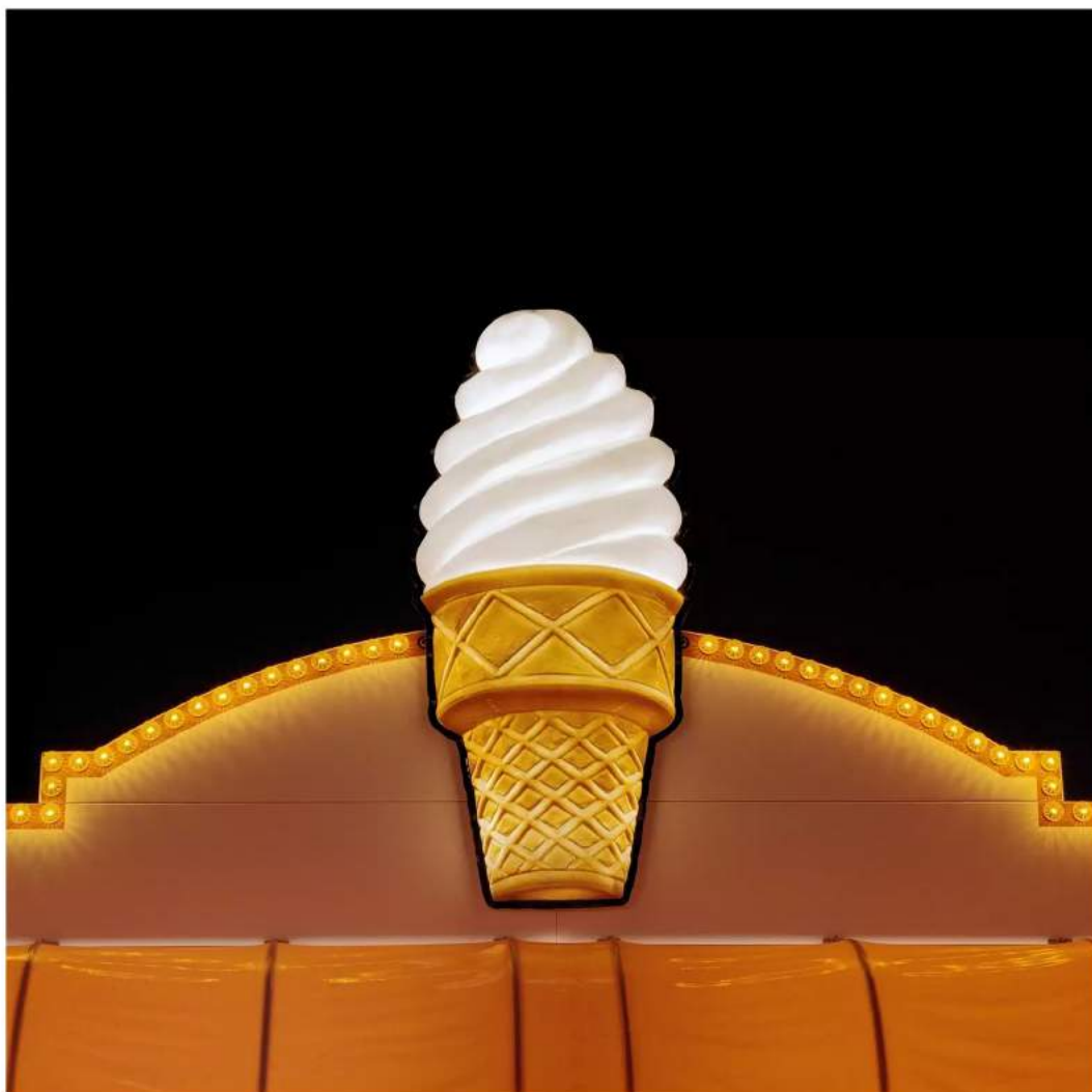
Jeff Brouws "Ice Cream Cone at Night, Ventura California" Archival Pigment Print 30 x 30 inches