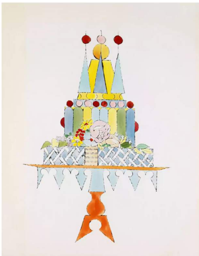
Andy Warhol "Ice Cream Dessert" Watercolor 22.8 x 28.9 inches