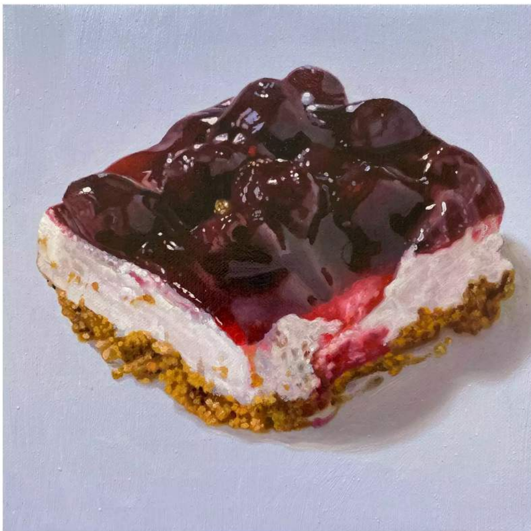
Marc Dennis "Cherry Cheesecake with Hair" Oil on Linen 8 x 8 inches