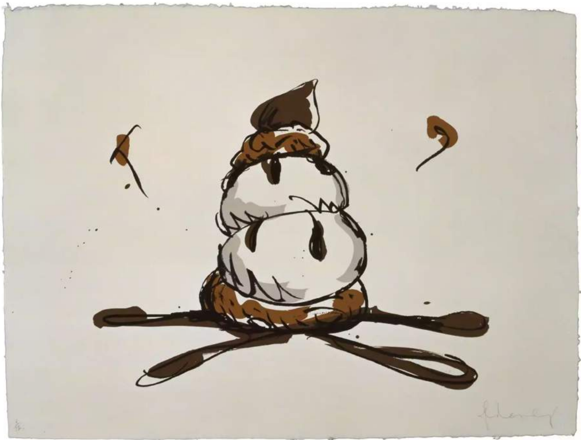
Claes Oldenburg "Profiterole" 5-Color Lithograph 41 x 31.25 inches