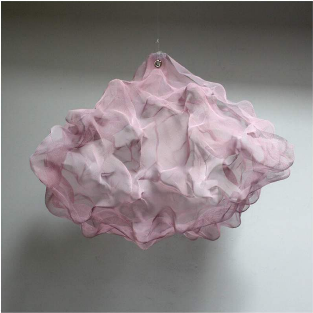
Atticus Adams 'Cotton Candy Cloud' Aluminum Mesh & Mixed Media 12 x 17 x 22 inches