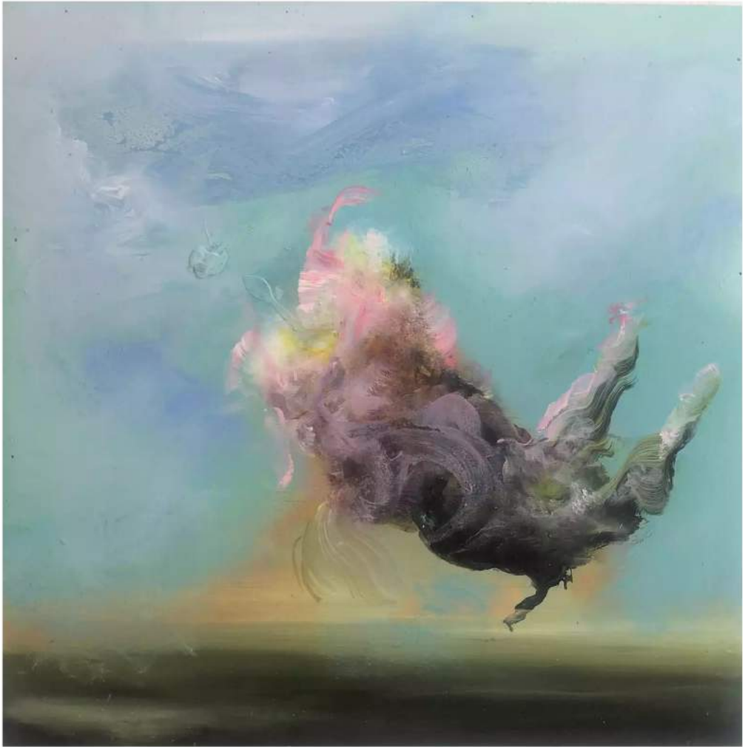
Ian Rayer-Smith "O.T." Acrylic on Panel 17.7 x 17.7 inches