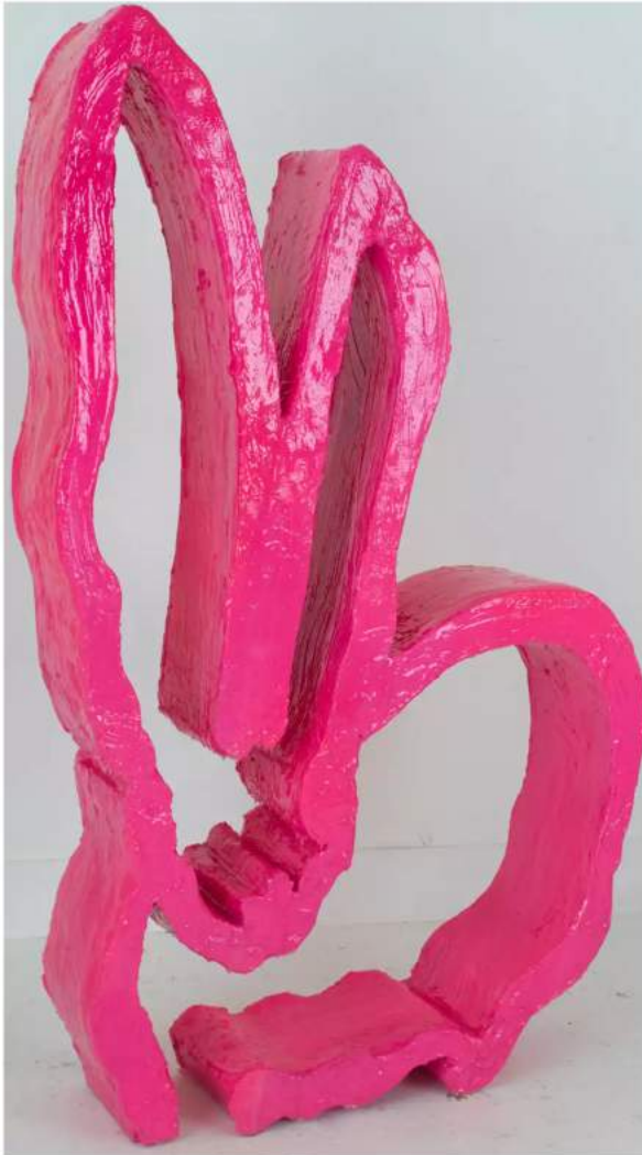
Hunt Slonem "Untitled" Oil, Acrylic, Plaster & Resin on Wood 36 x 61 x 11 inches