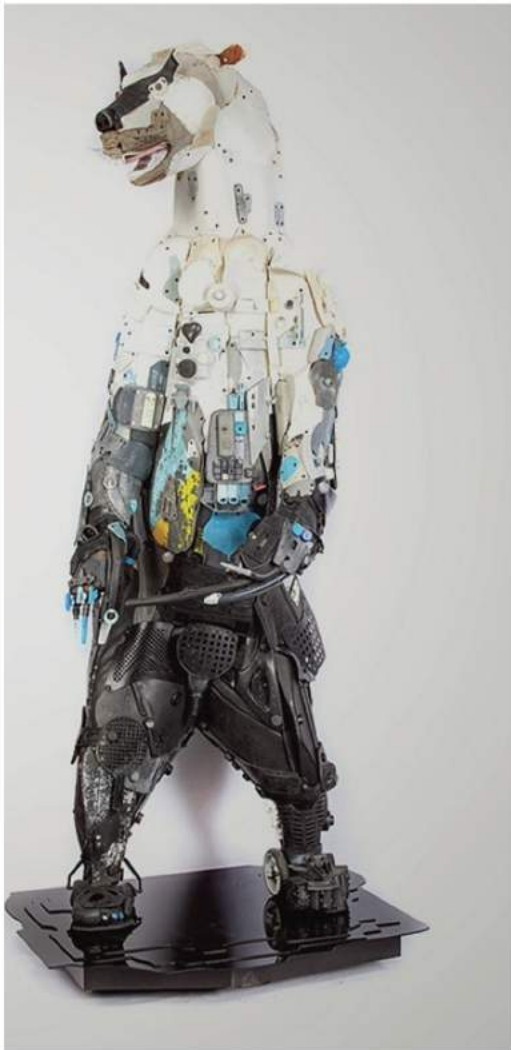
Gilles Cenazandotti "Polar Bear" Found Marine Plastic coated in Polyurethane 58 x 49 x 99 inches