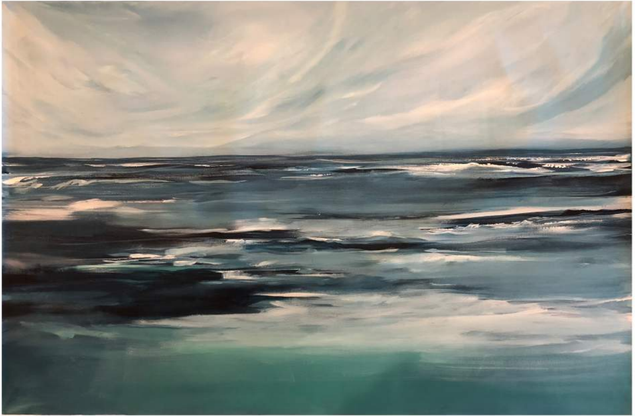
Megan Elizabeth "Turks and Caicos" Acrylic on Canvas 60 x 40 inches