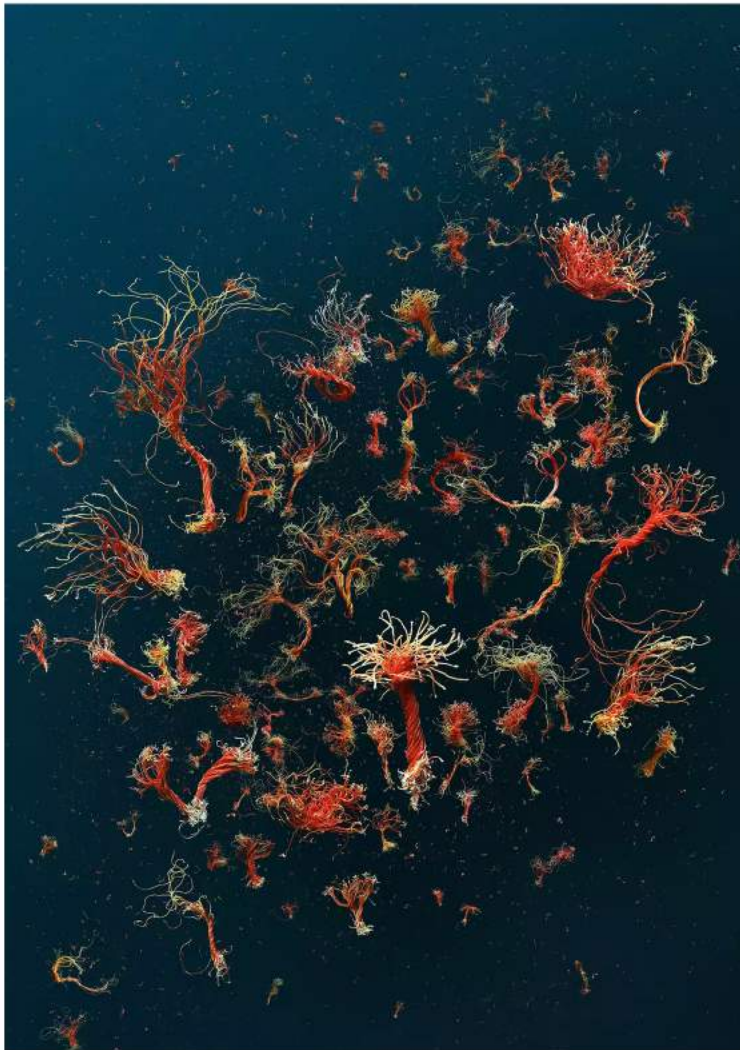
Mandy Barker "SHELF-LIFE" C-Tyle Photographic Print on Fuji Crystal Archival Matte Paper 28.7 x 40.7 inches