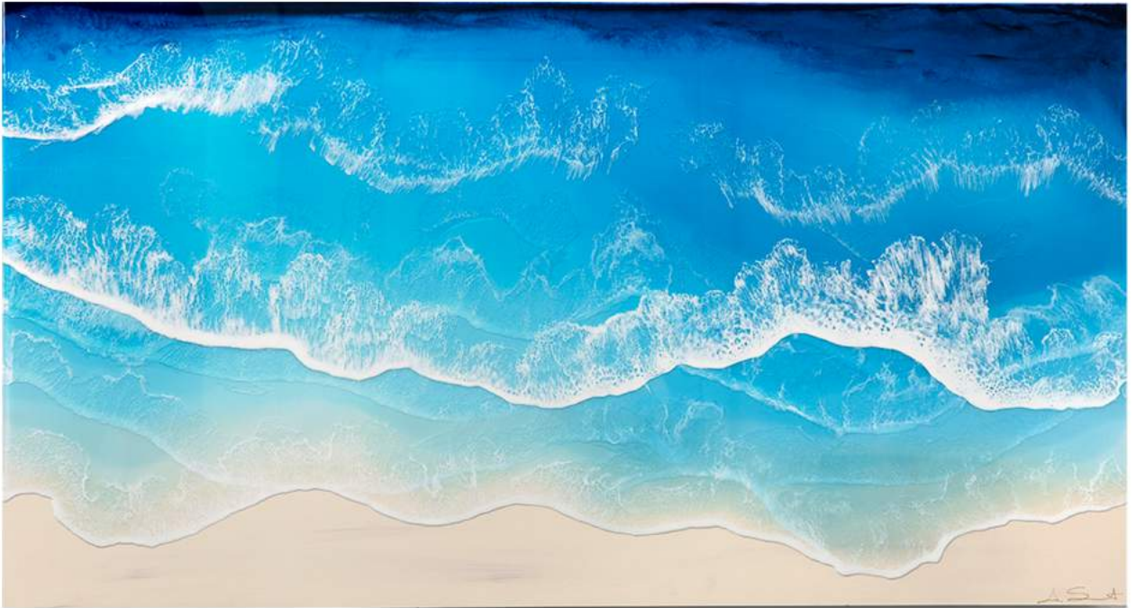
Anna Sweet "Swell" 2018 Resin on Wood 60 x 30 inches