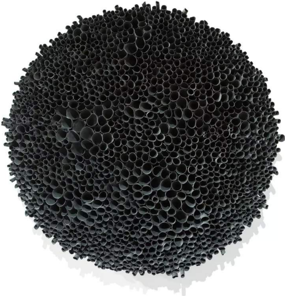
Valeria Nascimento "Coral Circle Black" Glazed Porcelain 19.5 x 19.5 inches