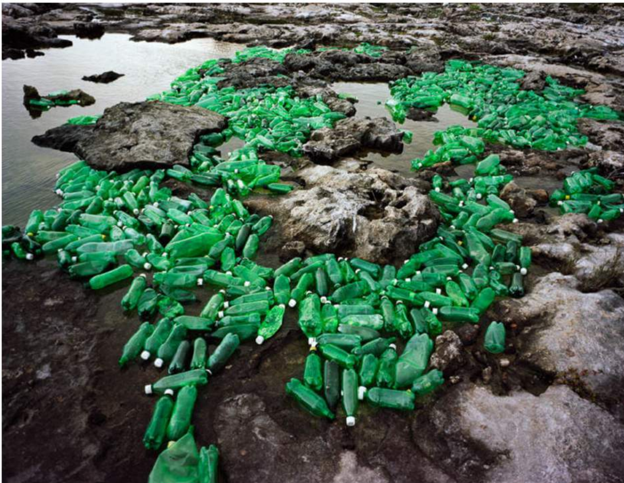
Alejandro Duran "Algas" Archival Pigment Print on Sintra 52 x 40 inches