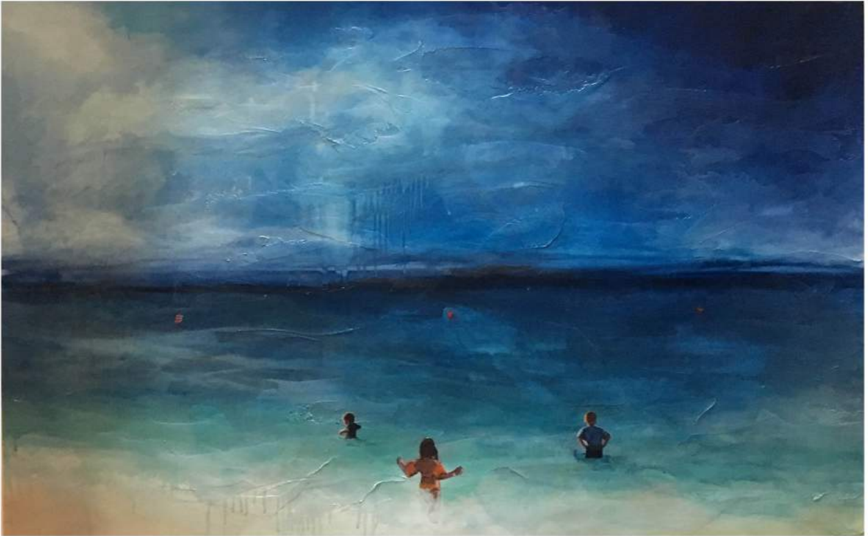
Peterson Guerrier "Enter in the Middle" Mixed Media on Canvas 61 x 40 inches