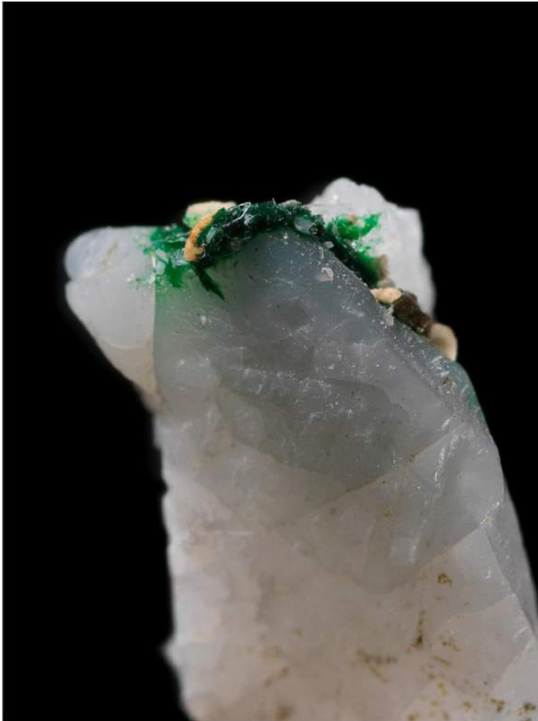
Evelyn Rydz "Floating Artifact #13" Photograph on Archival Paper