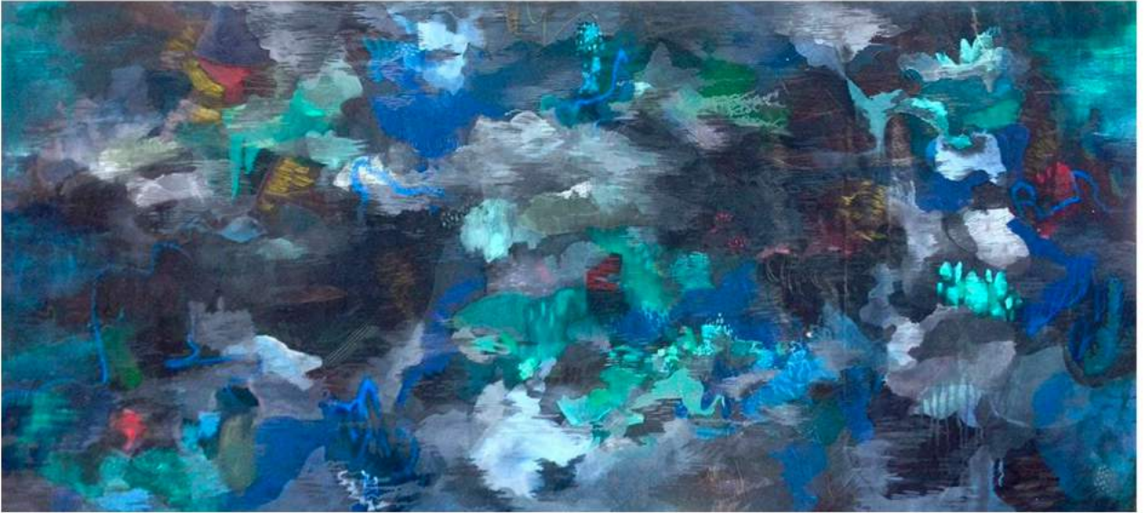
Justin Southey 'Adrift' Oil on Canvas 104 x 47.4 inches