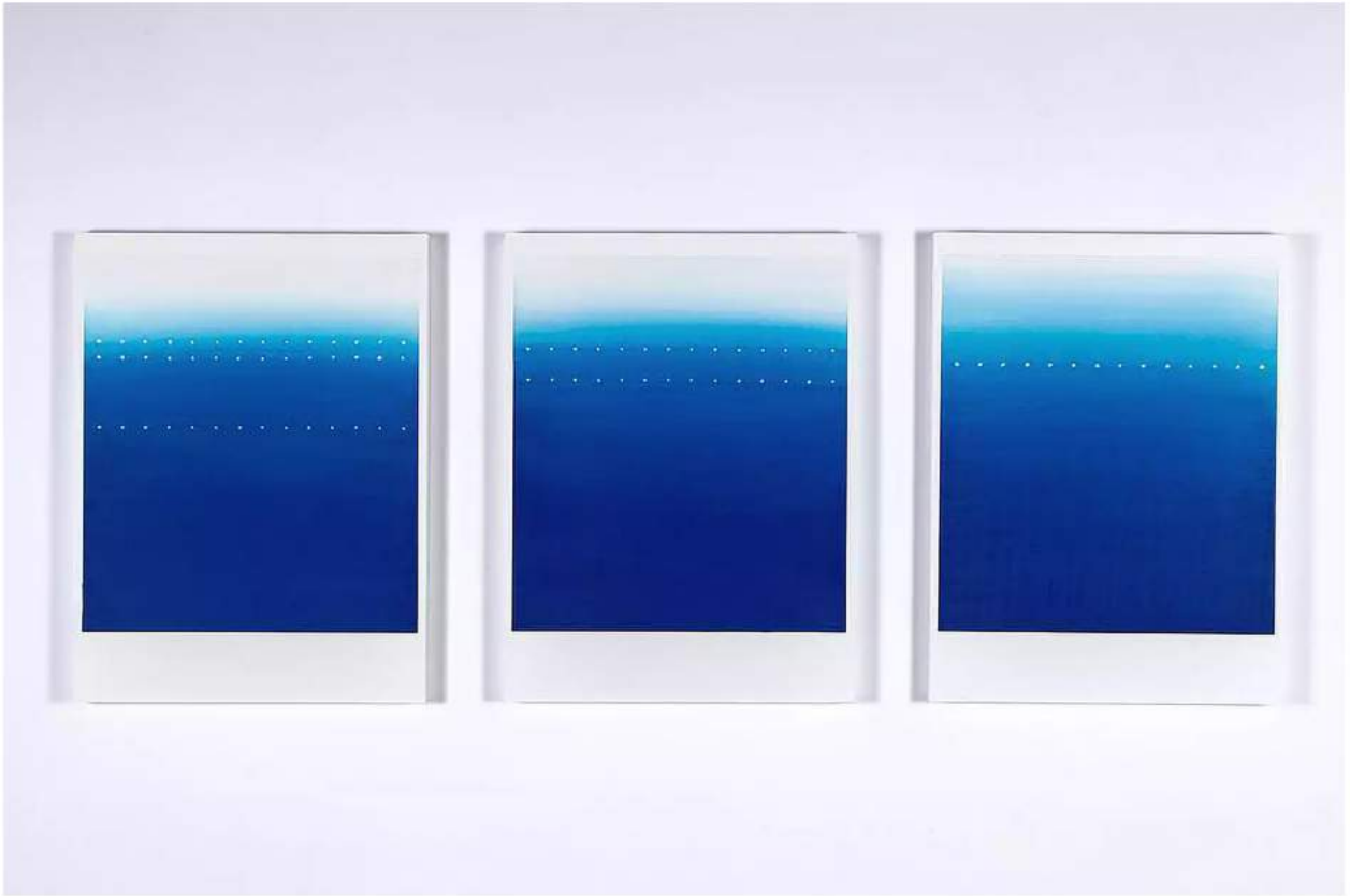
Katsumi Hayakawa 'Blue No. 1-3, 2017' Acrylic on Paper Mounted to Wood Panel 17.75 x 23.75 inches each