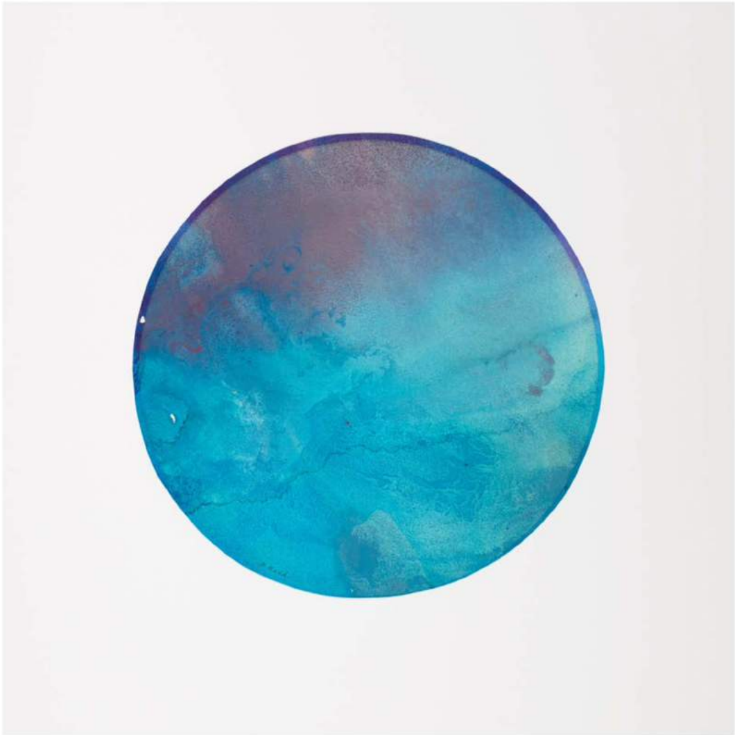
Dorothy Hood "Untitled" Watercolor on Paper 12.5 x 12.5 inches