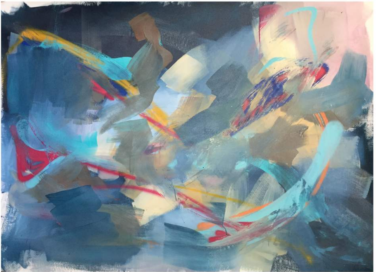
AXIOM Studio "Littered Ocean" Acrylic on Canvas 70 x 49 inches