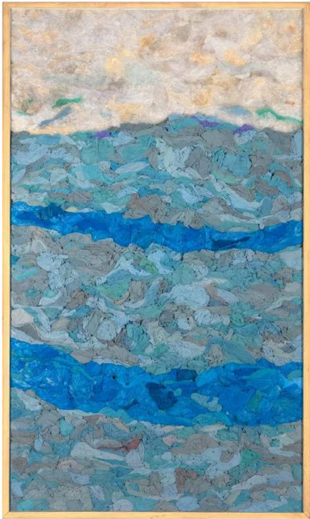
John Dahlsen "The Drowning River" Plastic Bags on Canvas 44.7 x 76.4 inches