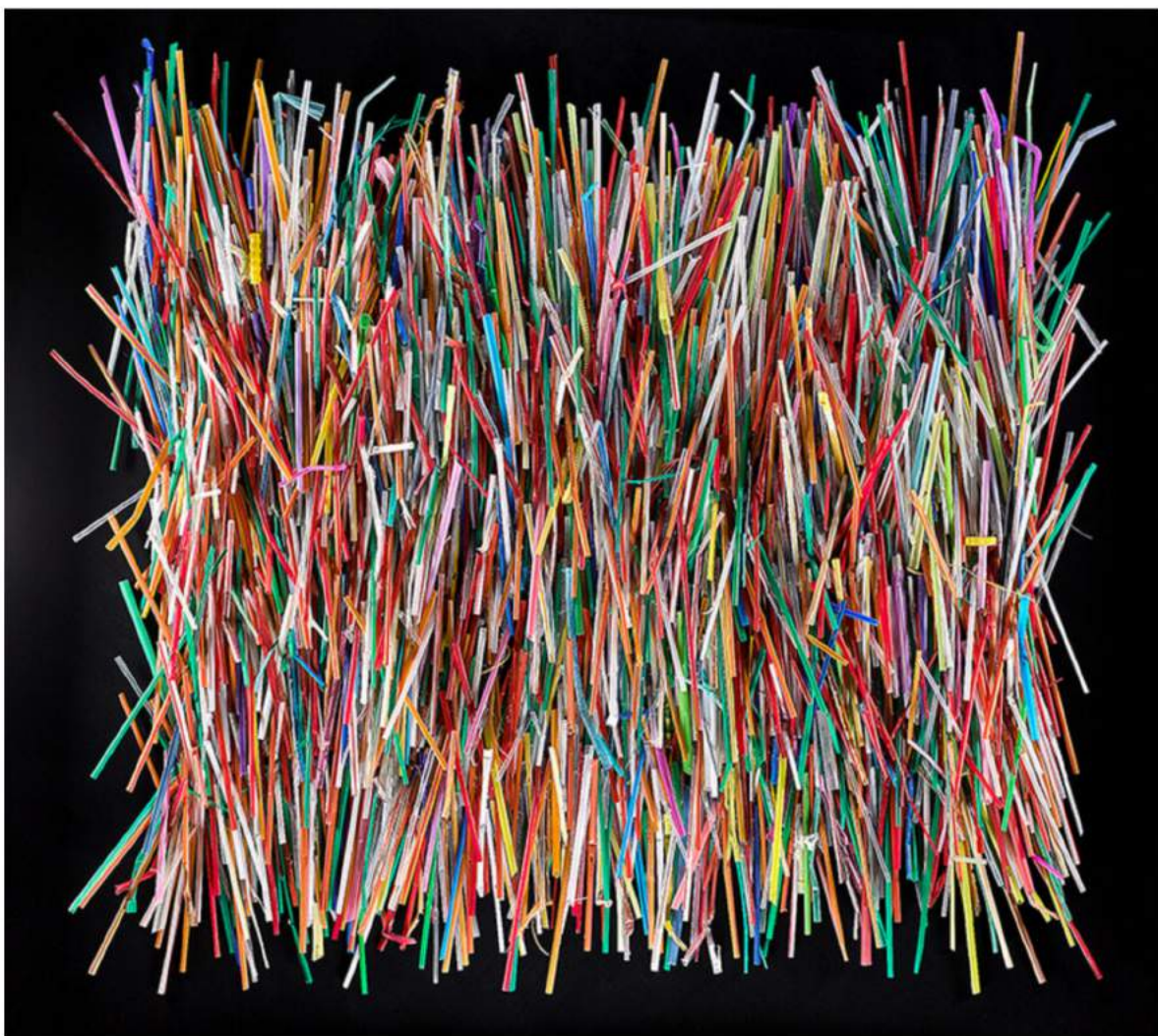
Barry Rosenthal "Pick up the Mantle" Straws from ocean beaches 48 x 48 inches