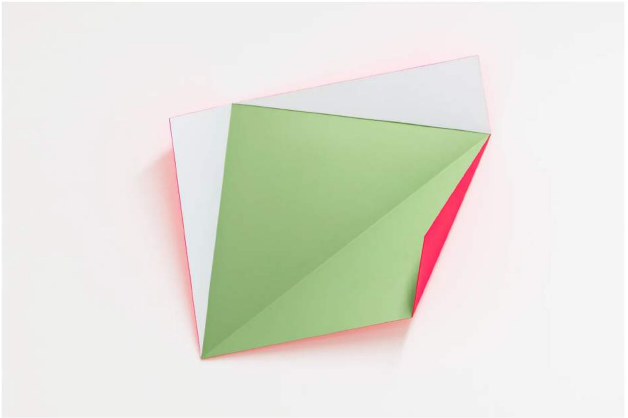
Rana Begum 'No 1291 S Fold' Lacquer on Mild Steel 26.4 x 22 x 8.7 inches / 67 x 56 x 22 cm