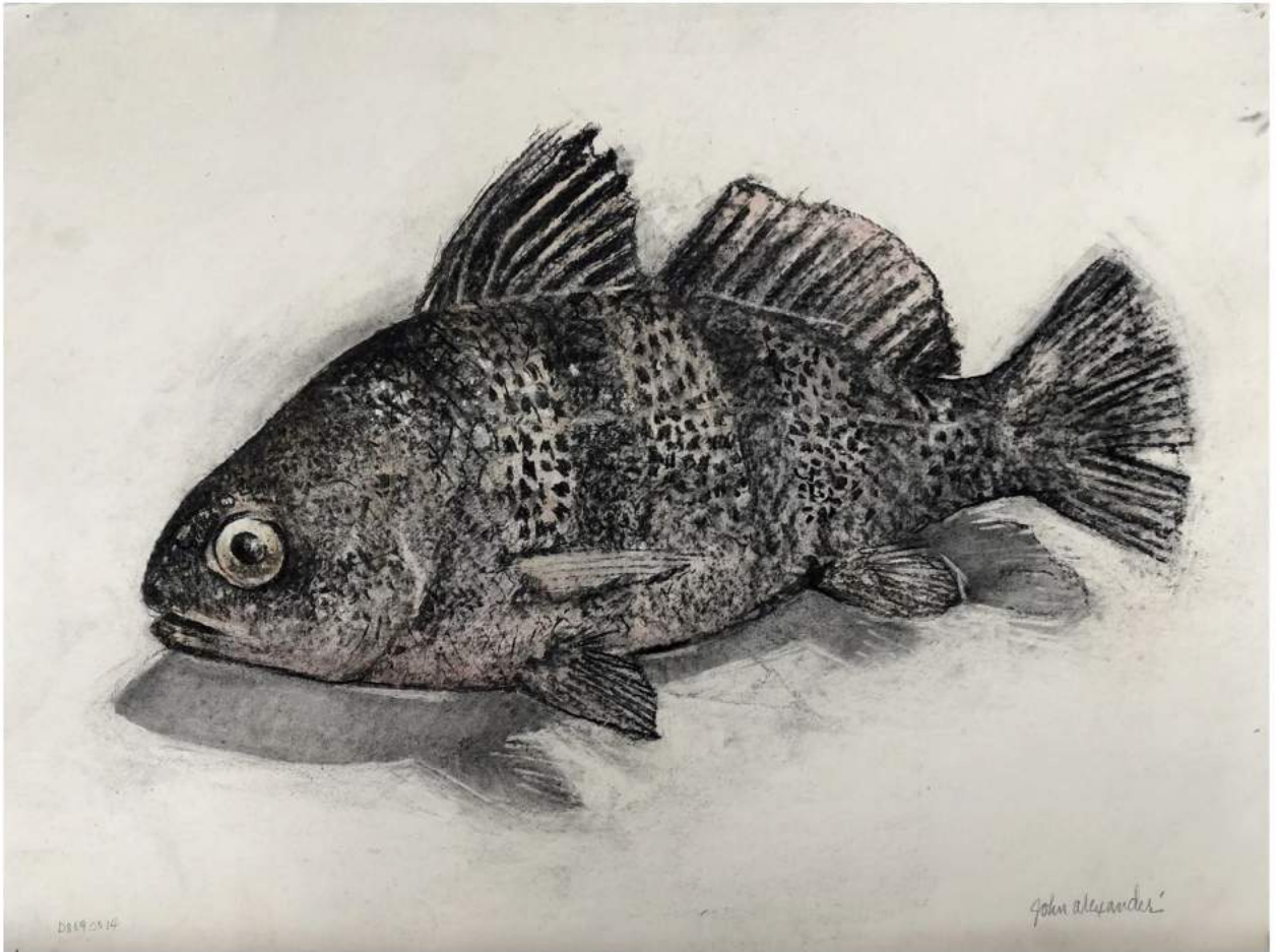
John Alexander 'Black Drum Fish' Charcoal & Watercolor on Paper 29.5 x 22 inches / 74.9 x 55.9 cm