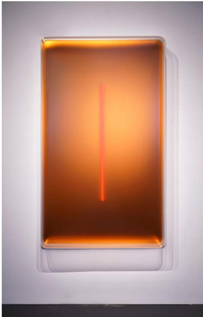
Casper Brindle 'Light Glyph' Pigmented Acrylic 74 x 44 x 12 inches / 188 x 111.8 x 30.5 cm