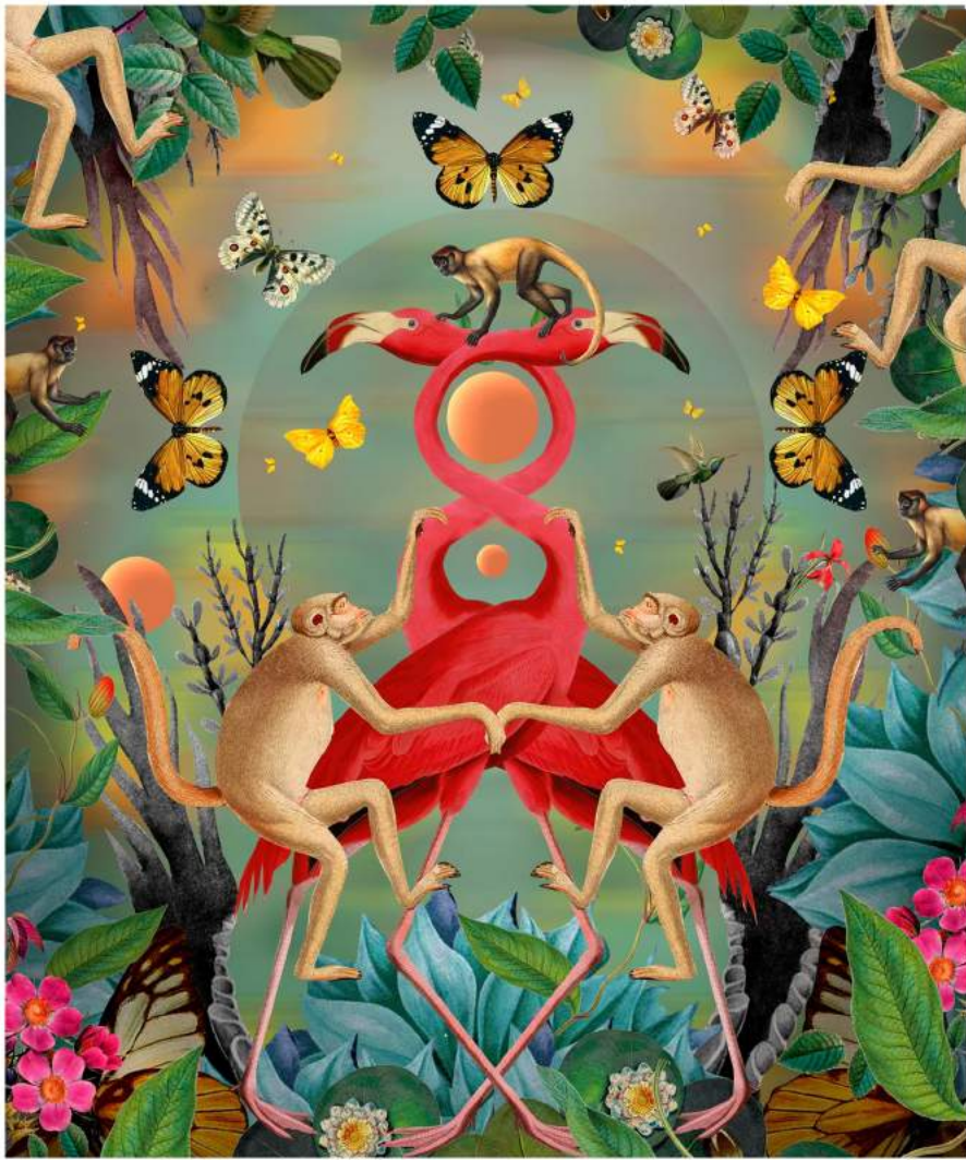
David Krovblit 'Monkey and the Birds' Collage & Resin on Wood 24 x 36 inches / 61 x 91.4 cm