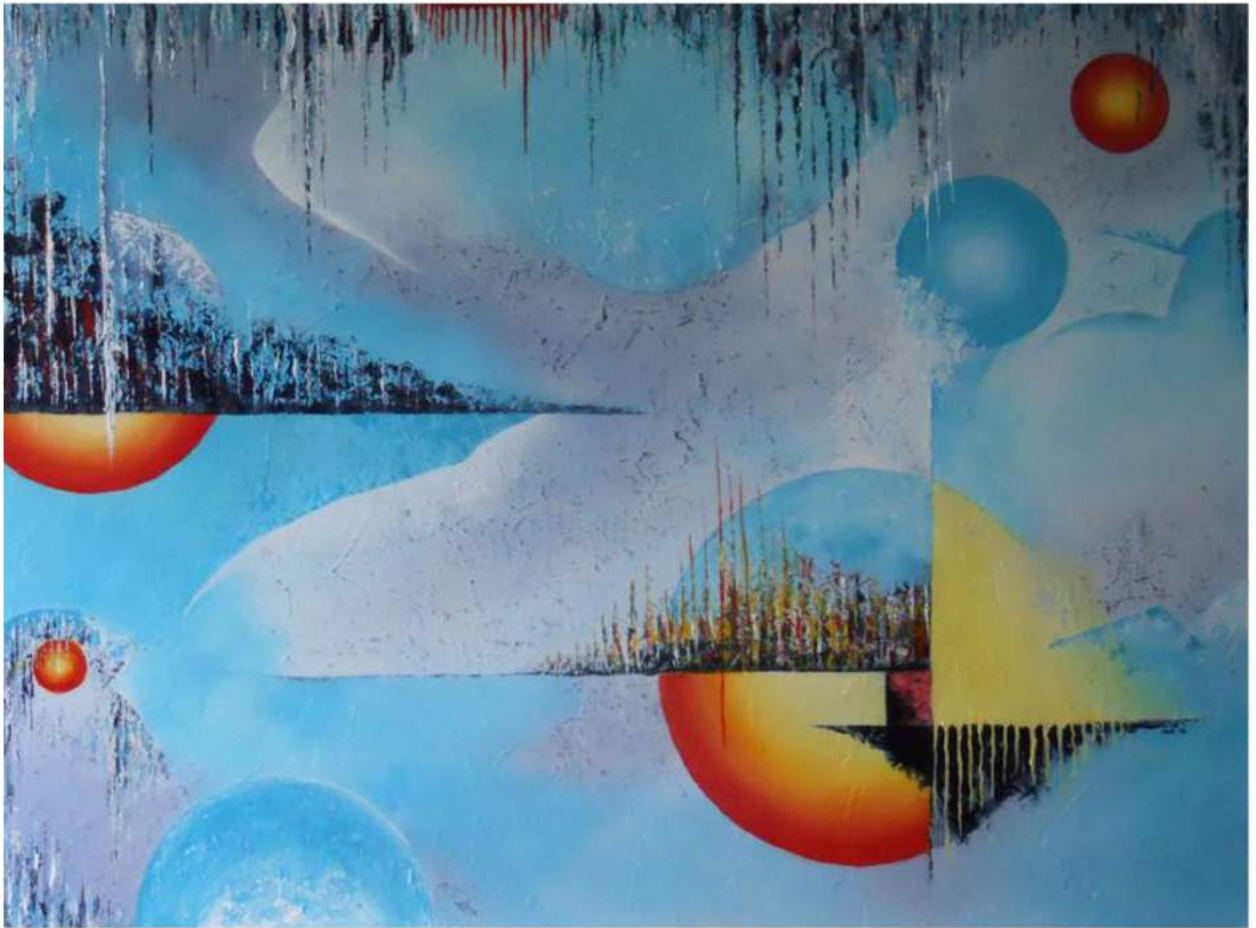
Ank Draijer 'Icarus #10' Acrylic on Canvas 48 x 36 inches / 121.9 x 91.4 cm