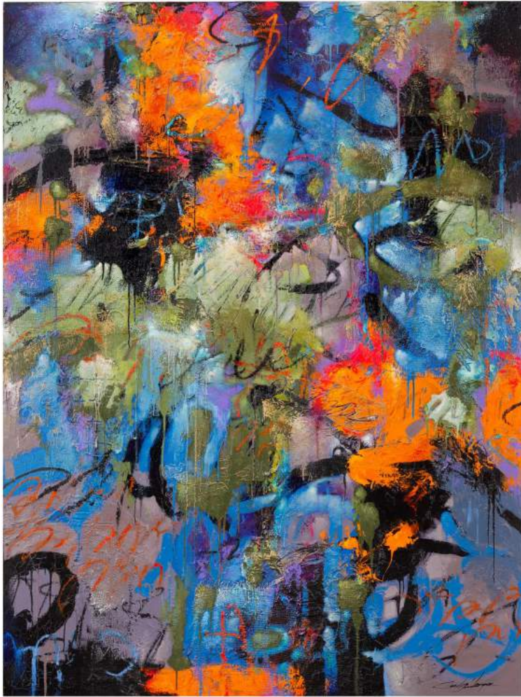
Cody Hooper 'Freedom Starts in the Mind' Acrylic on Wood 60 x 80 inches / 152.4 x 203.2 cm