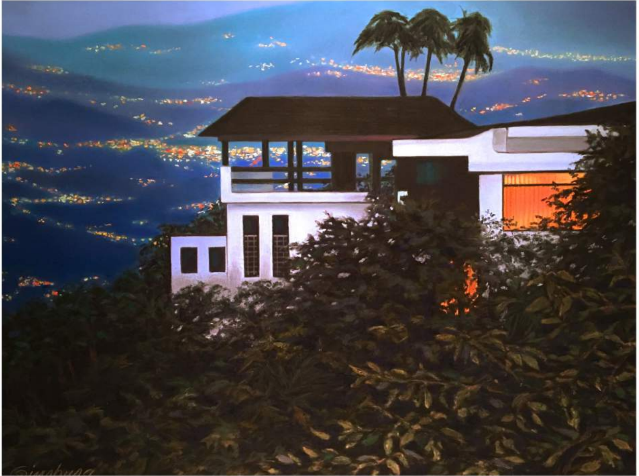
Cheri Ginsburg 'Night Falls in Costa Rica' PanPastel 24 x 18 inches / 61 x 45.7 cm