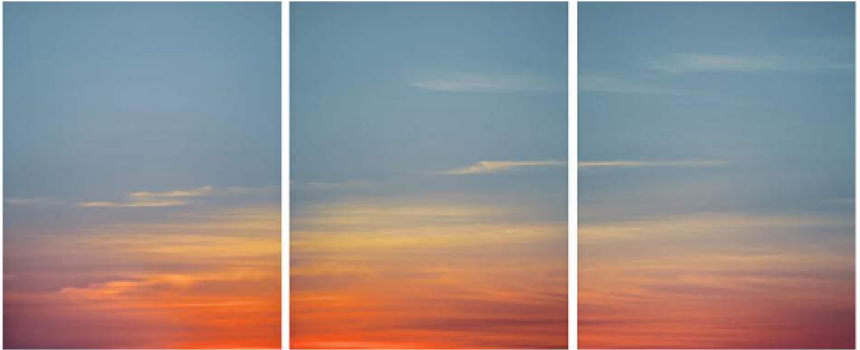
Eric Cahan 'Costa Rica' Chromogenic Print Edition of 5 40 x 50 inches each / 101.6 x 127 cm