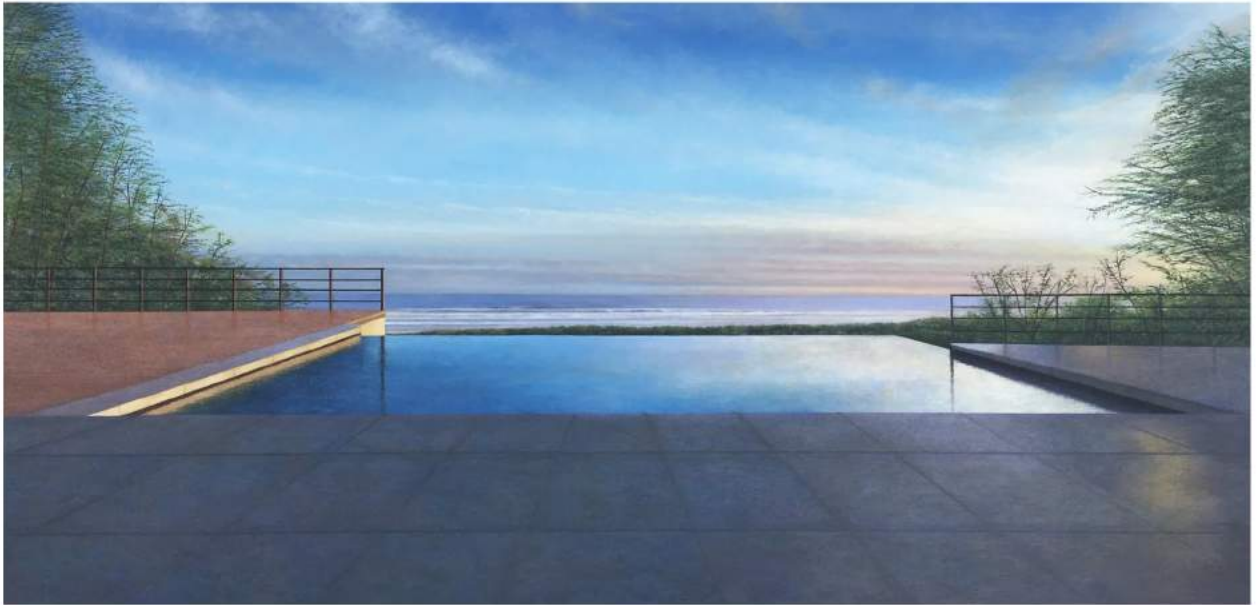
Timothy David Lang 'Drifting 8' Oil on Canvas 47.2 x 23.6 inches / 120 x 60 cm