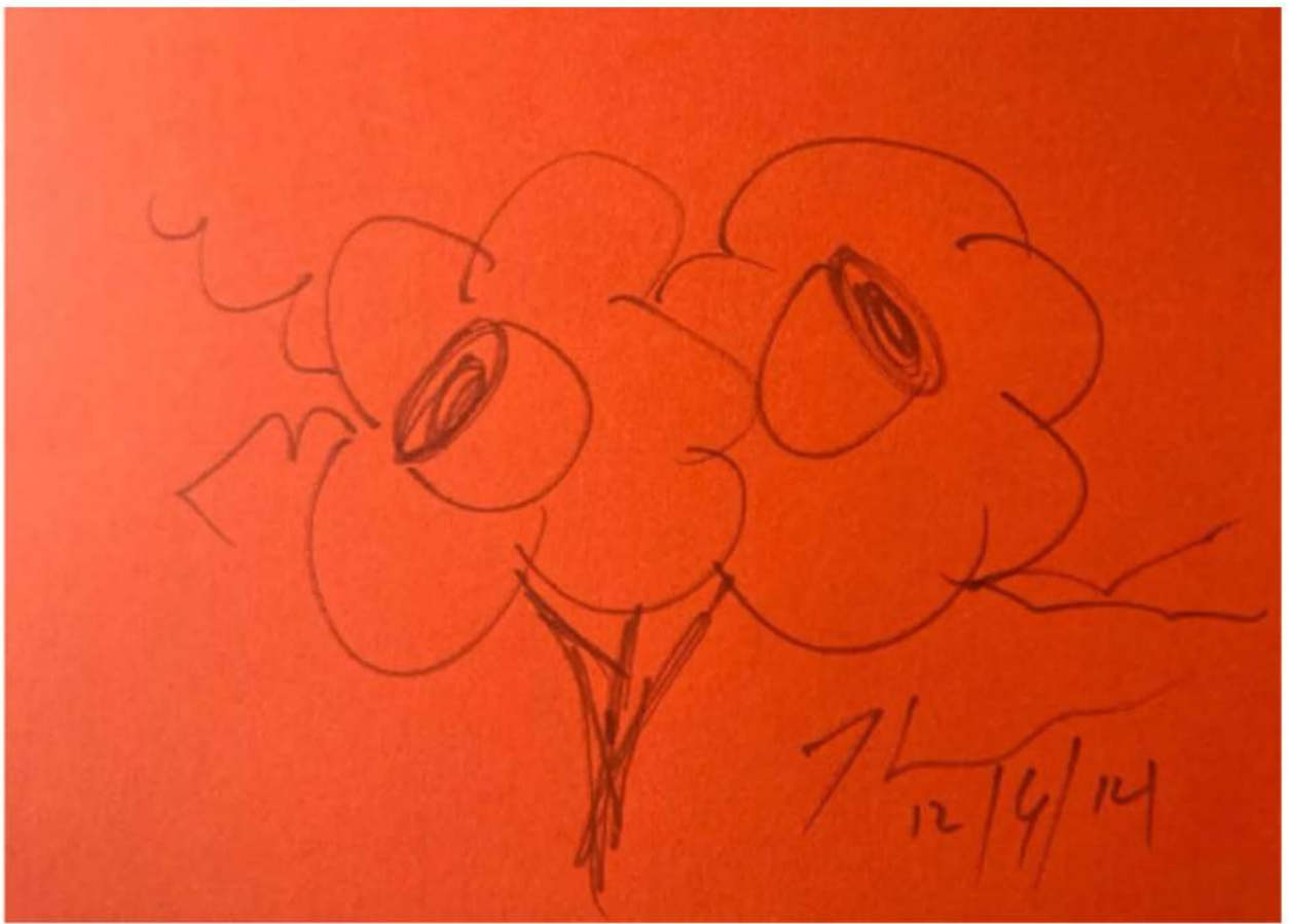
Jeff Koons 'Flowers' Black Marker on Paper 11.7 x 8.3 inches / 29.7 x 21 cm