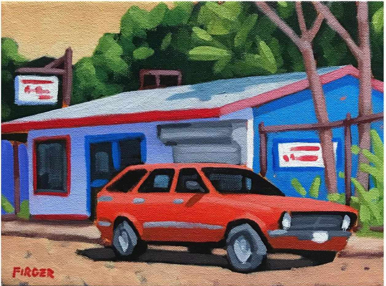
Chris Firger 'Mini Super' Acrylic on Canvas 15 x 12 inches / 38.1 x 30.5 cm