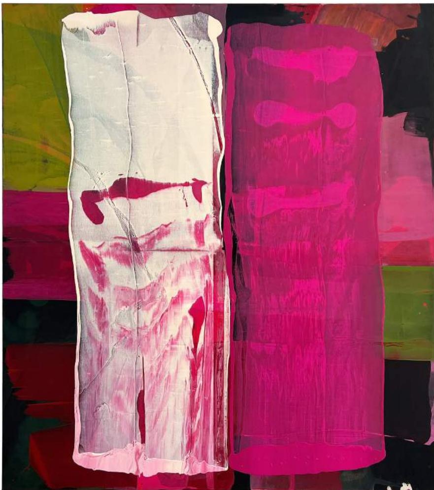
Kathryn MacNaughton 'Chemistry' Acrylic on Canvas 75 x 84 inches / 190.5 x 213.4 cm