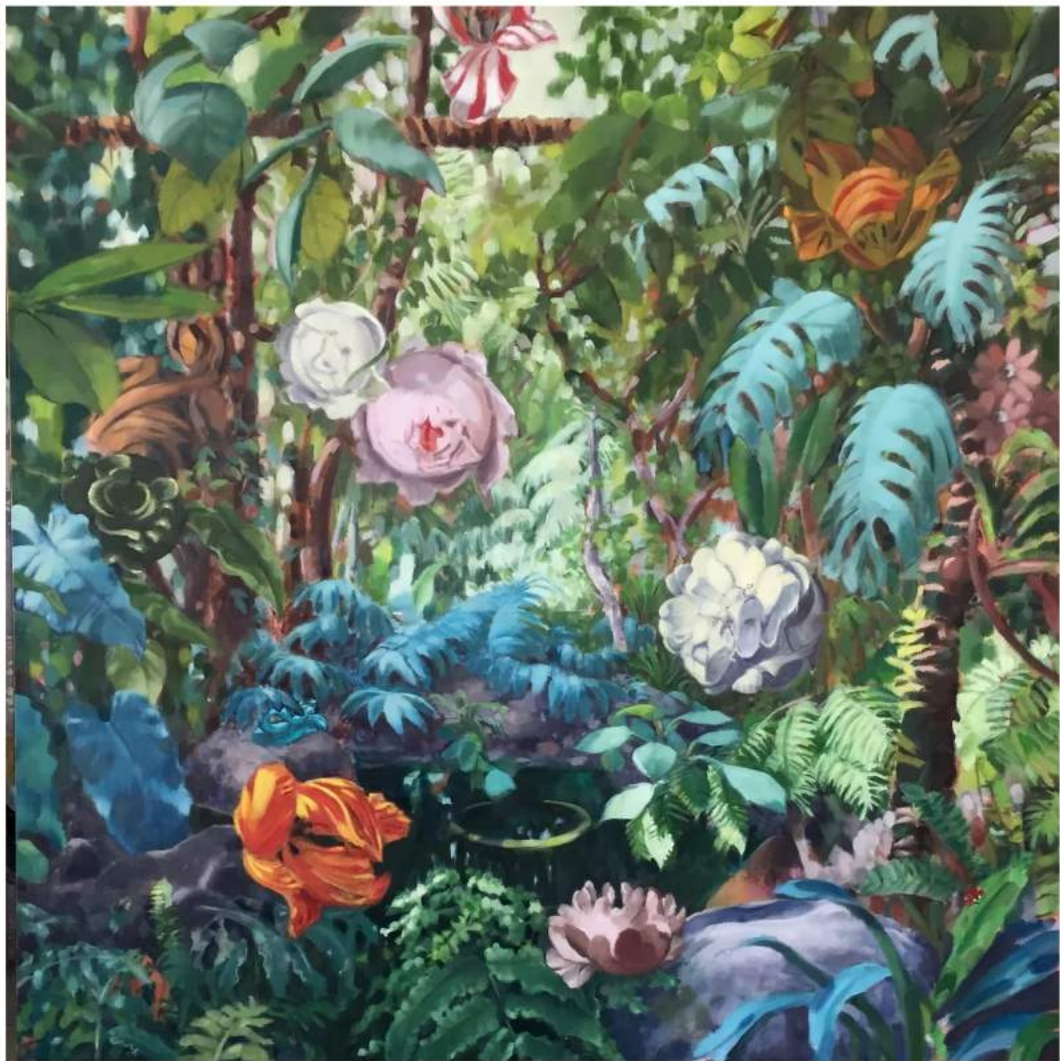
Stephanie Peek 'La Grande Serre II' Oil on Canvas 50 x 50 inches / 127 x 127 cm