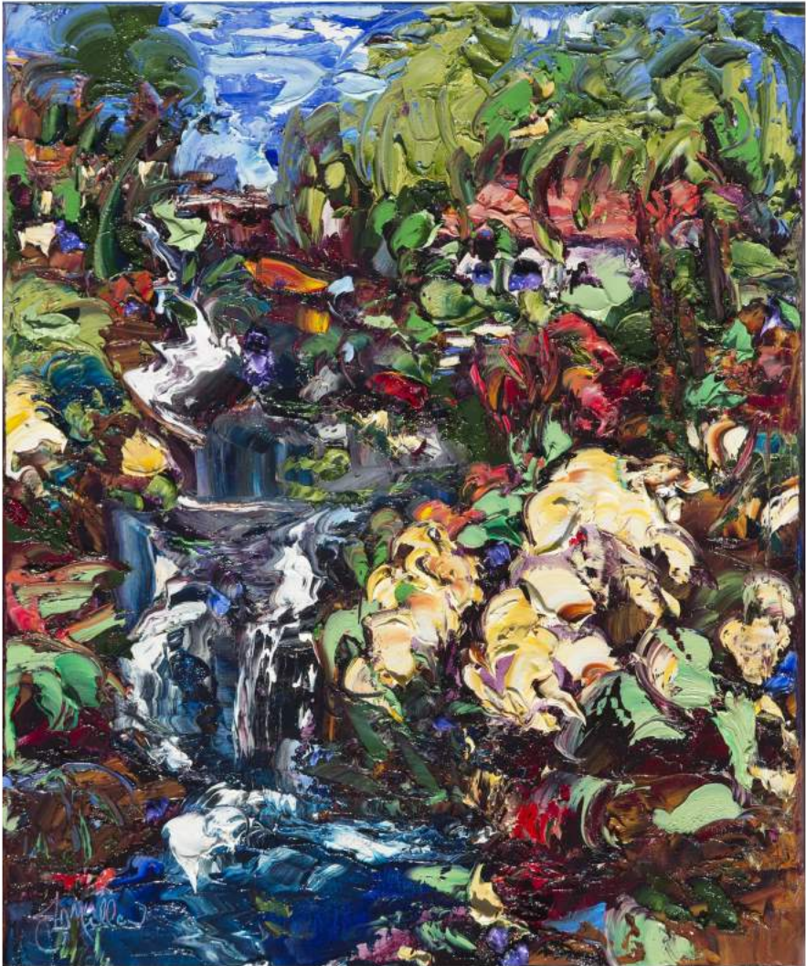
JD Miller 'Costa Rica Spring' Oil on Canvas 20 x 24 inches / 50.8 x 61 cm