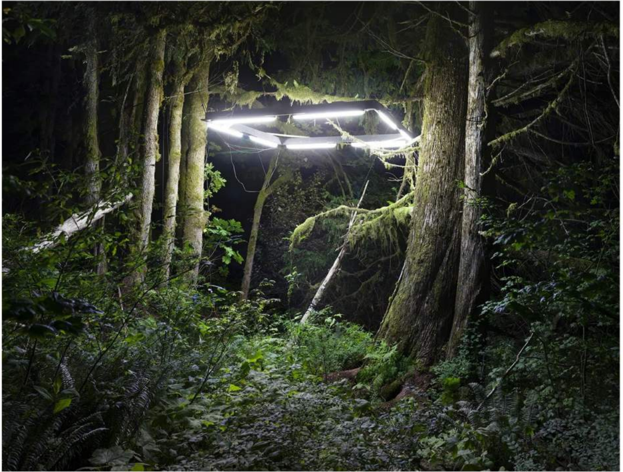
Chris Engman 'Shelter' Digital Pigment Print Edition of 6 + 2 AP 50 x 38 inches / 127 x 96.5 cm