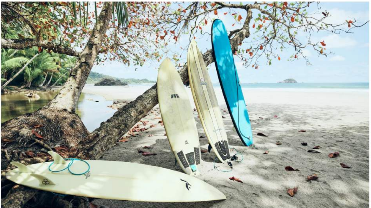
Jin-Woo Prensena 'Tuanis, Costa Rica' Archival Inkjet Edition of 10 55.9 x 31.5 inches / 142 x 80 cm