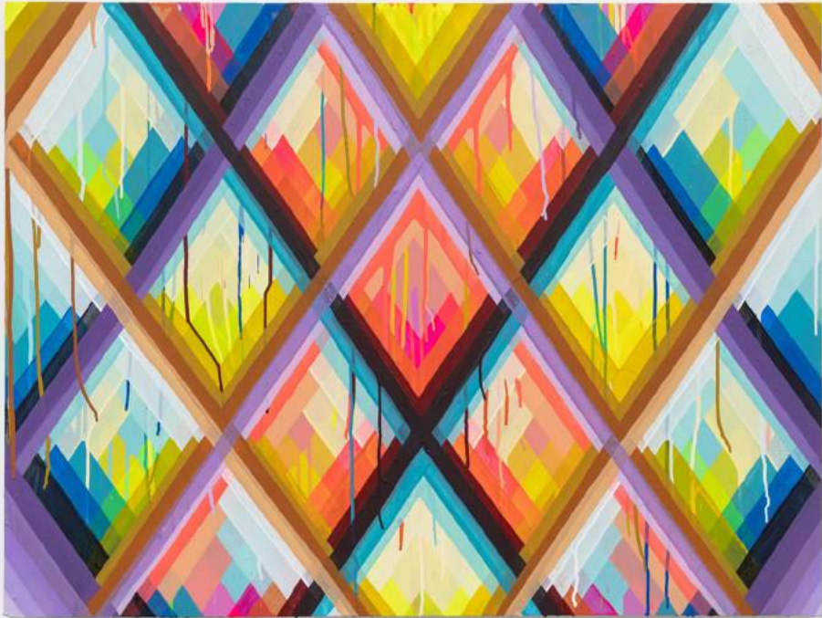
Maya Hayuk 'Untitled' Acrylic on Wood Panel 40.2 x 30.3 inches / 102 x 77 cm