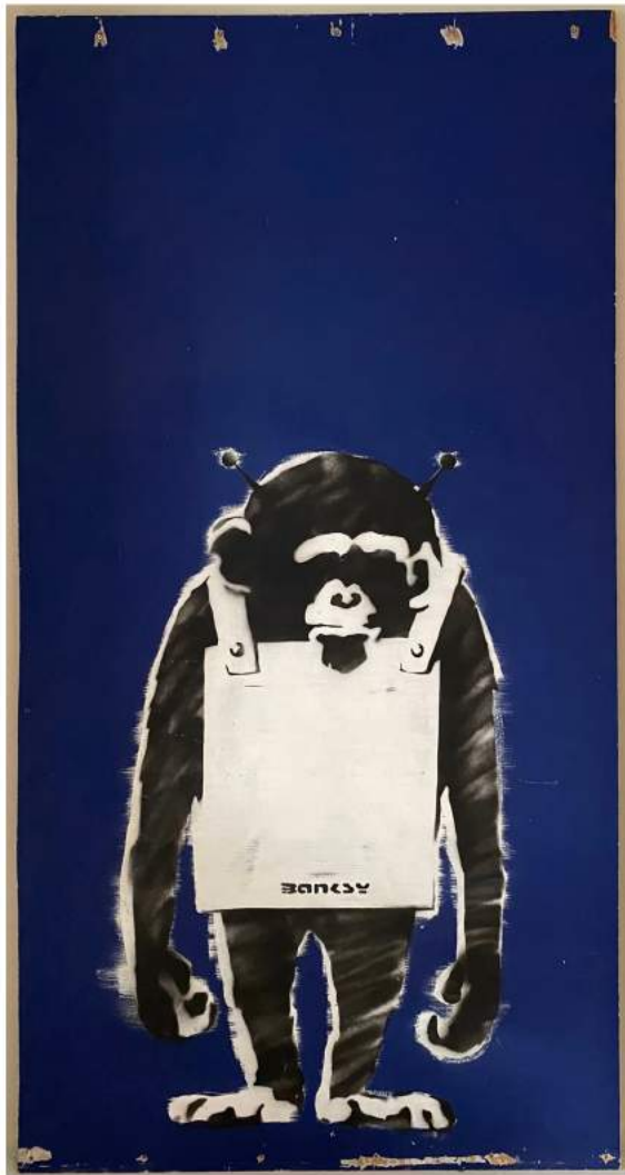
Banksy 'Laugh Now' Stencil Spray Paint on Wood Panel 39.4 x 78.7 inches / 100 x 200 cm