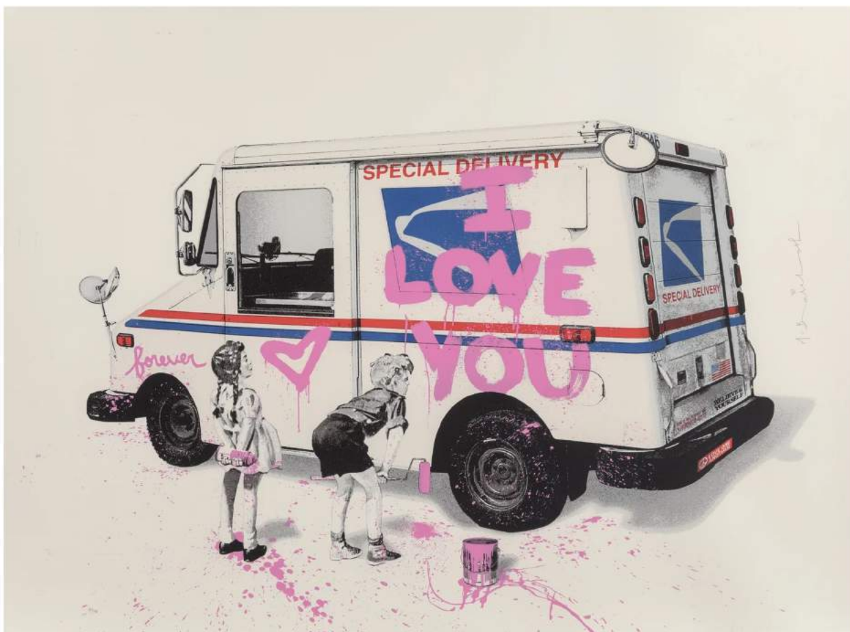
Mr Brainwash 'Special Delivery' Screenprint om Colors on Archival Paper 30.1 x 22.4 inches / 76.5 x 56.9 cm