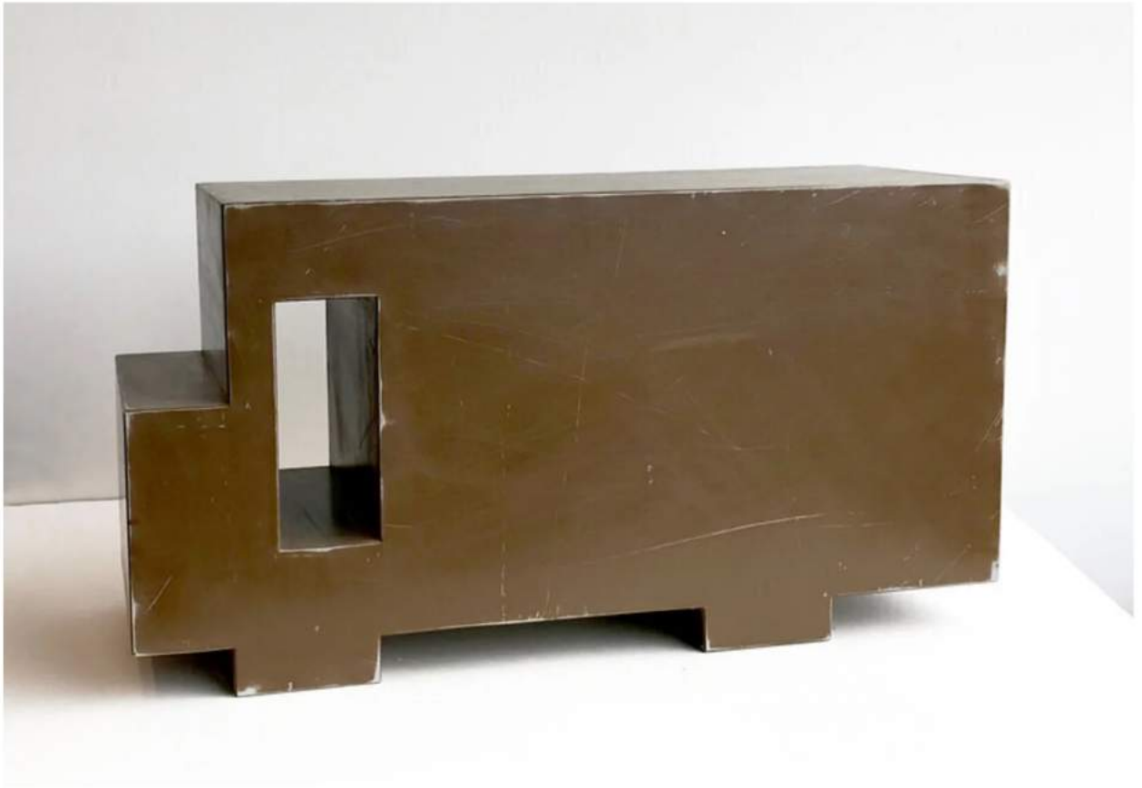
Mike Whiting 'Delivery Truck' Automotive Paint on Fabricated Steel 10 x 19 x 7 inches / 25.4 x 48.3 x 17.8 cm