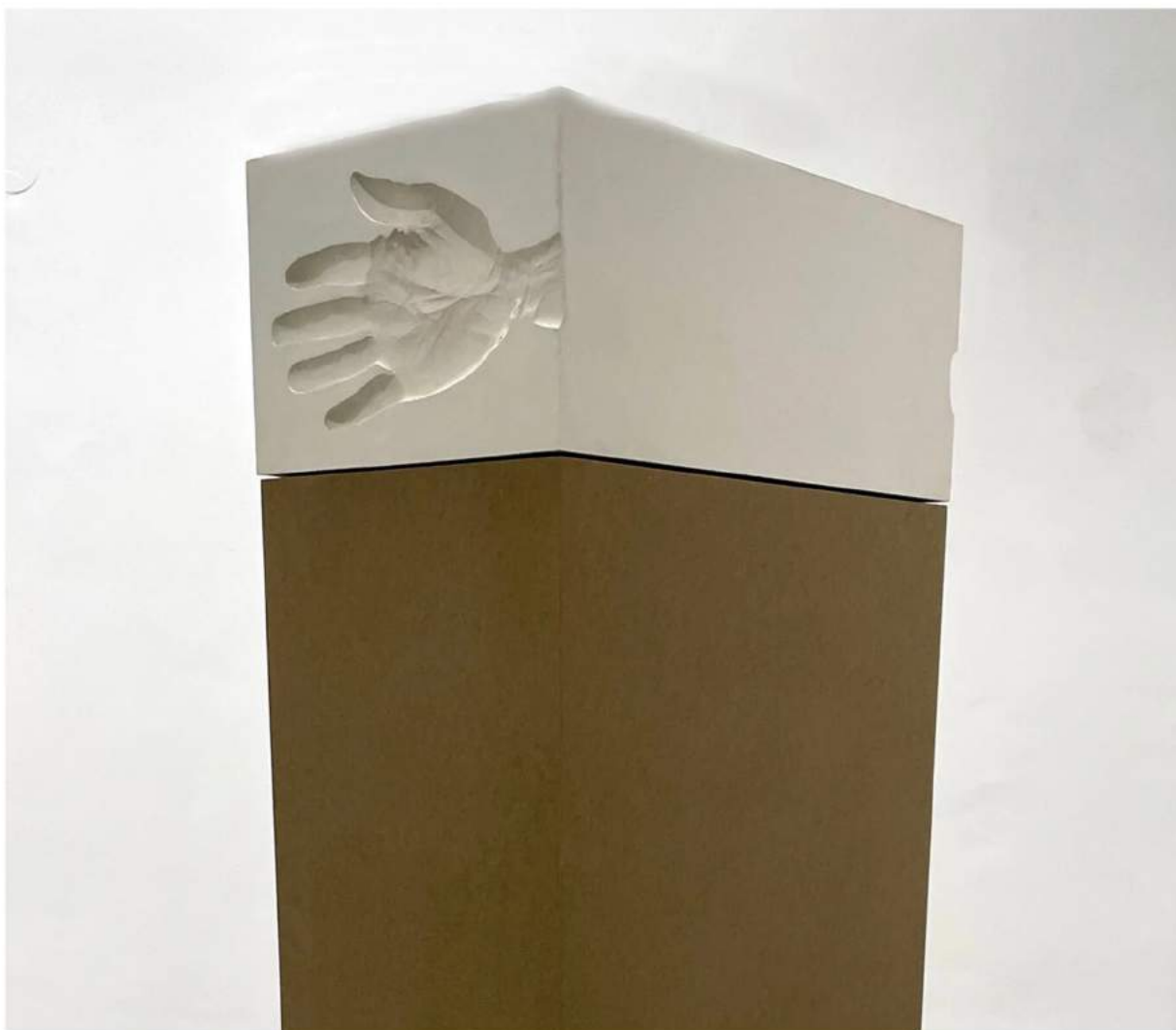
Giovanni Morbin 'Manomissore' Alabasta Plaster & Wood 6.7 x 9.4 x 15.7 inches / 17 x 24 x 40 cm