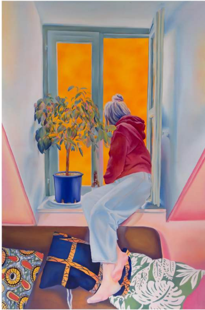
Emile Orange 'Femme a la Fenetre' Oil on Canvas 39.4 x 59.1 inches / 100 x 150 cm