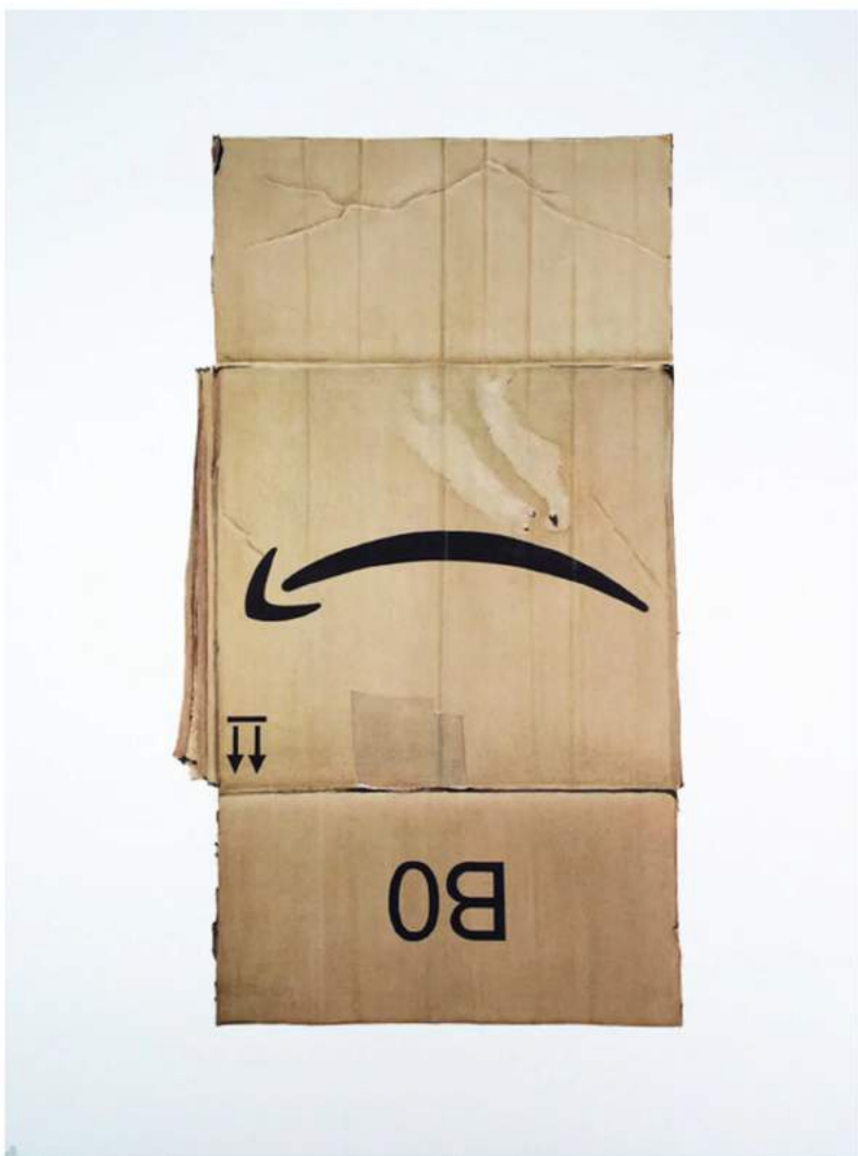
Timothy Wells 'Two Hour Delivery, 125 Powell' Watercolor & Gouache on Paper 24 x 32 inches / 61 x 81.3 cm