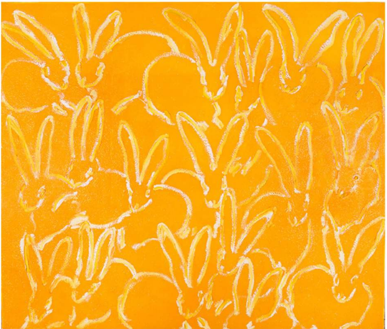
Hunt Slonem 'Untitled CRK00095' Oil & Acrylic with Diamond Dust on Canvas 70 x 60 inches / 177.8 x 152.4 cm