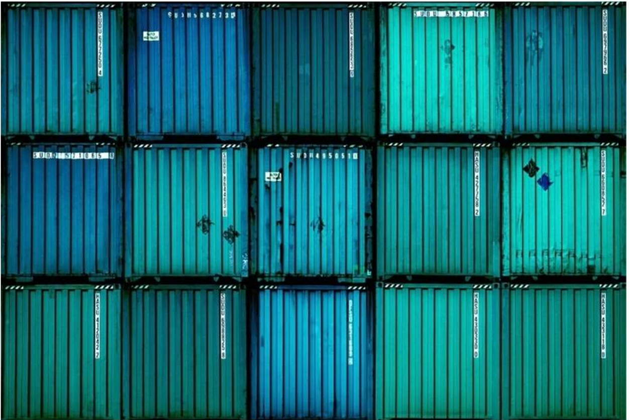
Nicolas Ruel 'Overseas' Photograph printed on Stainless Steel 90 x 60 inches / 228.6 x 152.4 cm