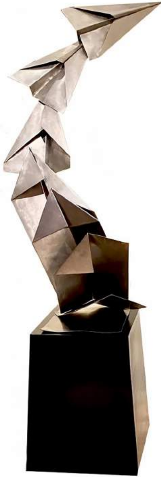
Kevin Box 'Unfolding the Magic' Bronze, Steel & Stone 29 x 30 x 50 inches / 73.7 x 76.2 x 127 cm