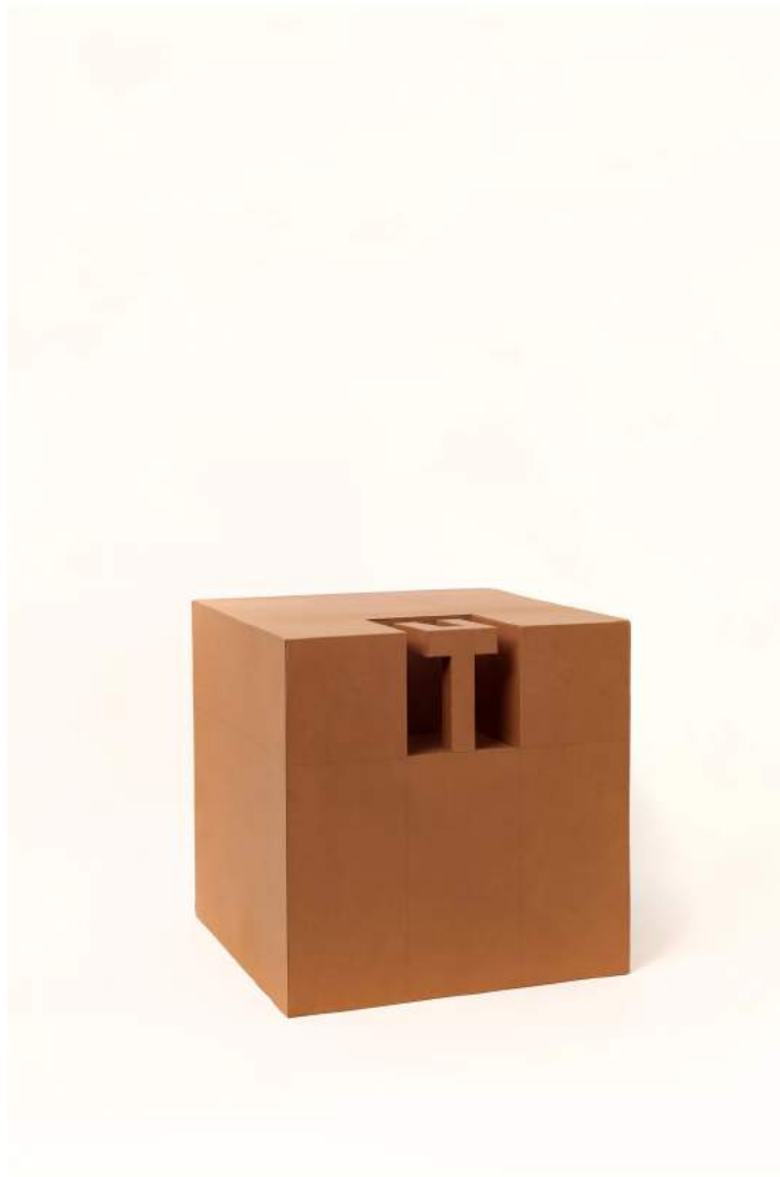
Erwin Heerich 'Cardboard Sculpture' Cardboard & Pencil 17.9 x 17.7 x 17.7 inches / 45.5 x 45 x 45 cm