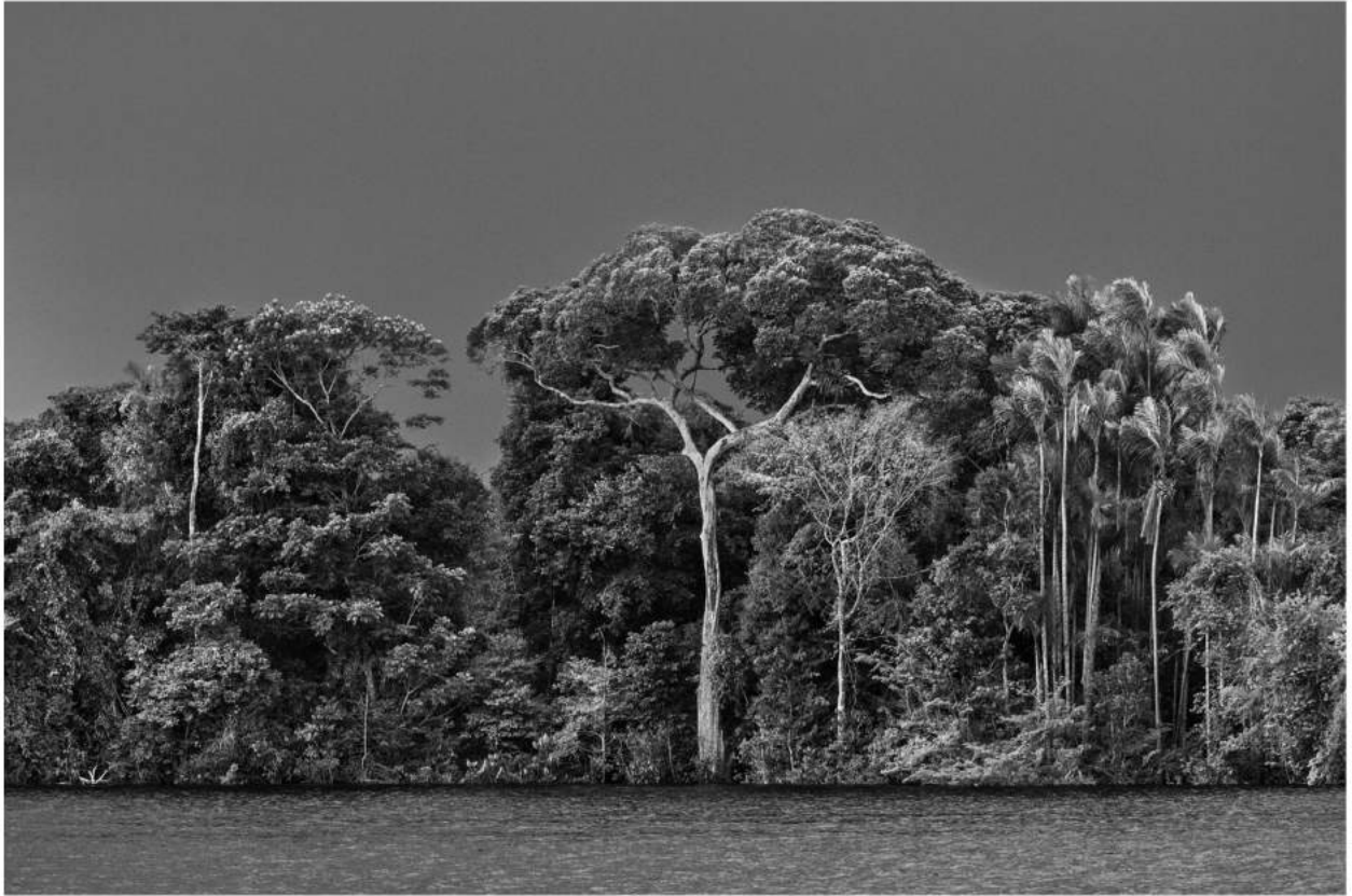
Sebastiao Salgado 'Anavilhanas National Park' Silver Gelatin Print 35 x 24 inches / 88.9 x 61 cm