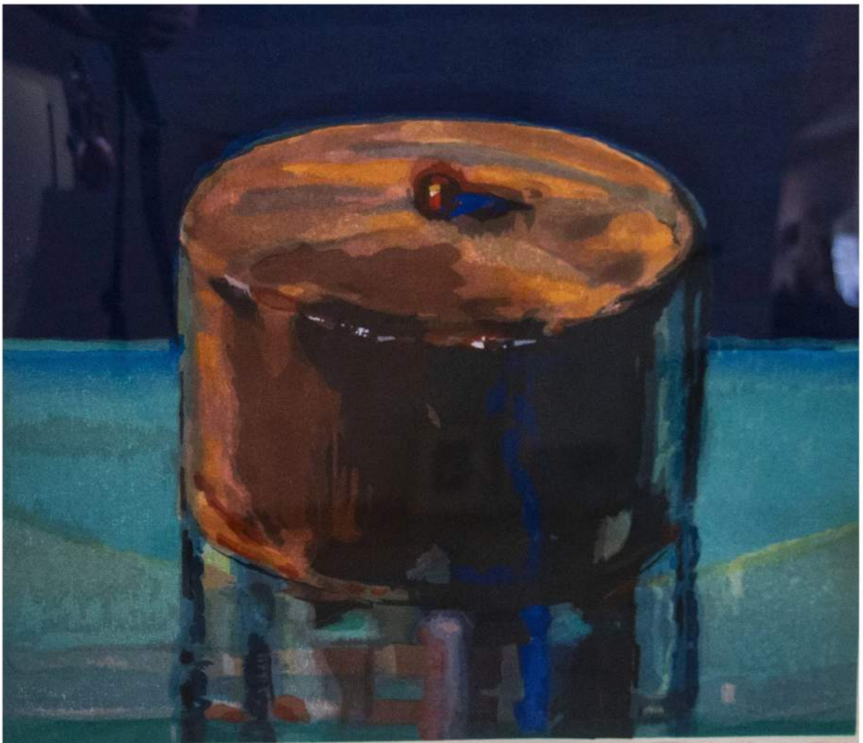
Wayne Thiebaud 'Dark Cake' Color Woodcut Limited Edition of 200 17.5 x 15 inches / 44.5 x 38.1 cm