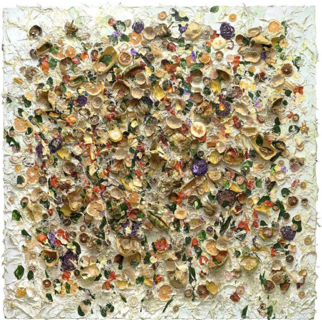
Susan Swartz 'Evolution of Nature 21' Acrylic on Linen, Mixed Media 72 x 72 inches / 182.9 x 182.9 cm