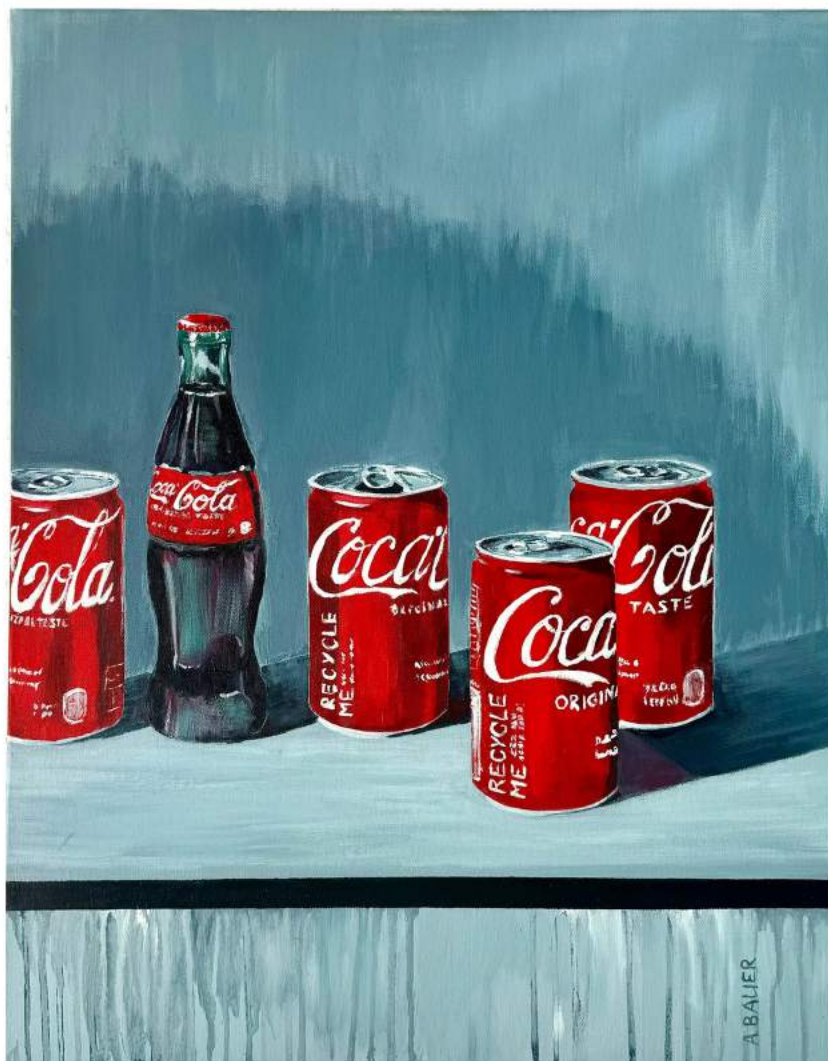
Alina Bauer 'A Different Red' Acrylic on paper 24 x 30 inches / 61 x 76.2 cm