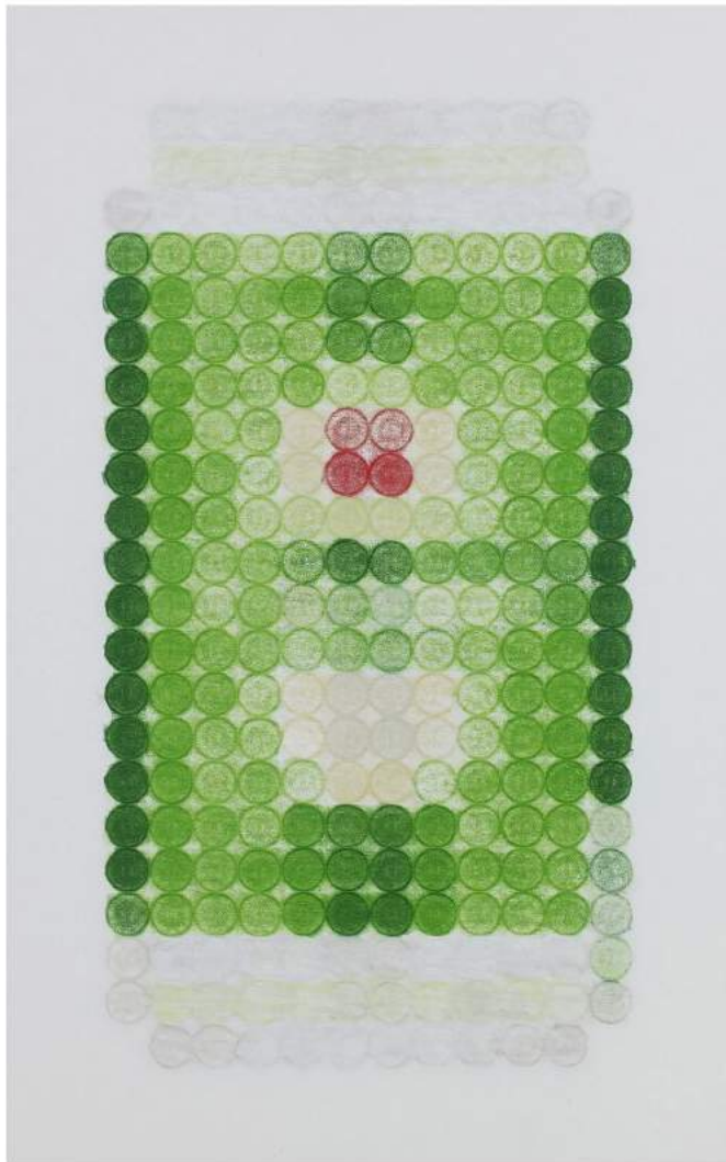
Yukyo Yamamoto 'A Can of Beer of 258 Yen (Heineken)' Colored Pencil on Manila Paper, One Yen Coins 33.3 x 53 inches / 84.6 x 134.6 cm