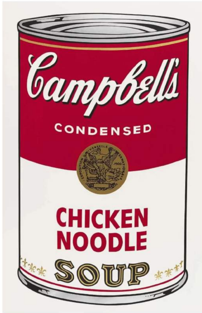
Andy Warhol 'Campbell's Soup I: Chicken Noodle' Screenprint on Paper Edition of 250 23 x 35 inches / 58.4 x 88.9 cm