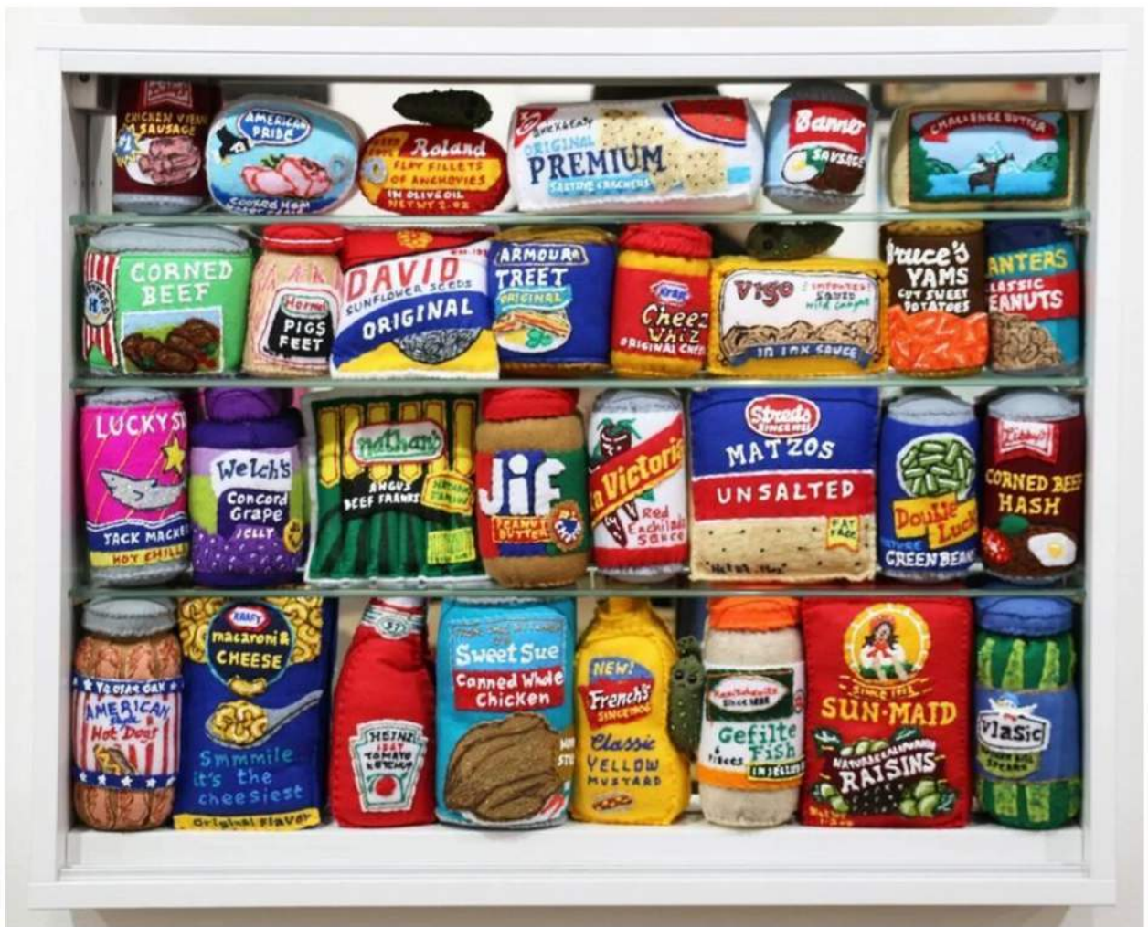
Lucy Sparrow 'Such a Sad Time' Felt Limited Edition of 50 30.3 x 23.6 inches / 77 x 60 cm