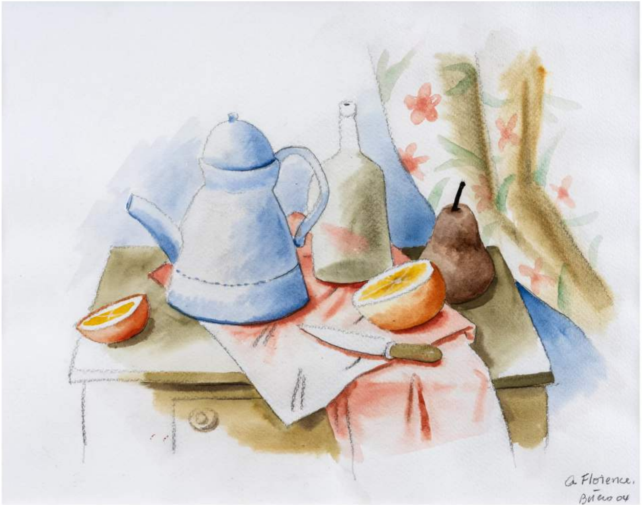
Fernando Botero 'Still Life' Watercolor on Paper 15.2 x 12 inches / 38.7 x 30.5 cm