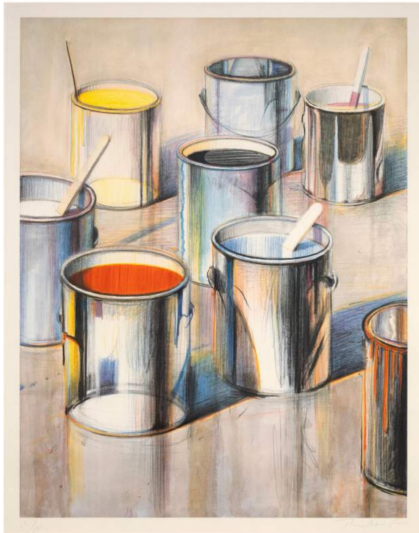
Wayne Thiebaud 'Paint Cans' Lithograph in Color on Wove Paper Limited Edition of 100 29 x 38.75 inches / 74 x 98.4 cm