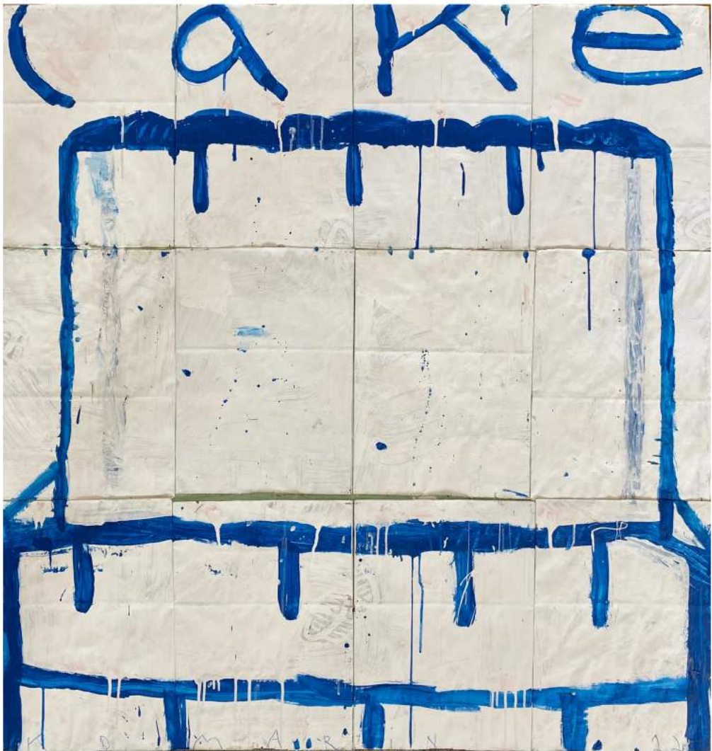
Gary Komarin 'Cake Stacked, Blue on Creme and White' Mixed Media on Paper Bags 47.25 x 50.5 inches / 120 x 128.3 cm