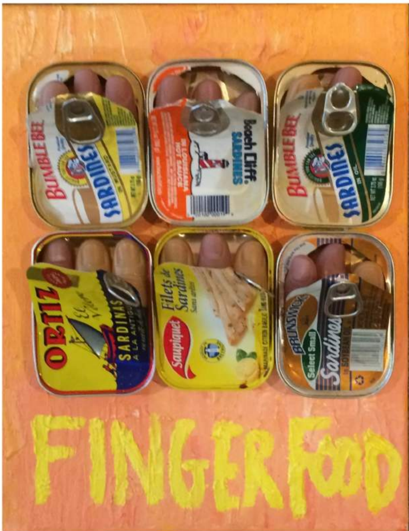
Kalle Levon 'Finger Food O' Oil & Synthetic Material 11 x 14 inches / 27.9 x 35.6 cm