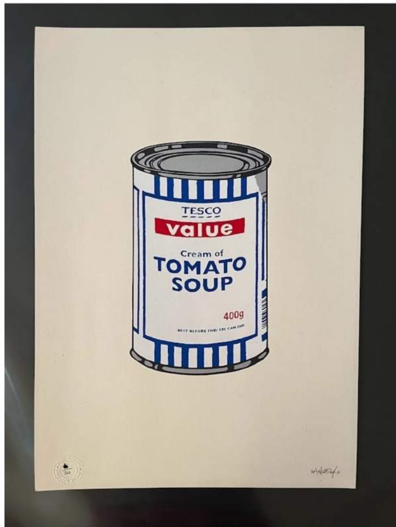
Banksy 'Soup Can' Screenprint on Paper Edition of 50 13.8 x 19.7 inches / 35 x 50 cm