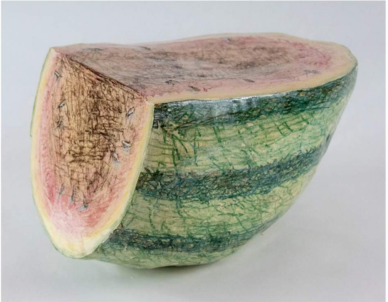
Reniel Del Rosario 'Dehydrated and Preserved Watermelon' Ceramic 12 x 7 x 8 inches / 30.5 x 17.8 x 20.3 cm