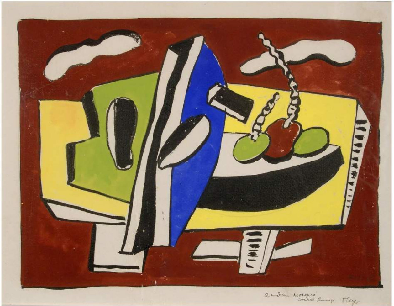
Fernand Leger 'Nature Morte Jaune et Bleue (Still life, yellow and blue)' Gouache & Ink on Paper 11.2 x 8.3 inches / 28.5 x 21.2 cm