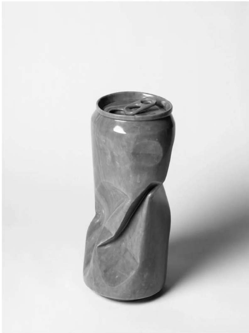
Claudia Comte 'The Marble Can' Grey Bardiglio Marble 8.1 x 17.2 inches / 20.7 x 43.8 cm