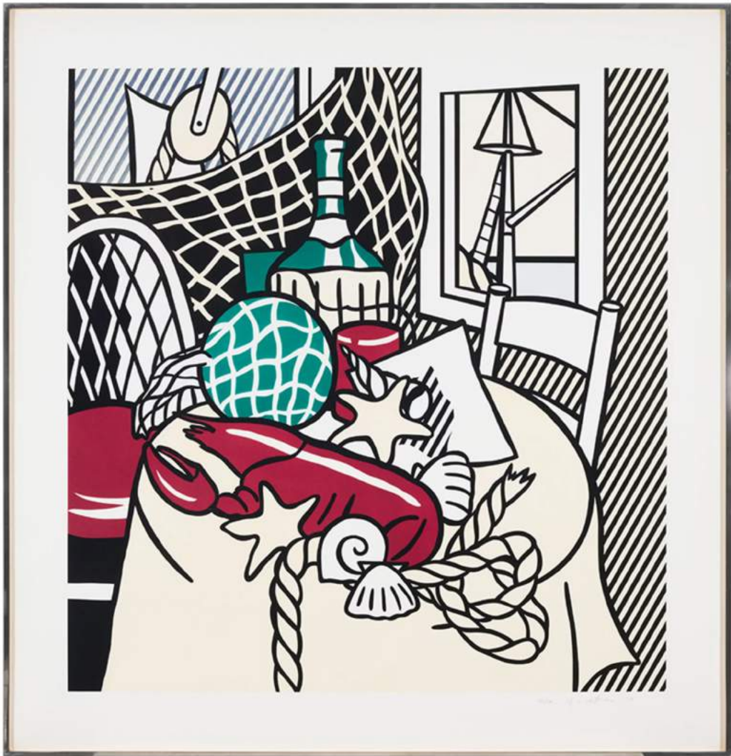
Roy Lichtenstein 'Still Life with Lobster' Color Lithograph & Silkscreen Limited Edition of 100 31 x 32 inches / 78.7 x 81.3 cm