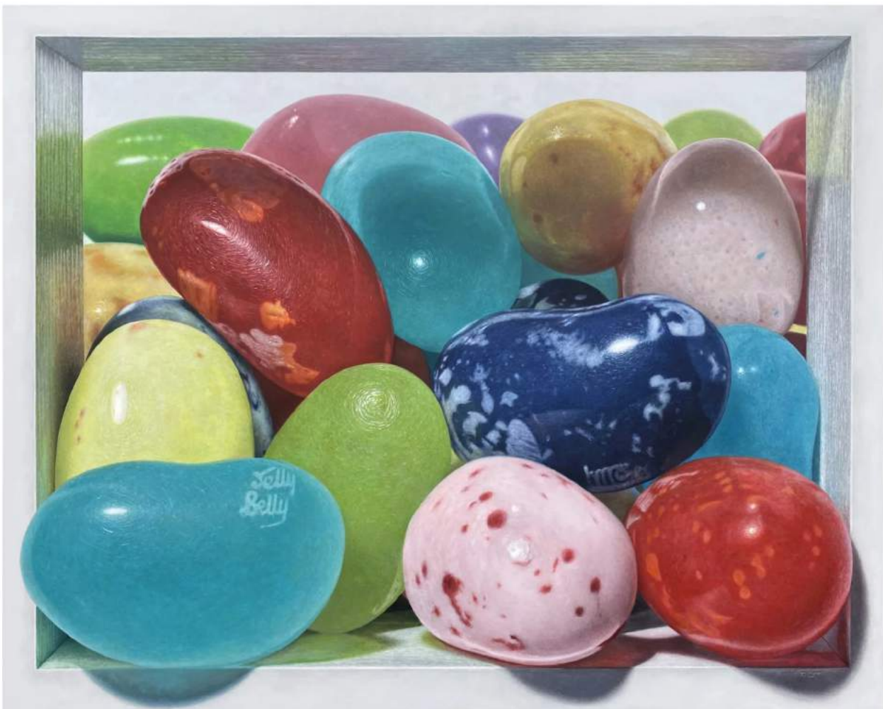
Gregory Haynes 'Jelly Pile' Oil o Panel 60 x 48 inches / 152.4 x 121.9 cm