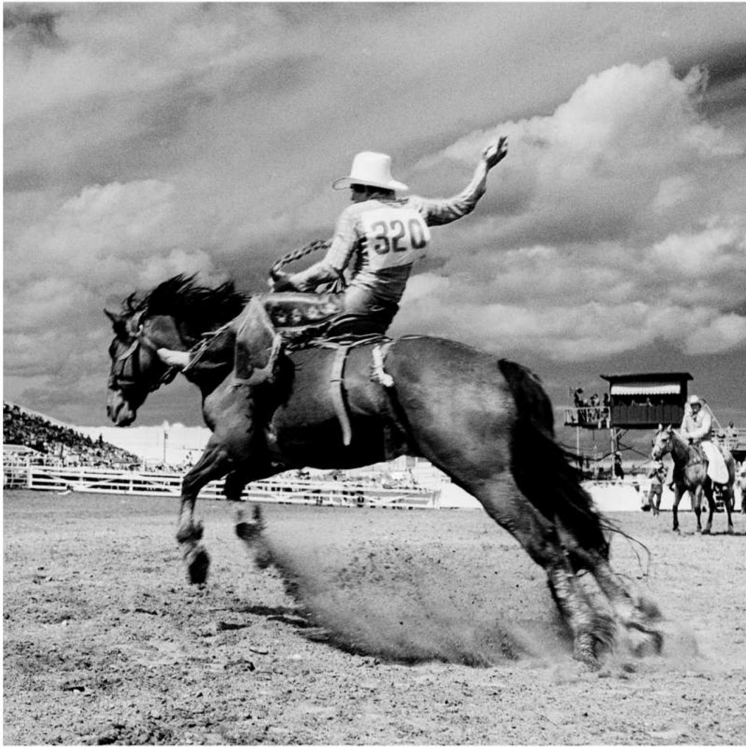
Albert Watson 'Cowboy on Horse, 1978' Archival Pigment Print Edition of 25 24 x 26 inches / 61 x 66 cm