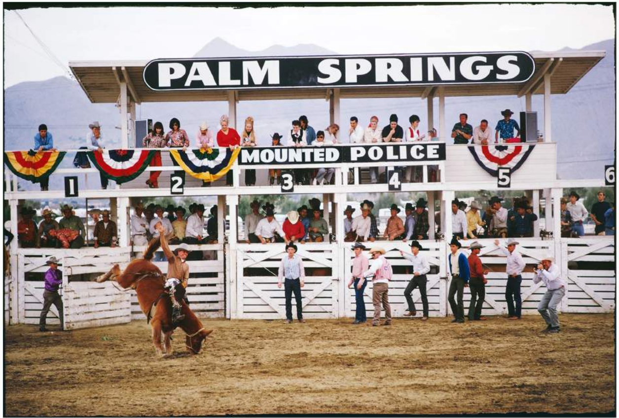
Slim Aarons 'Palm Springs Rodeo 1970' C-Type Print Edition of 150 60 x 40 inches / 152.4 x 101.6 cm