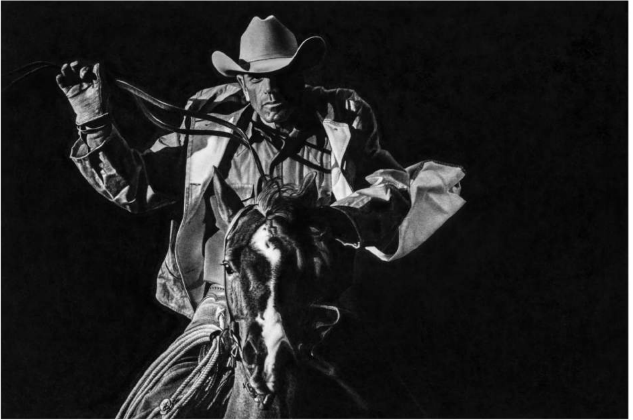
Hannes Schmid 'Cowboy #2' Charcoal on Paper 47.2 x 31.5 inches / 120 x 80 cm