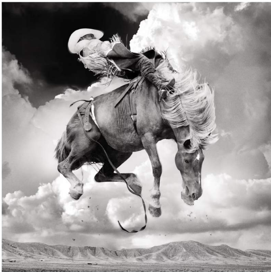
Steve Wrubel 'Talarosa' Archival Pigment Print Edition of 8 40 x 40 inches / 101.6 x 101.6 cm