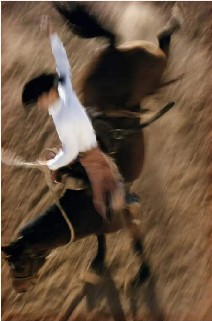
Ernst Haas 'Bronco Rider, California' Chromogenic Color Print Edition of 50 20 x 30 inches / 50.7 x 76.3 cm