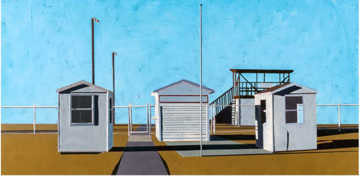
Mark Bradley-Shoup 'Athens Rodeo' Oil on Canvas 23.75 x 11.75 inches / 60.3 x 29.8 cm