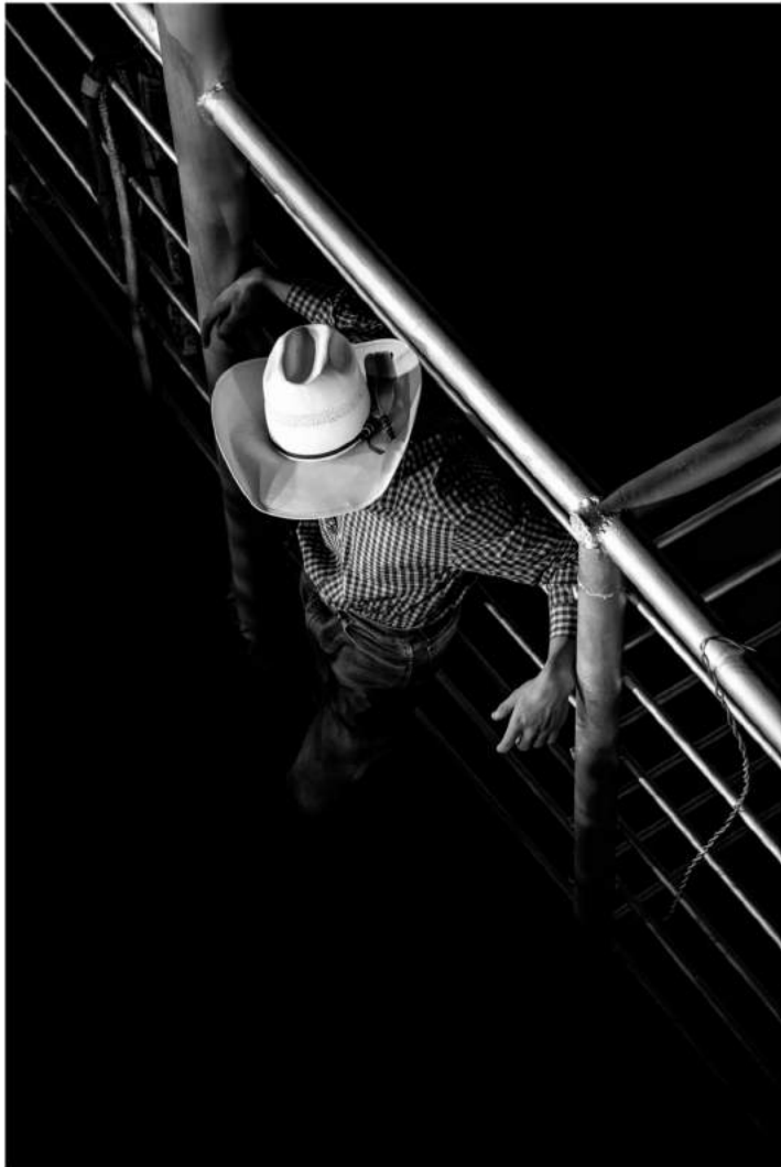
Anouk Masson Krantz 'Rodeo Cowboy' Archival Pigment Print Limited Edition 40 x 60 inches / 101.6 x 152.4 cm