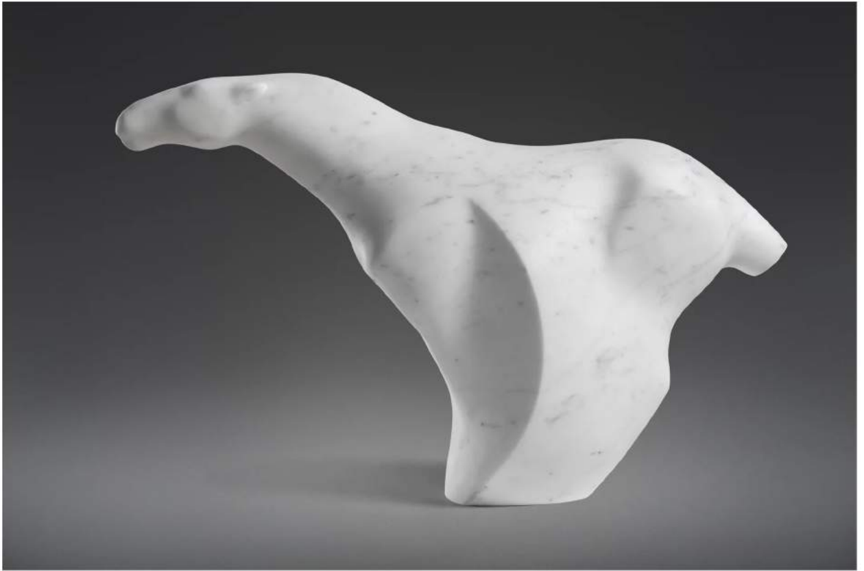
Khaled Zaki 'Unruly Horse' Marble 31.5 x 11.4 x 19.7 inches / 80 x 29 x 50 cm