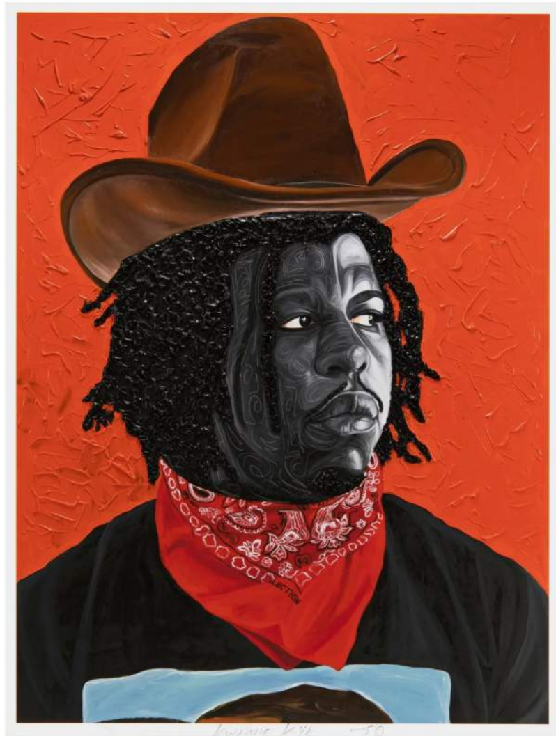
Otis Kwame Kye Quaicoe 'Jon Gray' Archival Pigment Print on Cotton Paper Edition of 50 7.9 x 9.8 inches / 20 x 25 cm