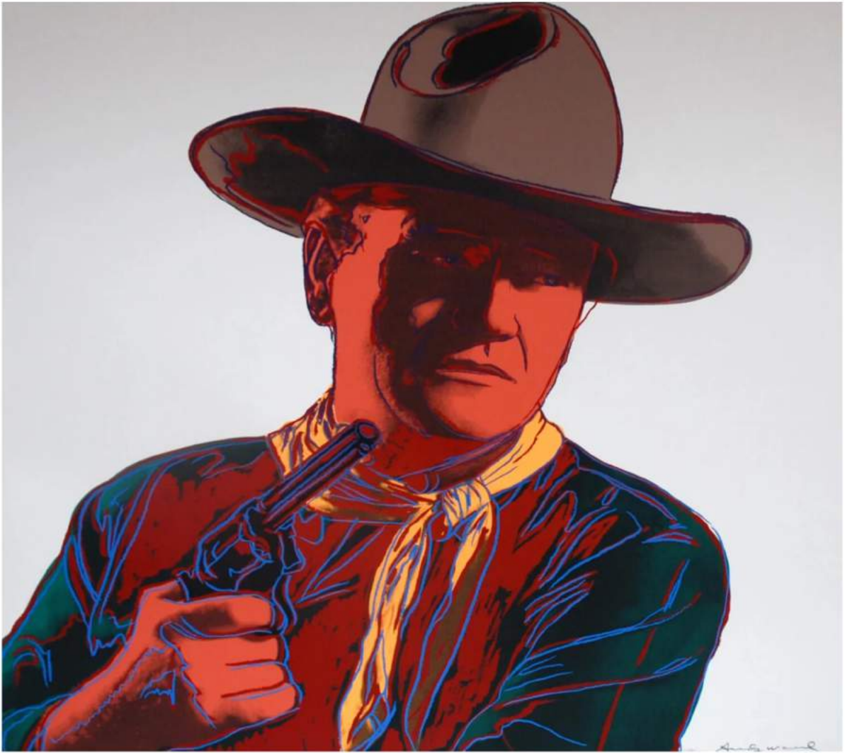
Andy Warhol 'John Wayne' Screenprint on Lenox Museum Board Edition of 250 36 x 36 inches / 91.4 x 91.4 cm