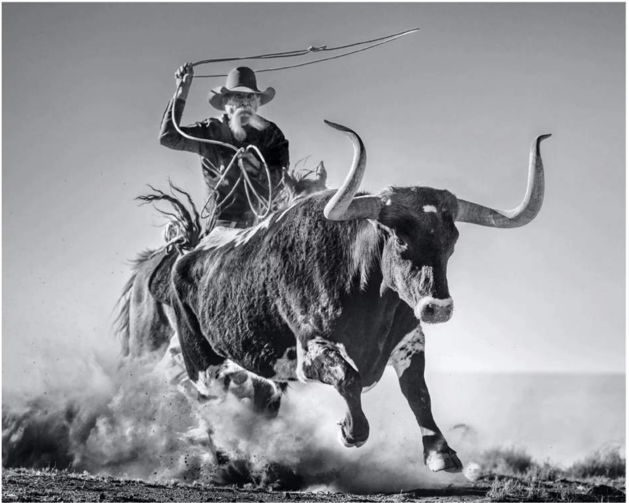
David Yarrow 'Ain't My First Rodeo' Archival Pigment Print Edition of 12 61 x 52 inches / 155 x 132 cm