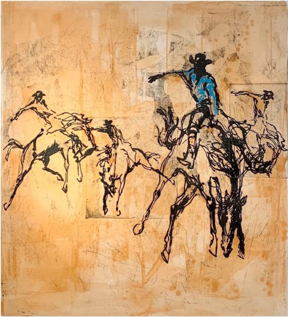
LeRoy Neiman 'Rodeo' Serigraph 16 x 19 inches / 40.6 x 48.3 cm