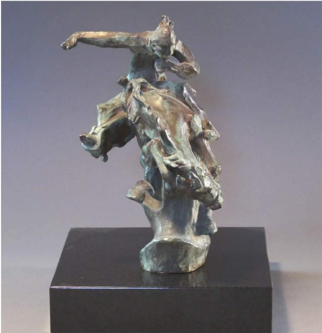
Allan Houser 'Cowboy Bronco Rider' Bronze 8 x 5 x 8 inches / 20.3 x 12.7 x 20.3 cm