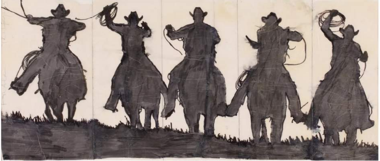
Robert Longo 'Study for Five Cowboys' Grey & Black Ink and Graphite on Tracing Paper 28.1 x 12 inches / 71.5 x 30.5 cm