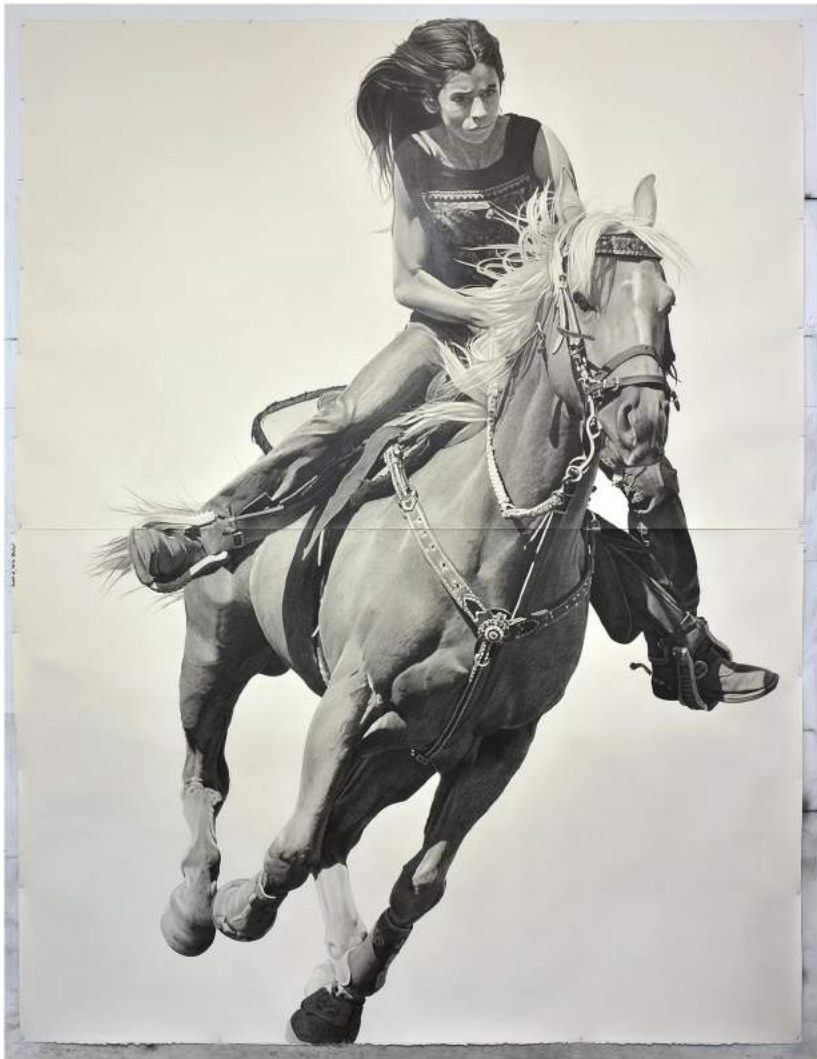
Karl Haendel 'Rodeo 4' Graphite on Paper 78 x 103.1 inches / 198 x 262 cm