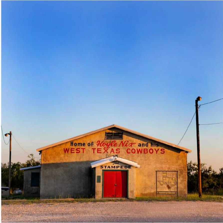
Jill Johnson 'The Stampede, Big Spring, Texas' Chromogenic Color Print 50 x 50 inches / 127 x 127 cm